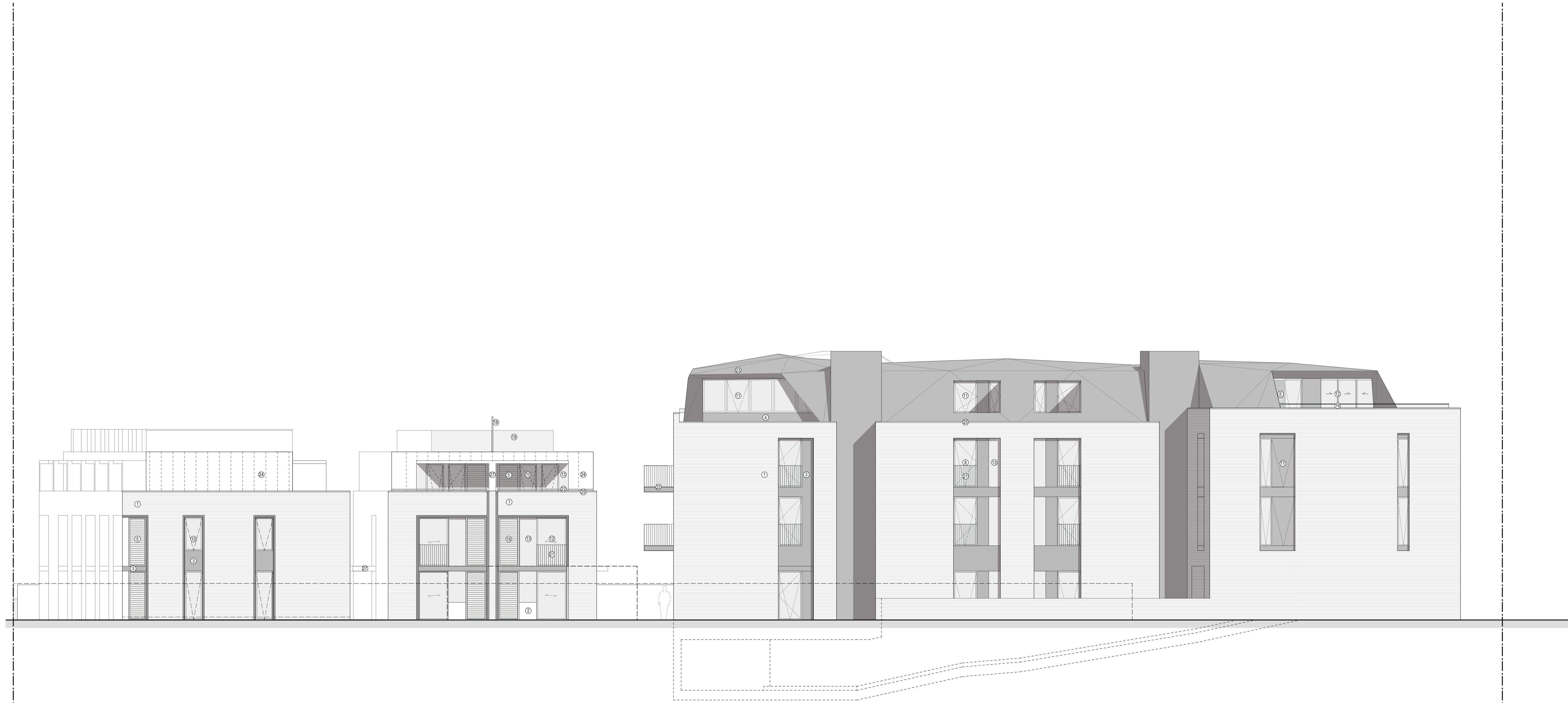
PROPOSED ELEVATION B - SOUTH SIDE ELEVATION