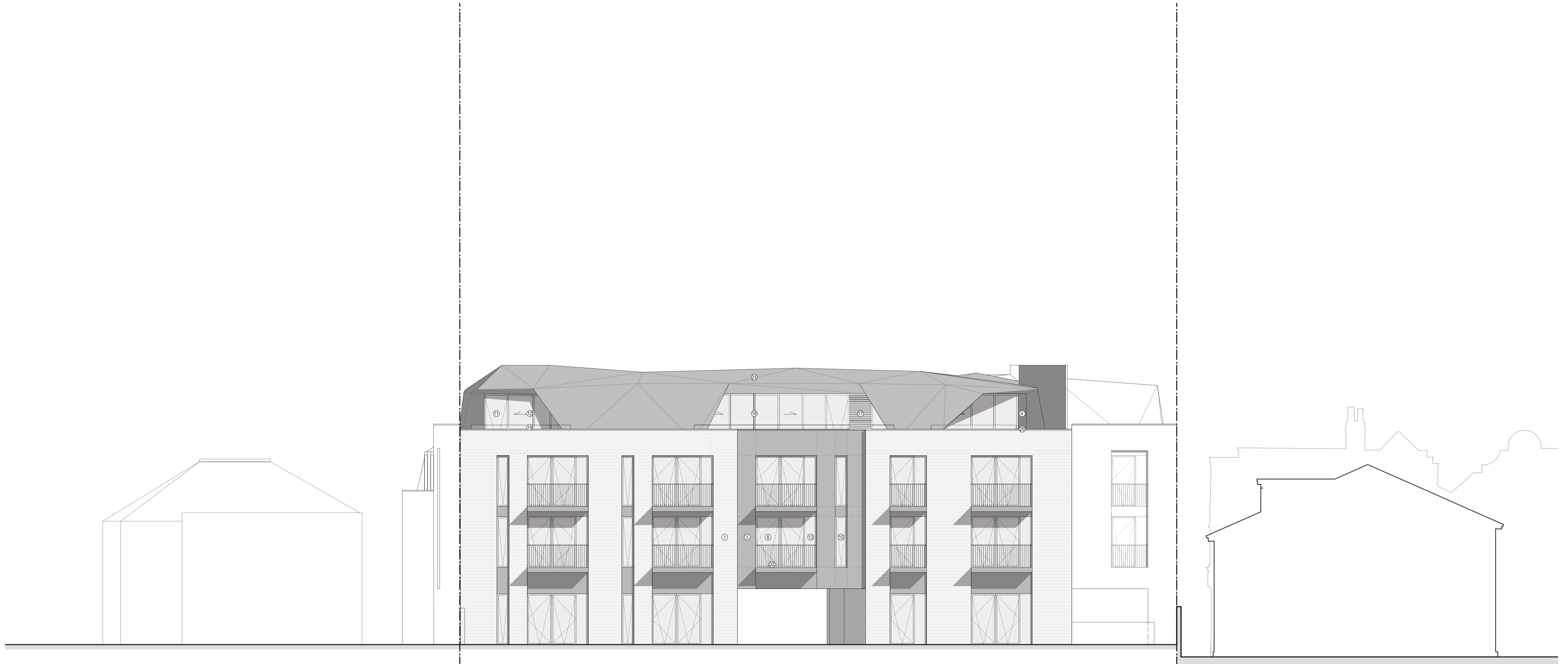
PROPOSED ELEVATION C - WEST GARDEN ELEVATION