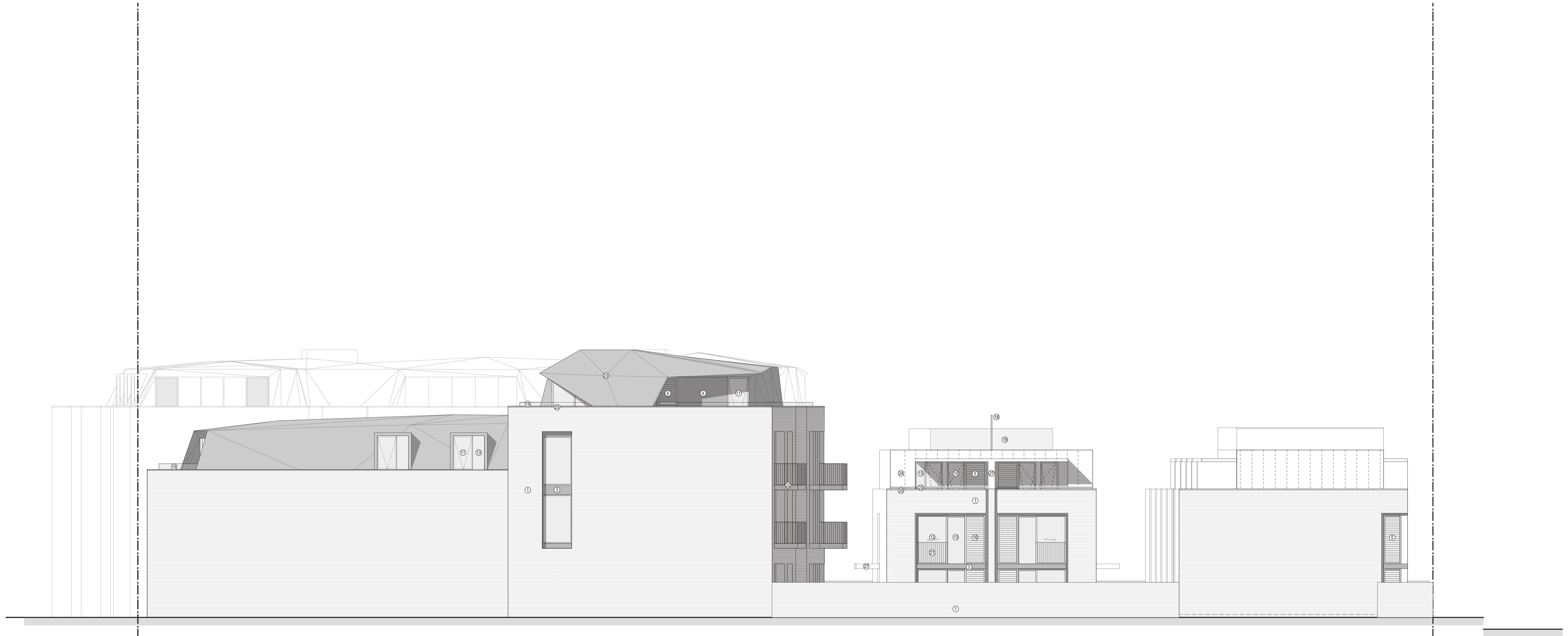
PROPOSED ELEVATION D - NORTH SIDE ELEVATION