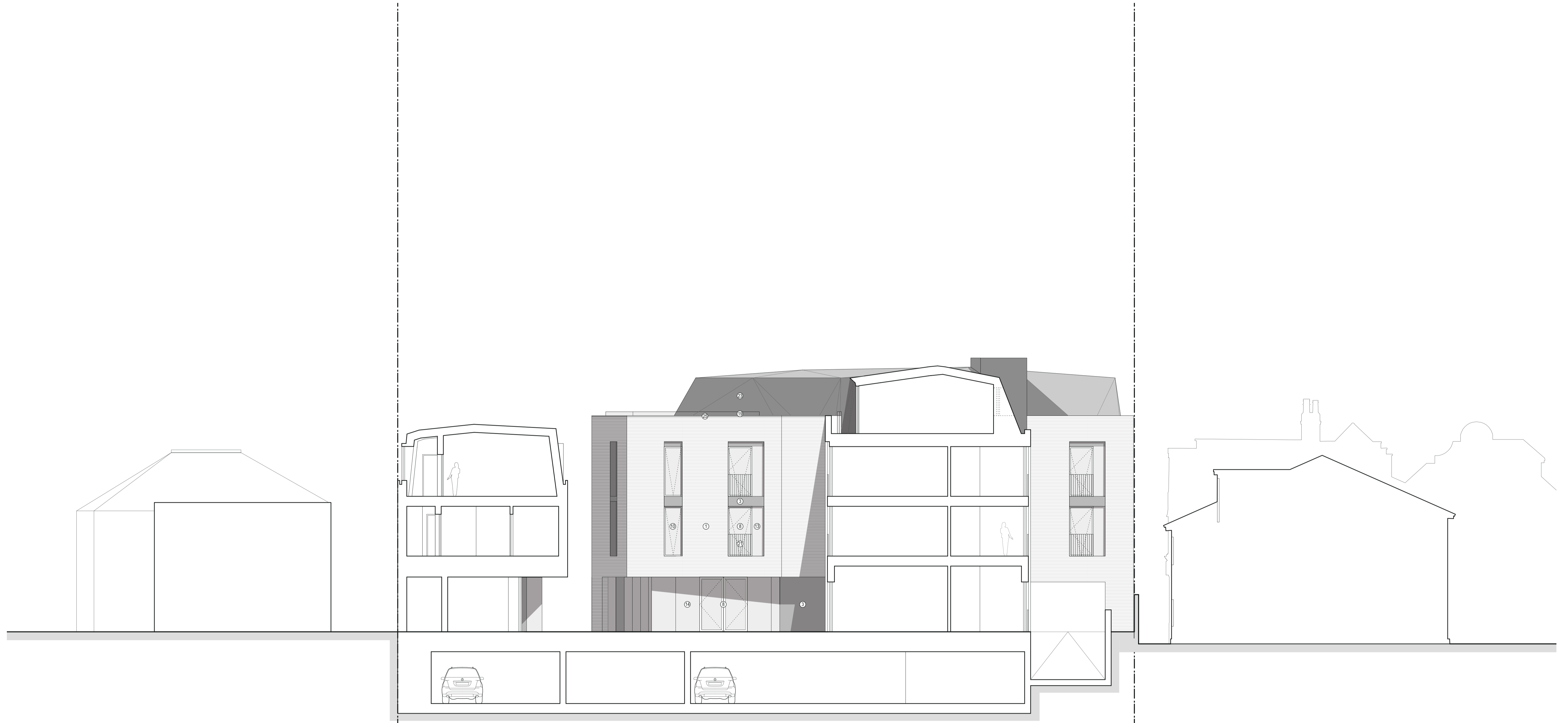
PROPOSED ELEVATION SECTION I - COURTYARD WEST ELEVATION