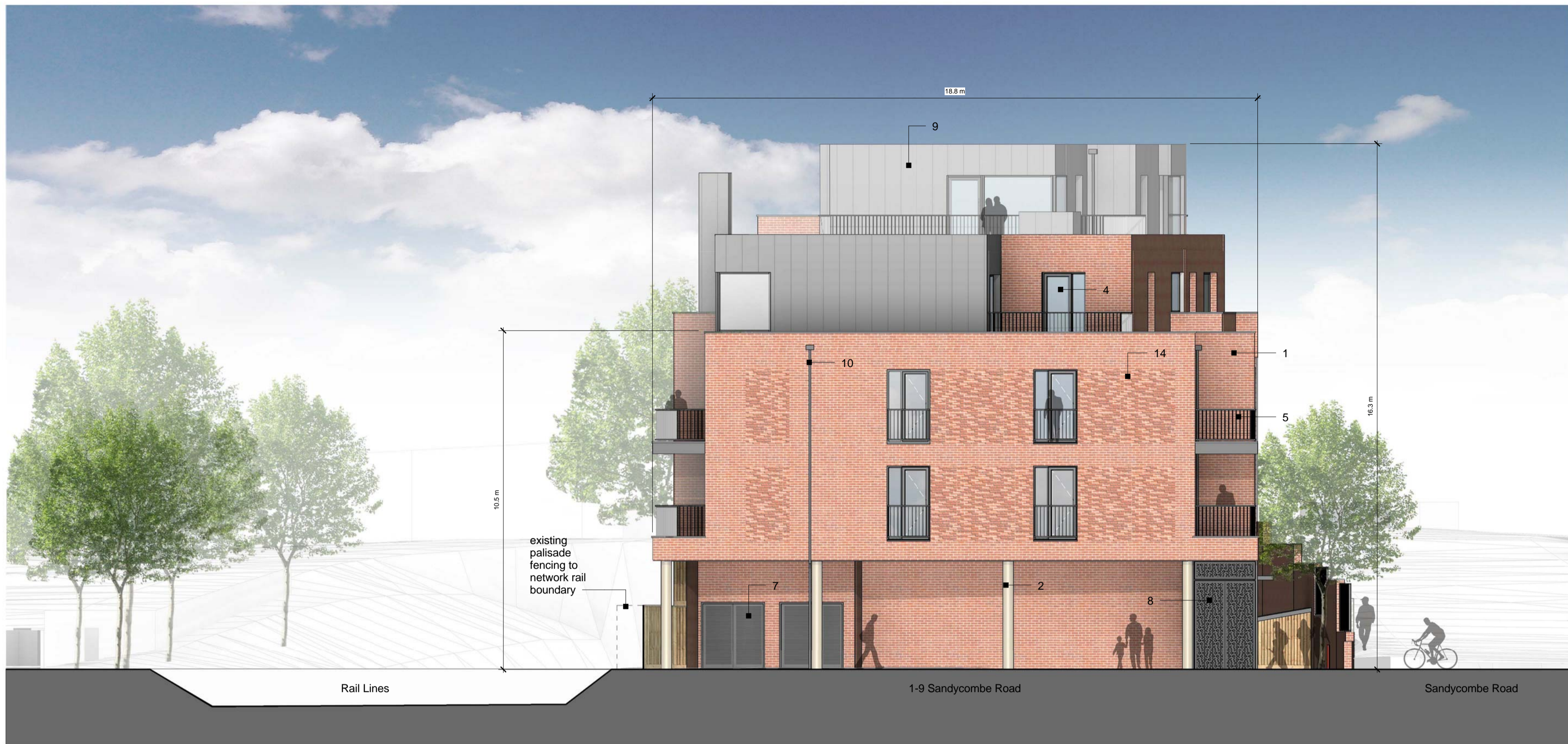
NORTH ELEVATION 3 - 3 SCALE 1 : 100