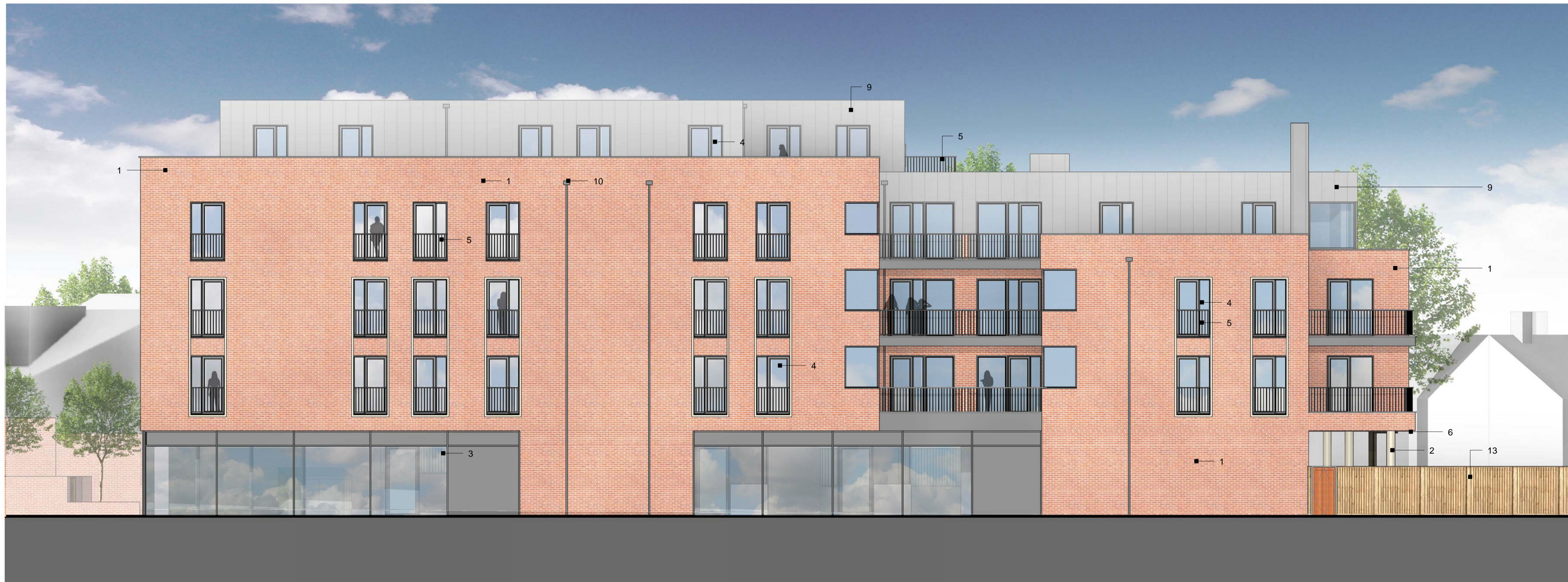
EAST ELEVATION 4 - 4 SCALE 1 : 100