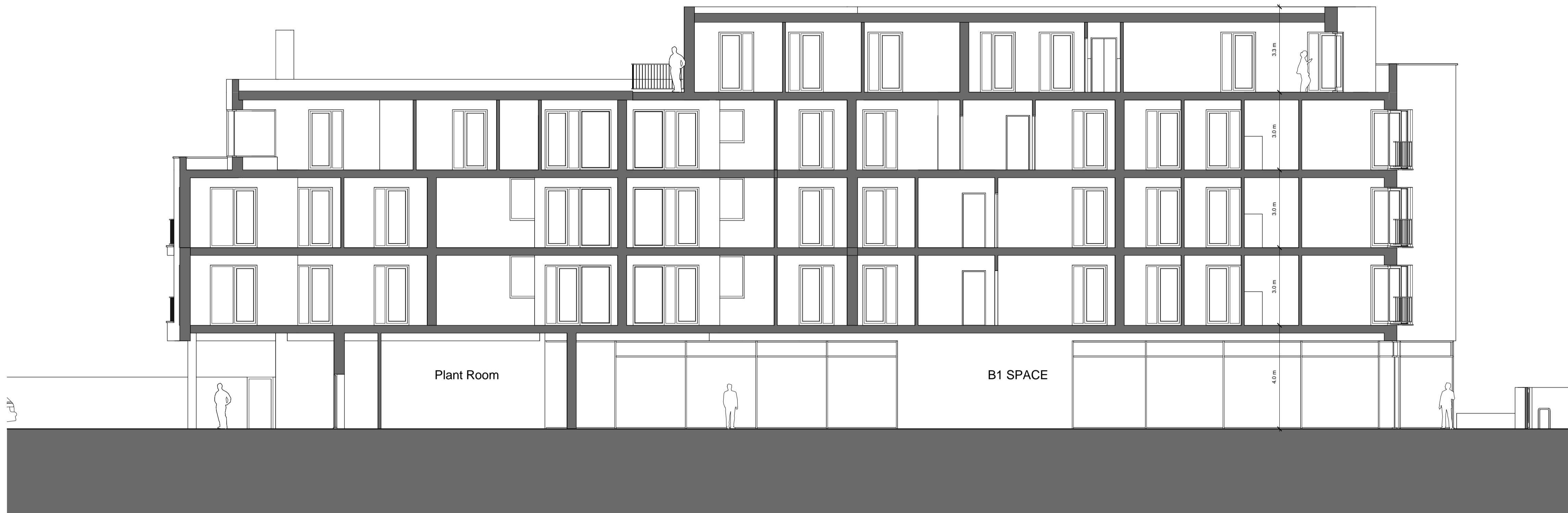
LONG BUILDING SECTION 1-100 (NORTH - SOUTH) SCALE 1 : 100