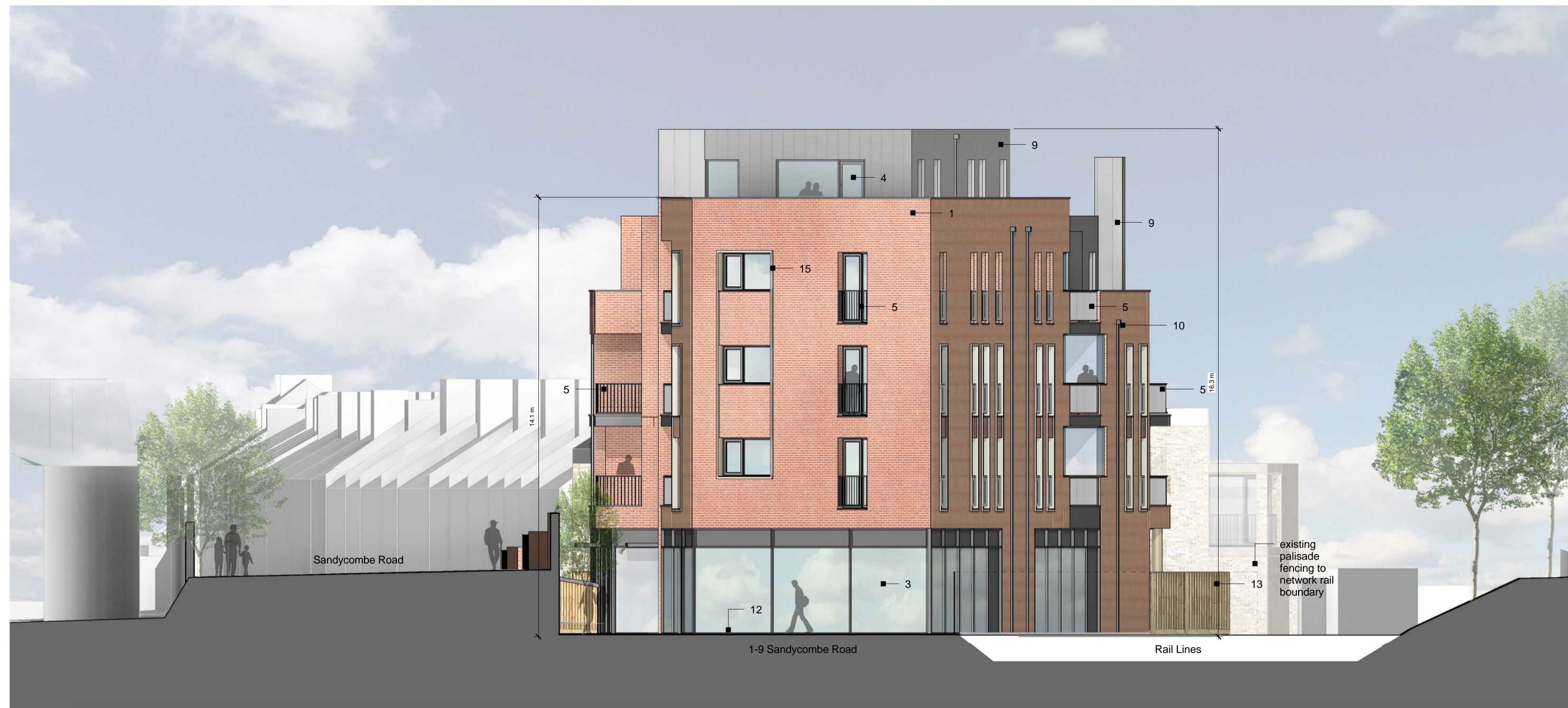
SOUTH ELEVATION 1 - 1 SCALE 1 : 100