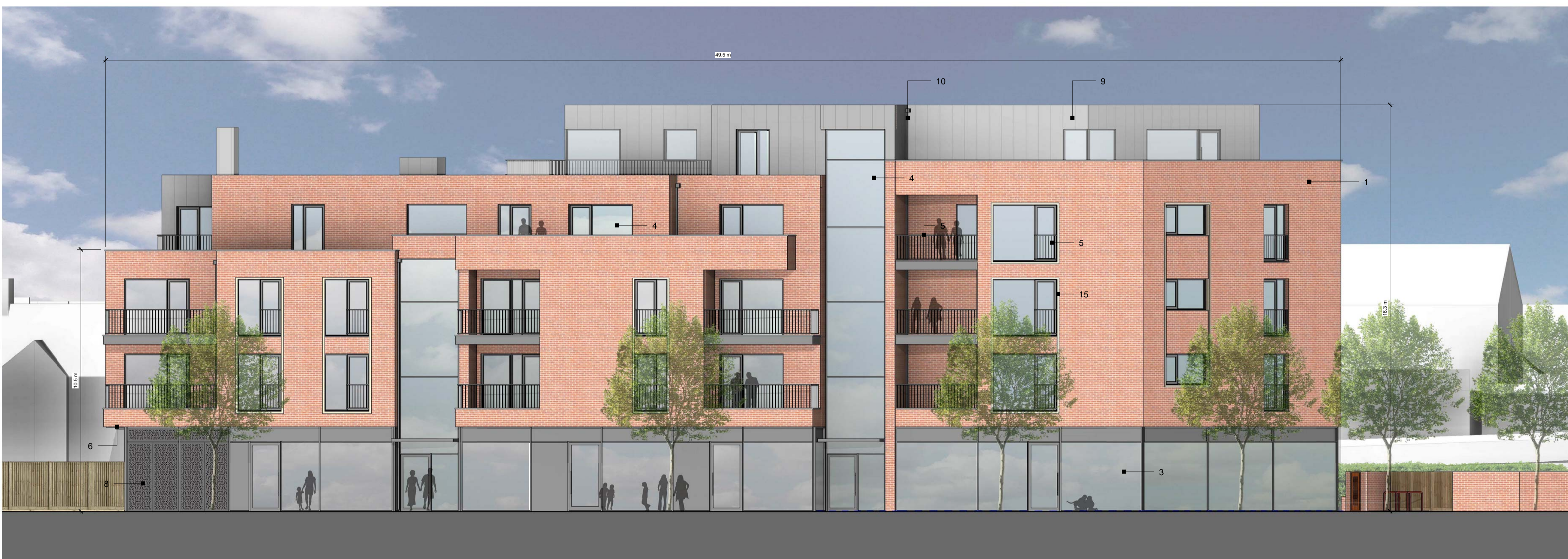
WEST ELEVATION 2 - 2 SCALE 1 : 100