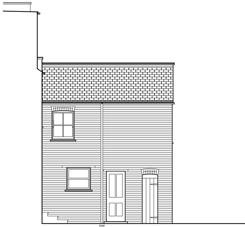
SIDE ELEVATION As existing