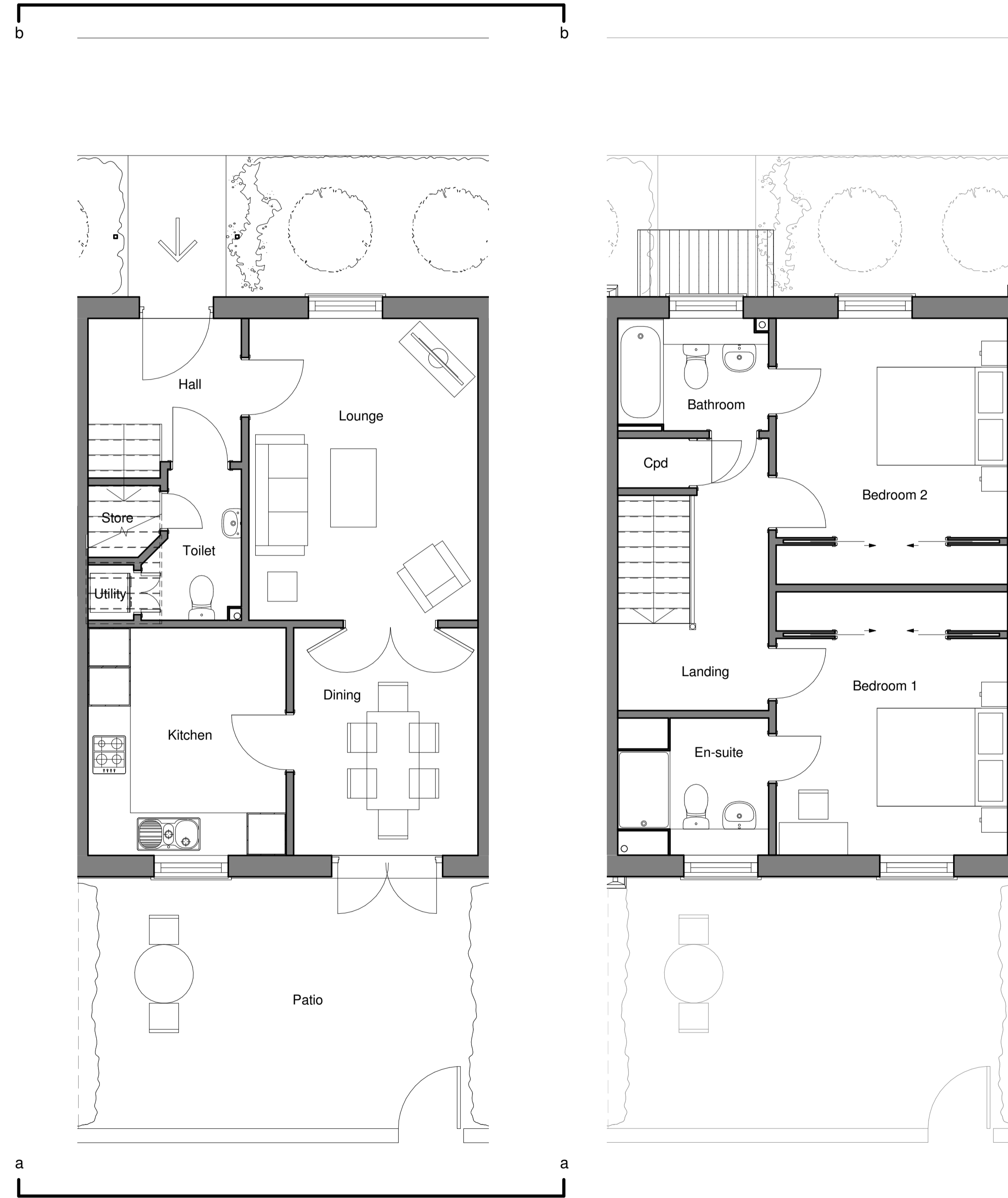
Level 0 - House Type 2 1 : 50