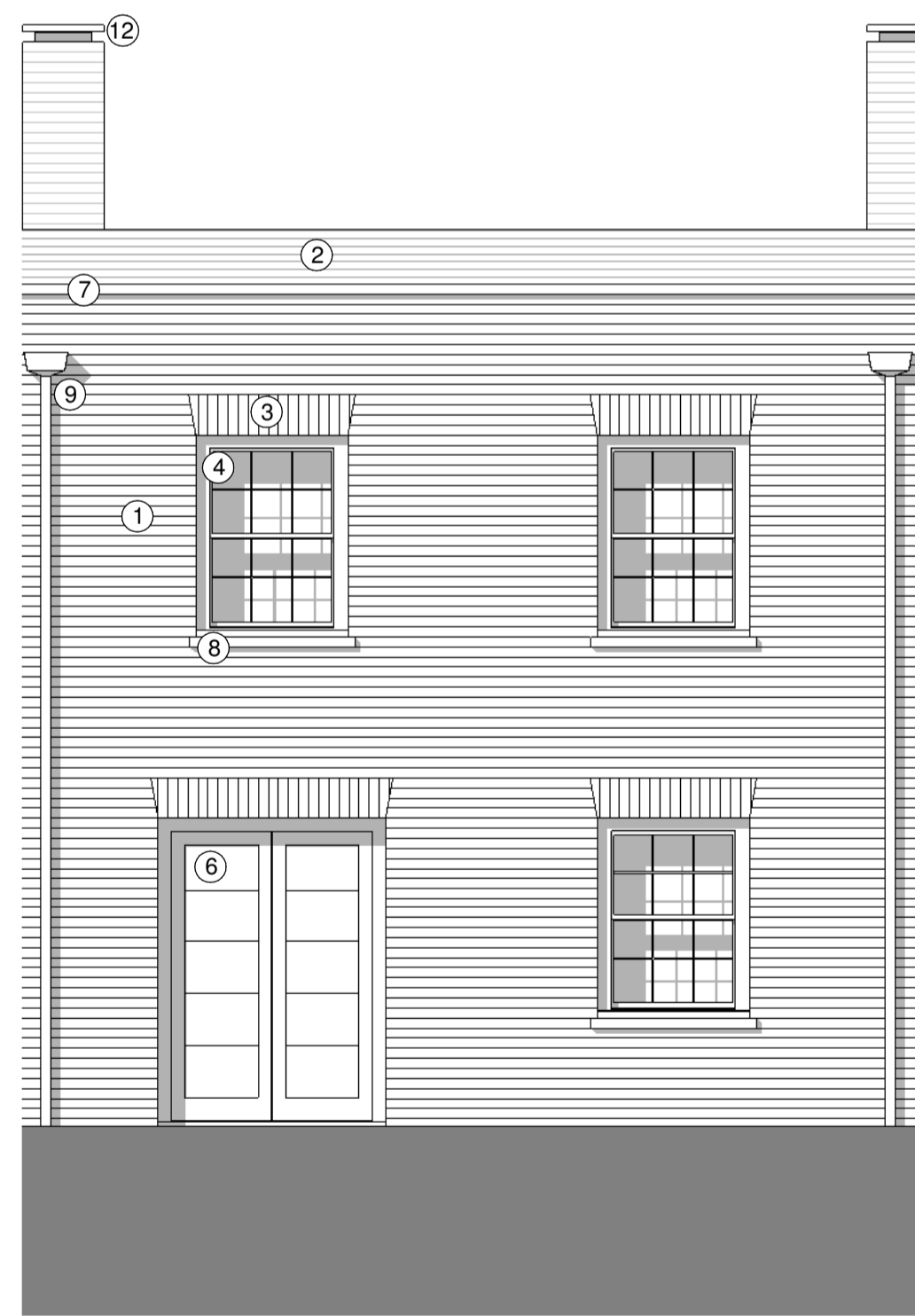
House Type 2 - Elevation b 1 : 50