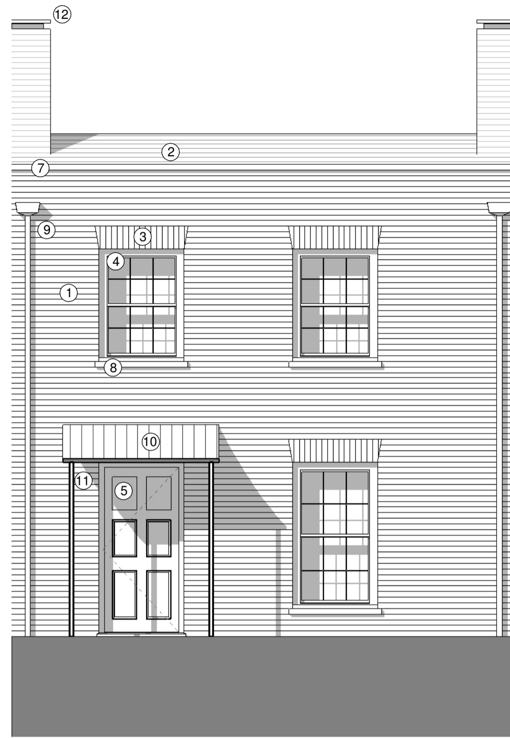
House Type 2 - Elevation a 1 : 50