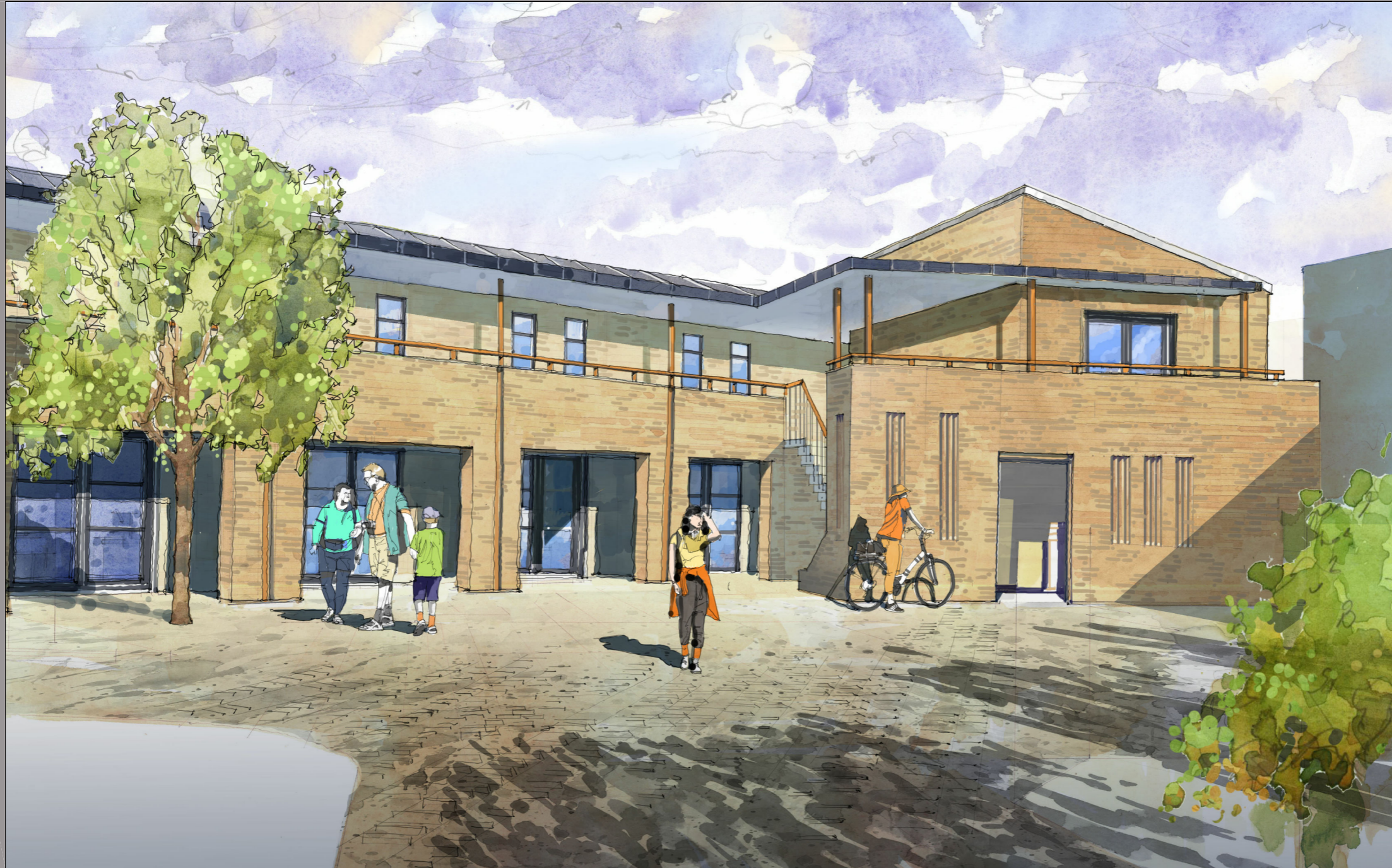
VIEW INTO COURTYARD FROM ARCHWAY FROM CHURCH ROAD

This drawing is the property of AMA Architects Ltd. Copyright reserved.