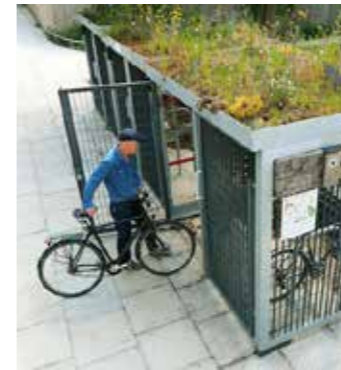
Cycling security store with green roof