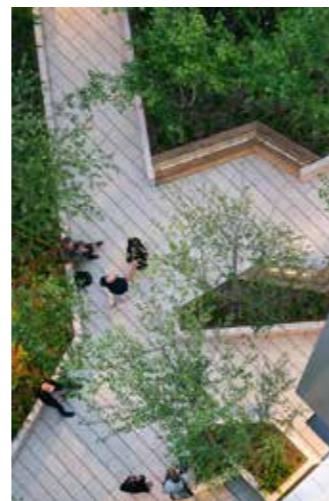
Seating integrated into landscape