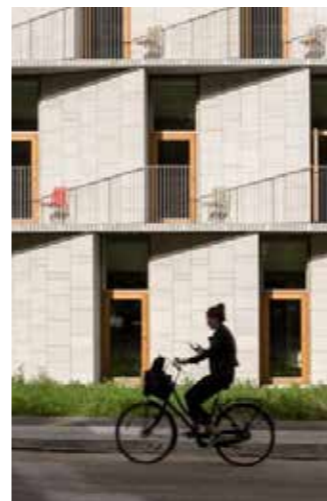
Hedge acting as defensible space