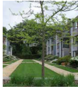
Young trees greening the landscape