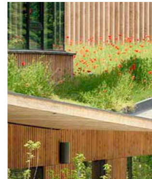
Biodiverse (brown) roof