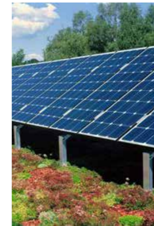
PV panels (10 degree tilt)