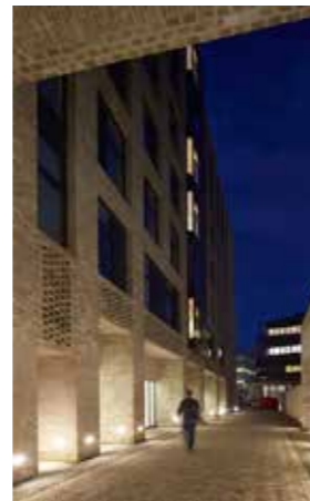
Floor lights & shared space