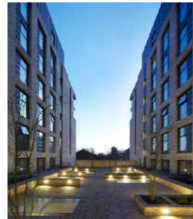
Existing hard surface