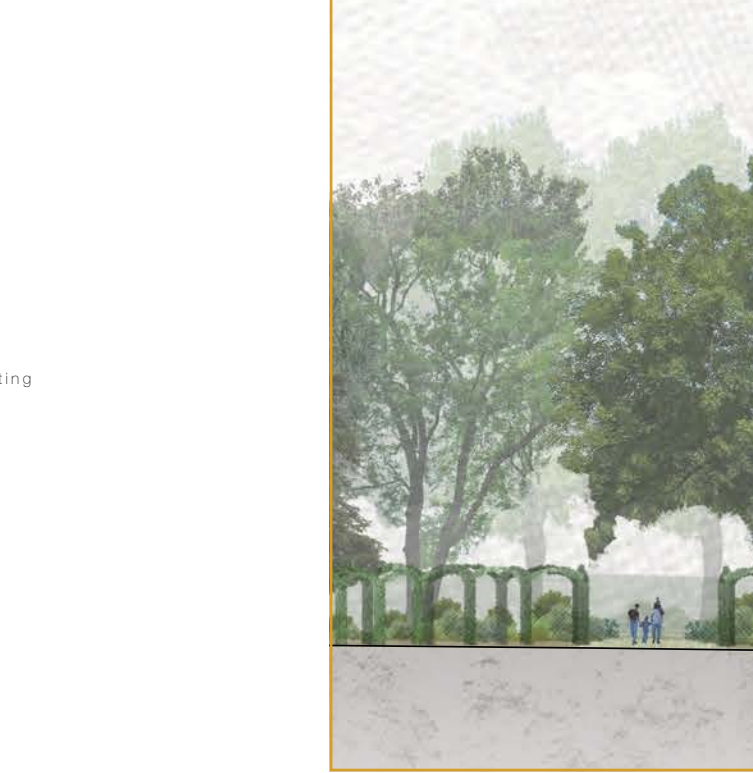
Detail of north-south proposed landscape section through the Pleasure Grounds including planted palisade