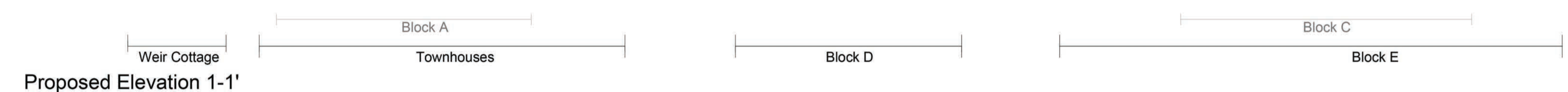
Proposed Elevation 1-1'