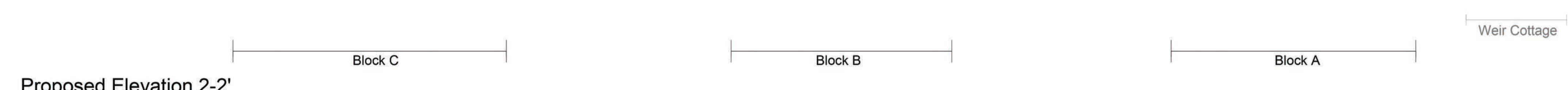
Proposed Elevation 2-2'