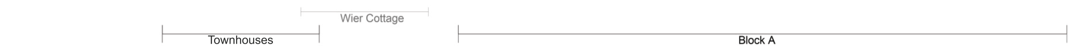
Proposed Elevation 3-3'