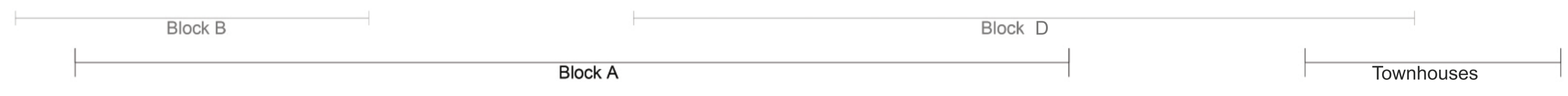
Proposed Elevation 4-4'