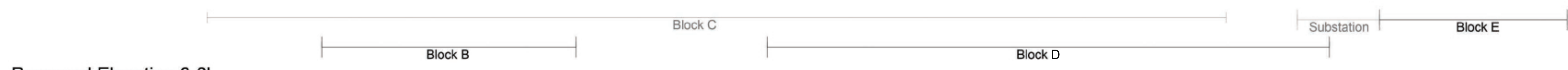
Proposed Elevation 6-6'