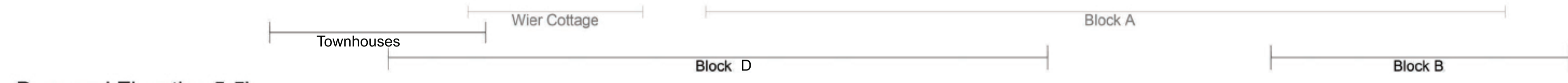
Proposed Elevation 5-5'