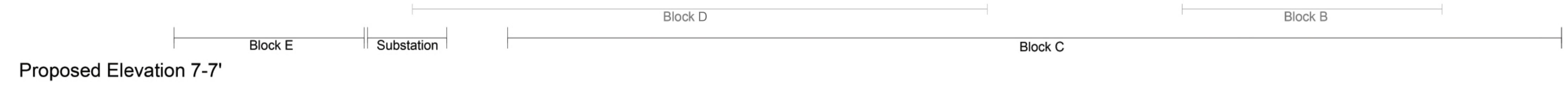
Proposed Elevation 7-7'