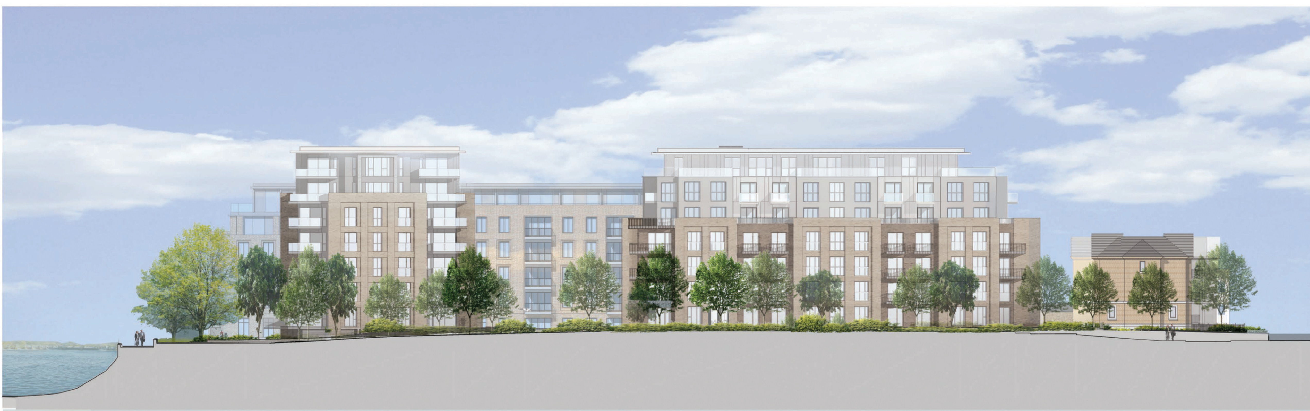
Proposed Elevation 6-6'