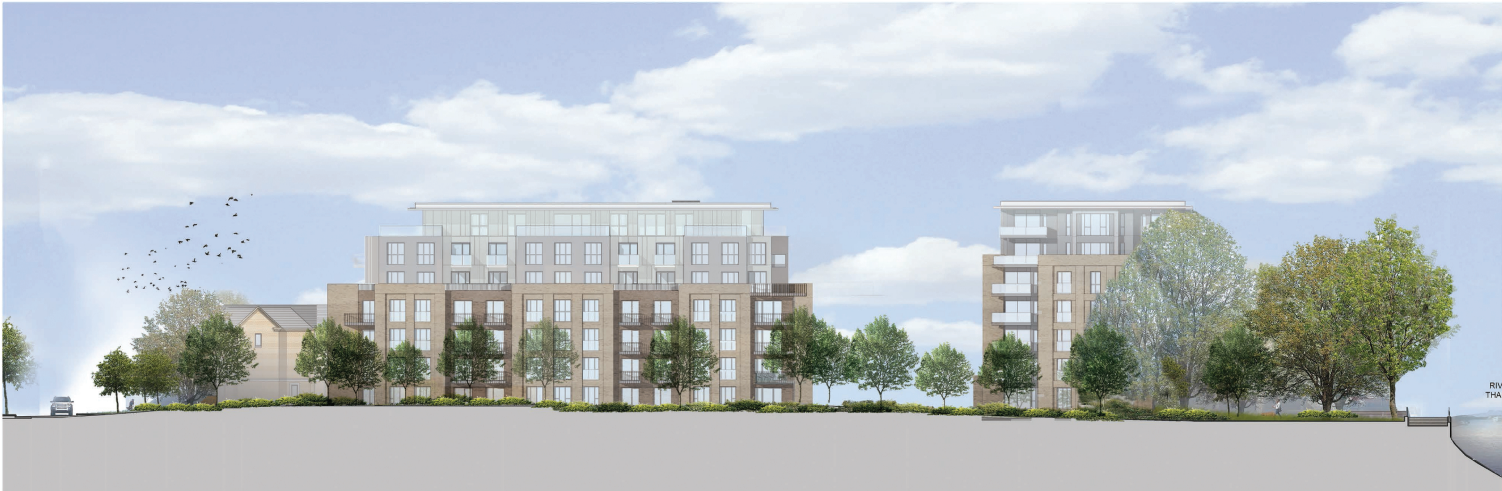
Proposed Elevation 5-5'