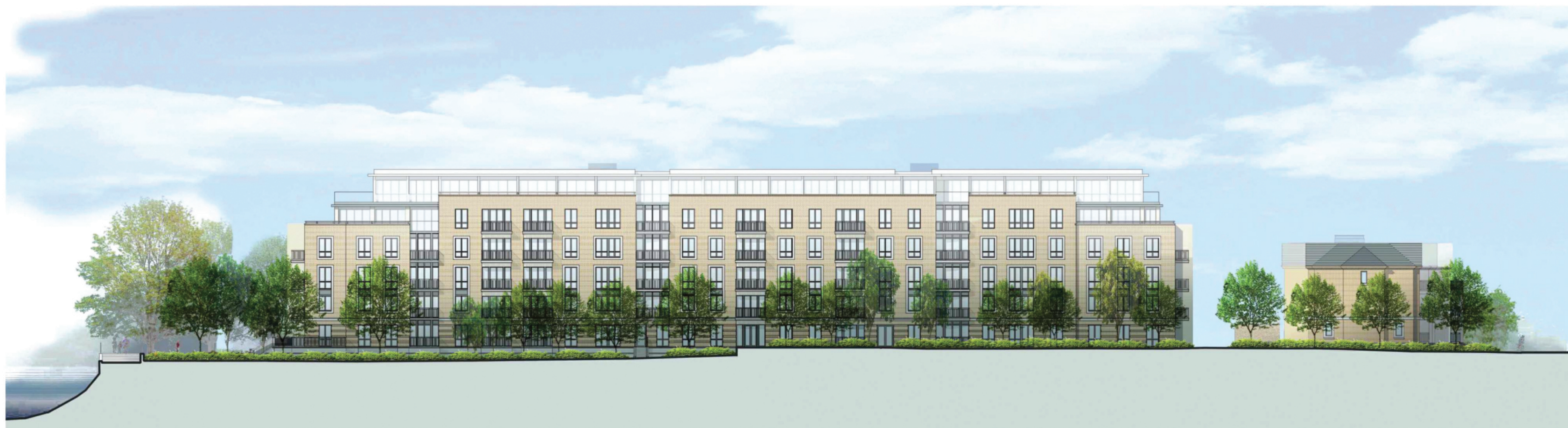
Proposed Elevation 8-8'