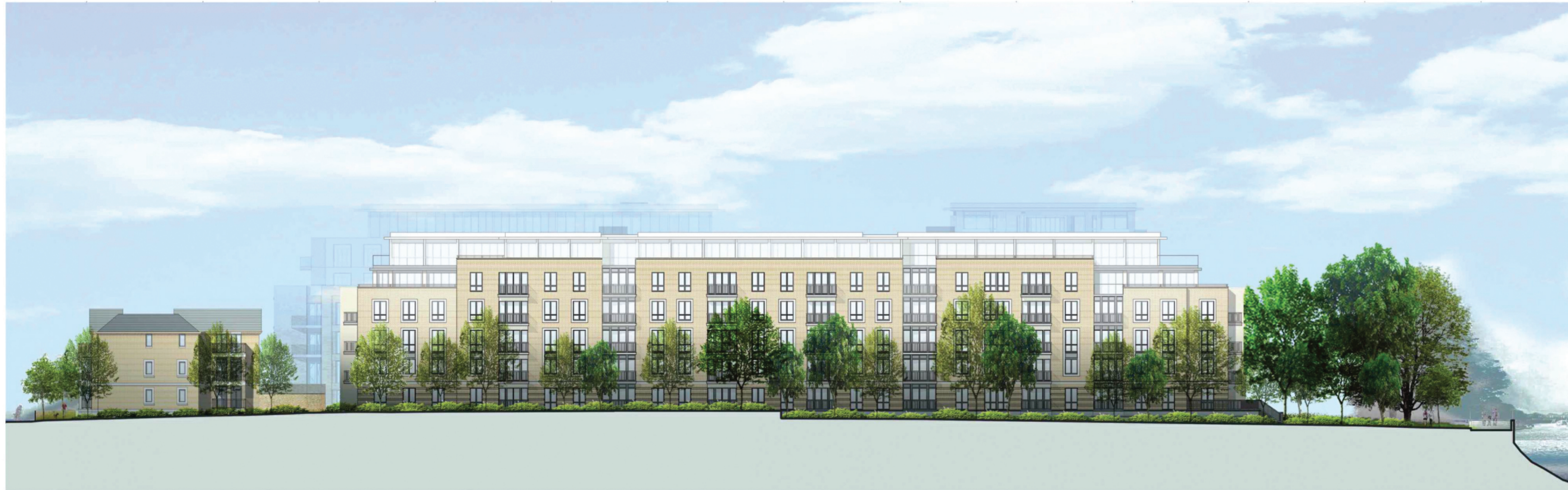
Proposed Elevation 7-7'