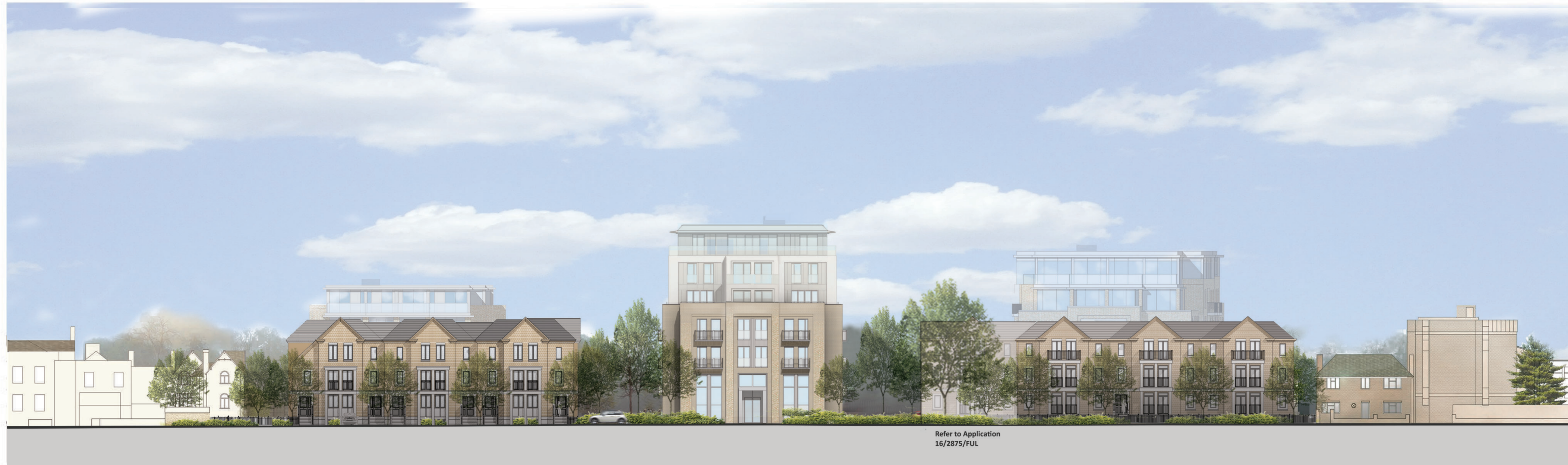
Refer to Application 16/2875/FUL