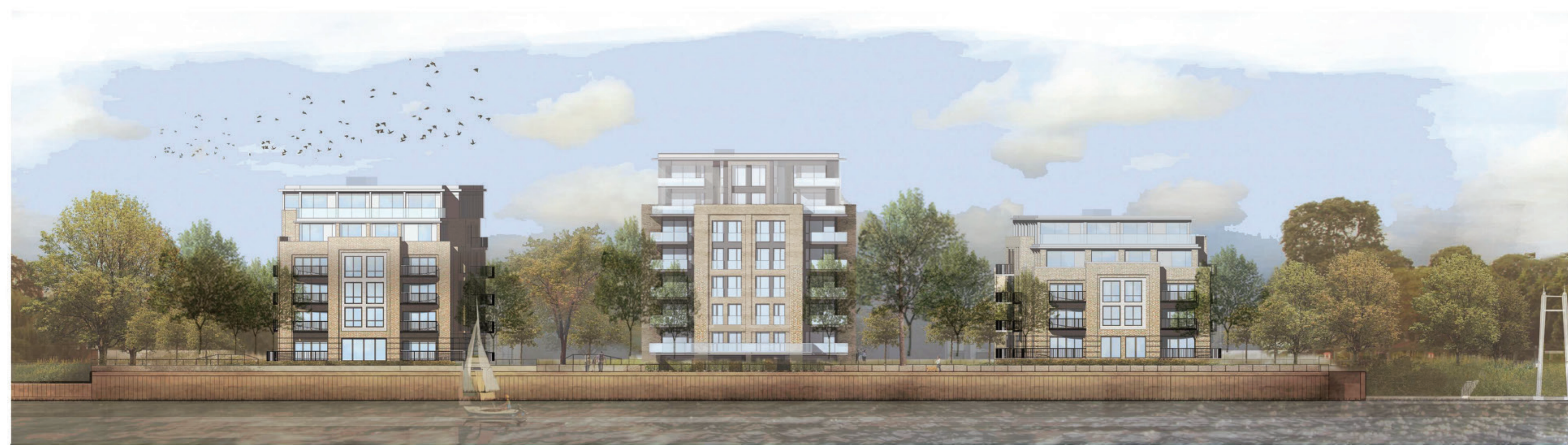
Proposed Elevation 2-2'