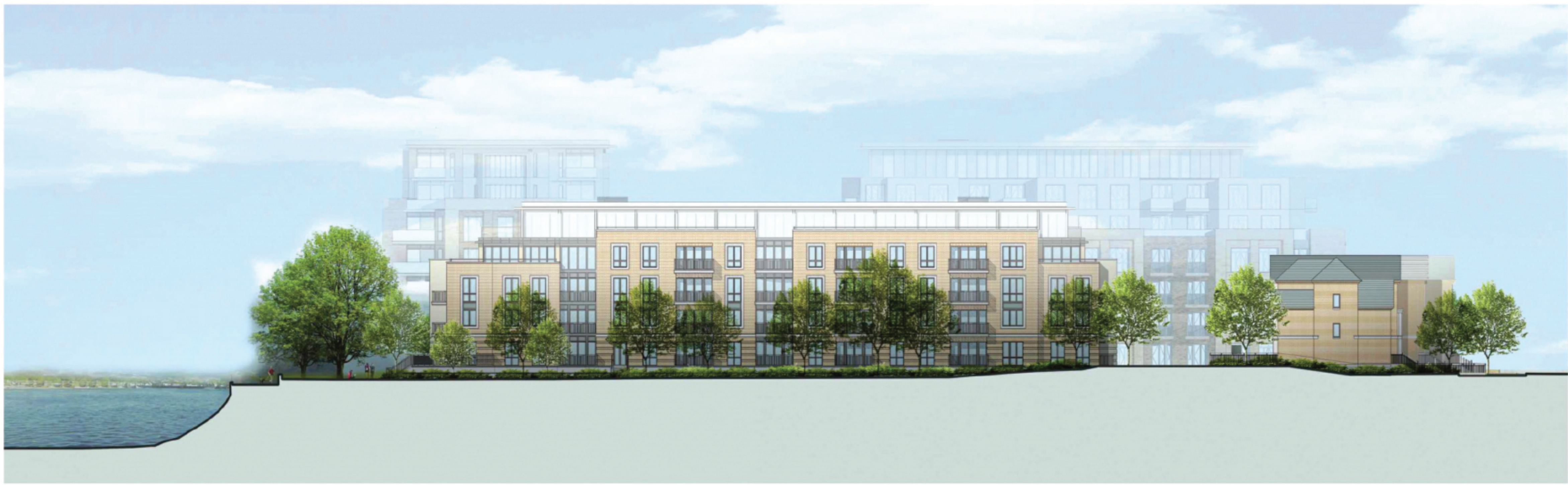
Proposed Elevation 4-4'