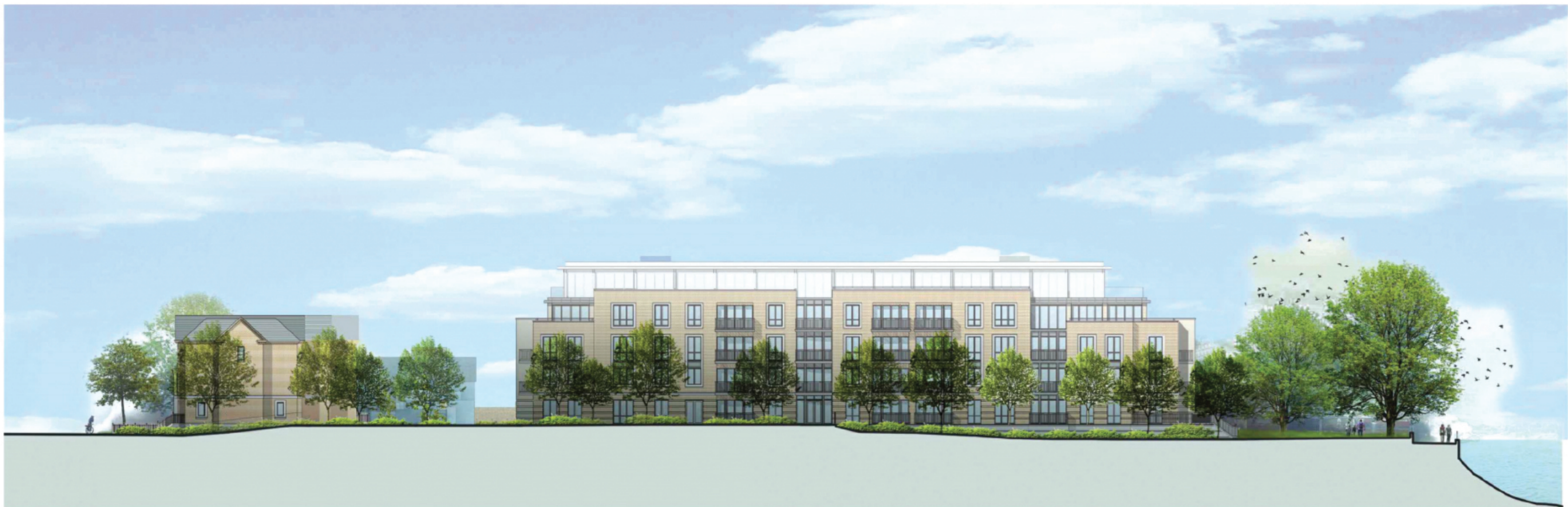
Proposed Elevation 3-3'