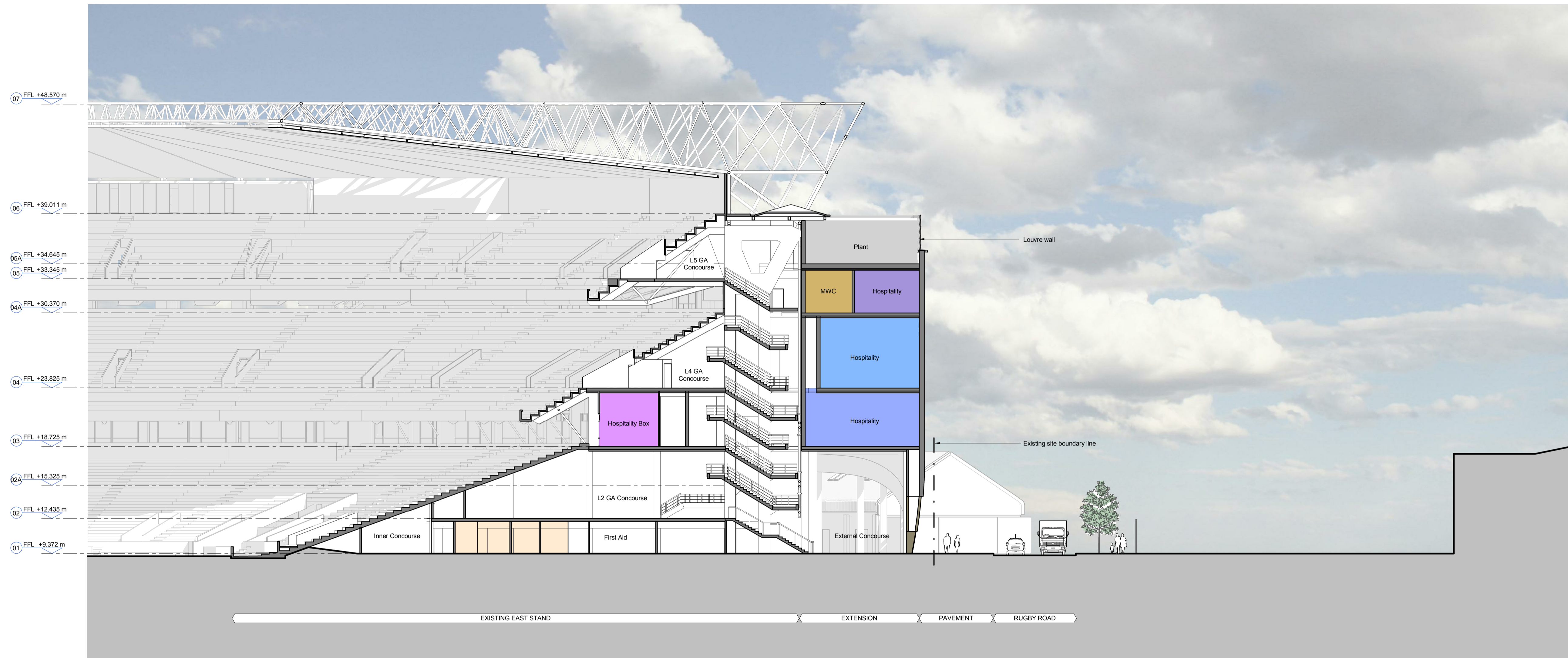
1 SECTION A SECTION GA 1 : 200