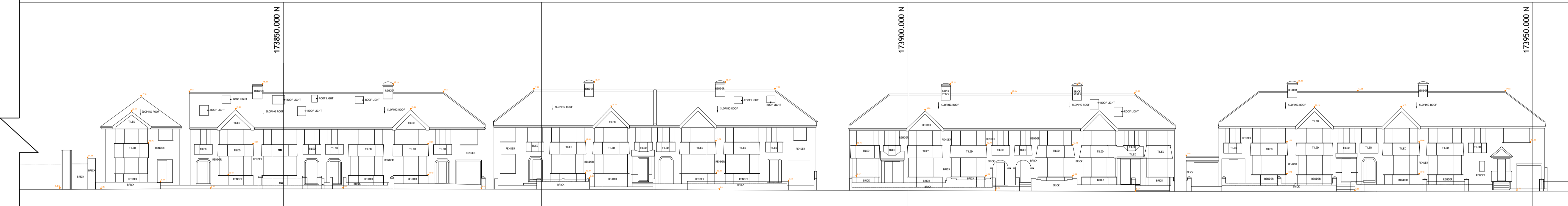
7 Elevation G-G Scale: 1:200 @ A1 / 1:400 @ A3