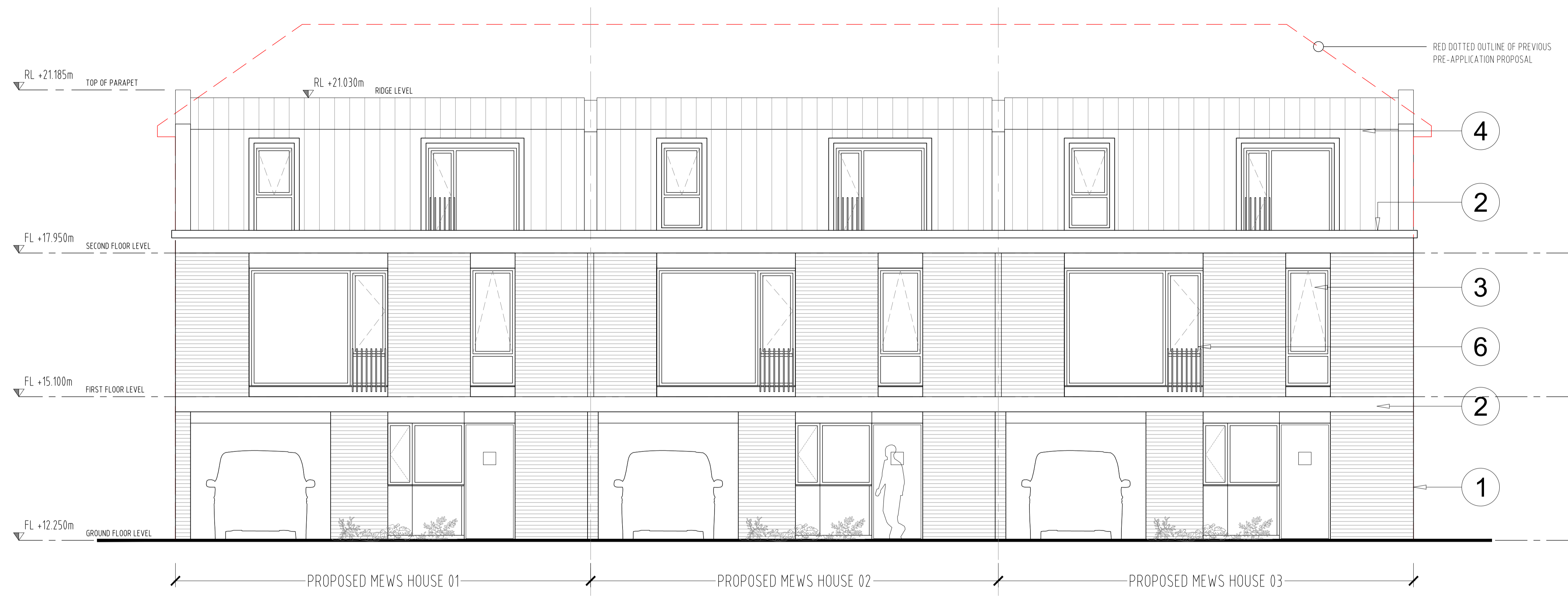
01 FRONT ELEVATION - PROPOSED SCALE 1:50 @ A1 (PL)700