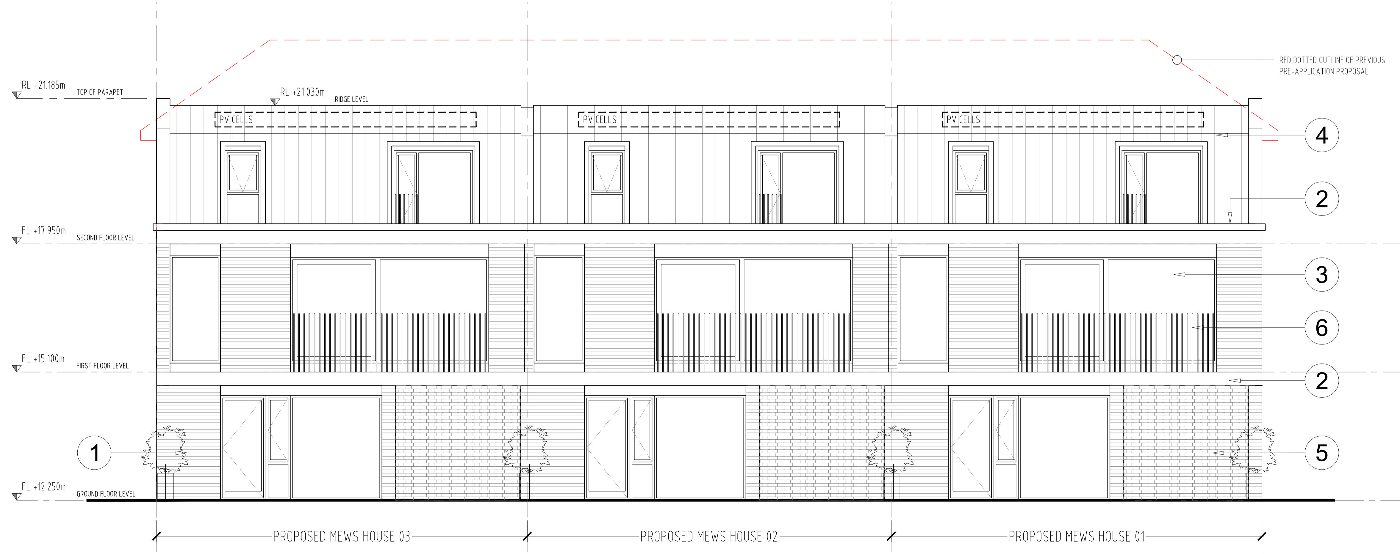
02 REAR ELEVATION - PROPOSED SCALE 1:50 @ A1 (PL)700