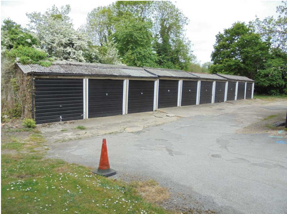
Plate 1: Garages proposed for development