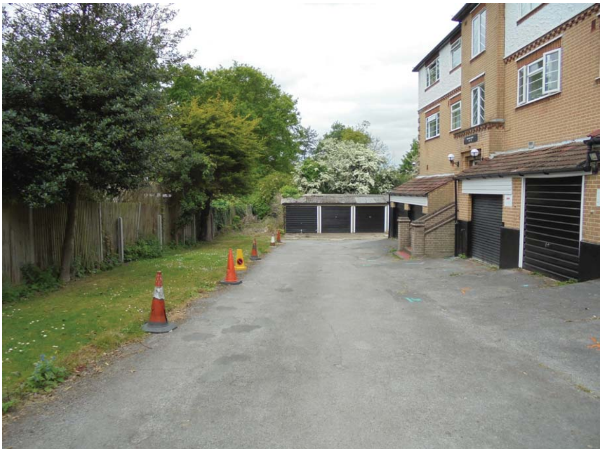
Plate 2: Garages at end of Churchview Road