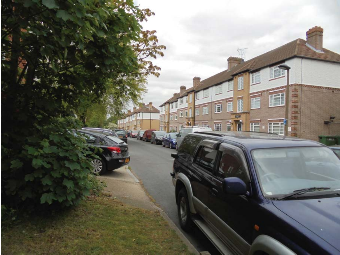
Plate 3: View towards development site from Site 3: Church of All Saints