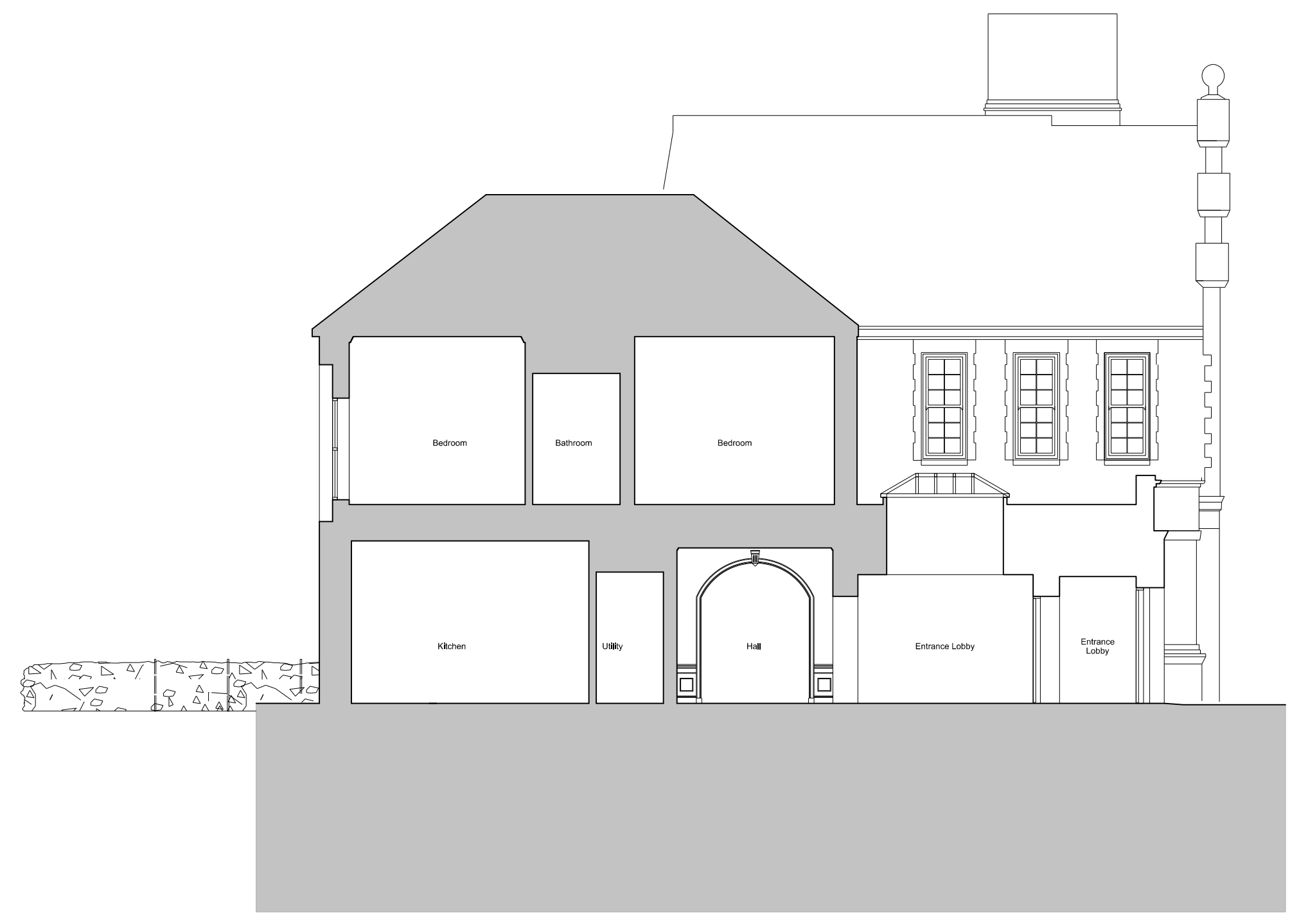
03 PROPOSED SECTION C