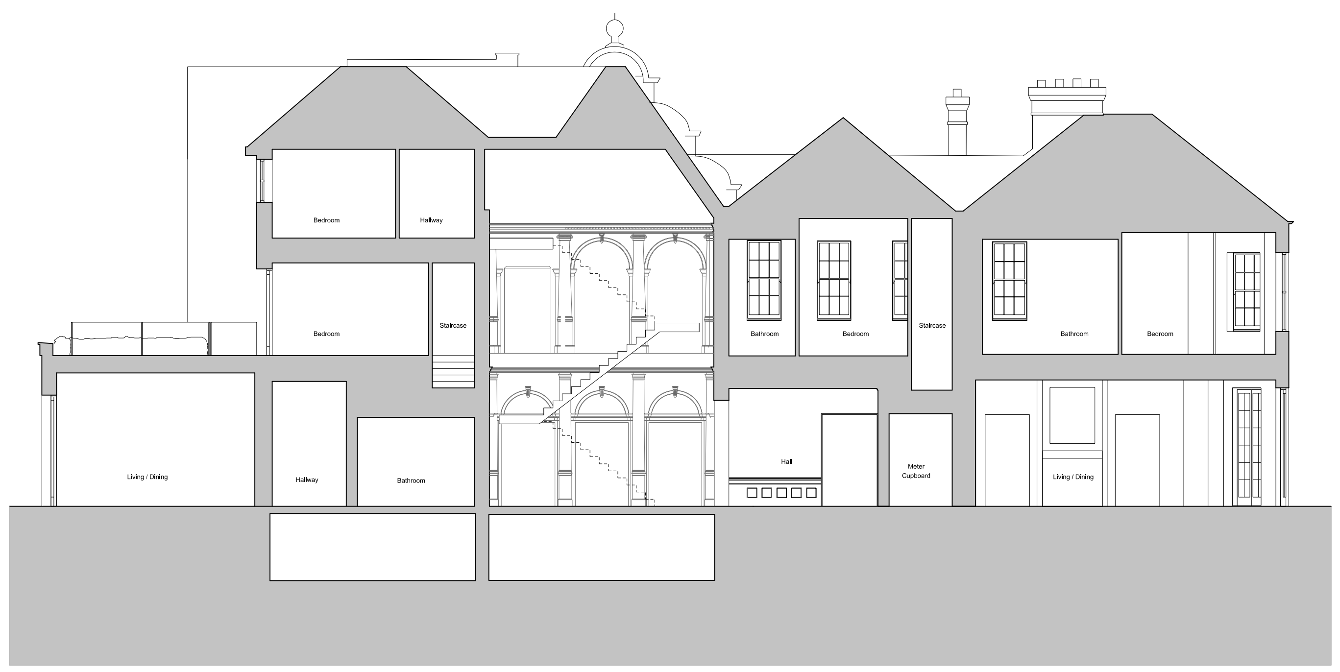
01 PROPOSED SECTION A