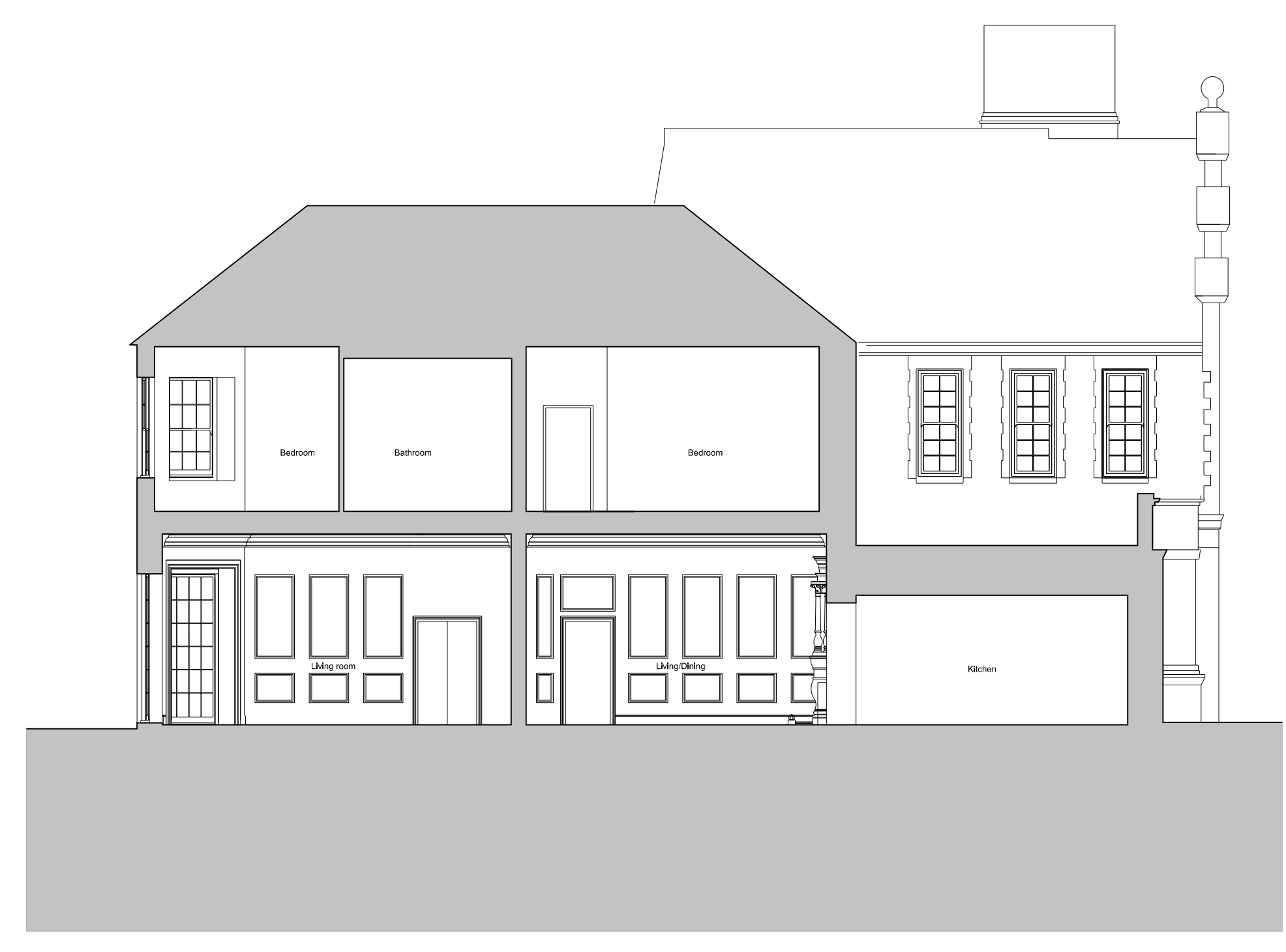
04 PROPOSED SECTION D