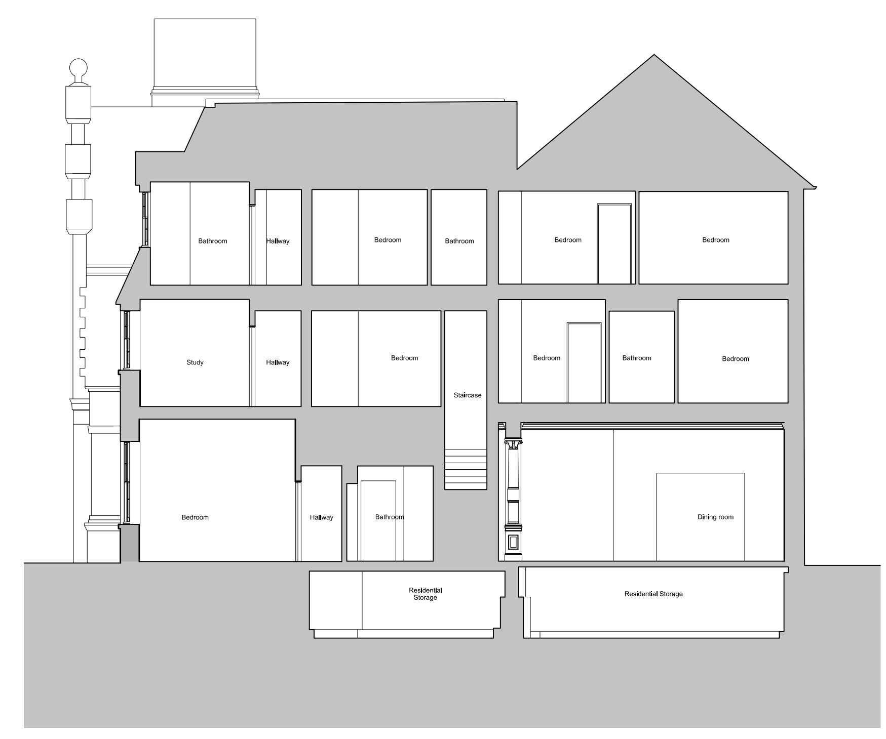
02 PROPOSED SECTION B