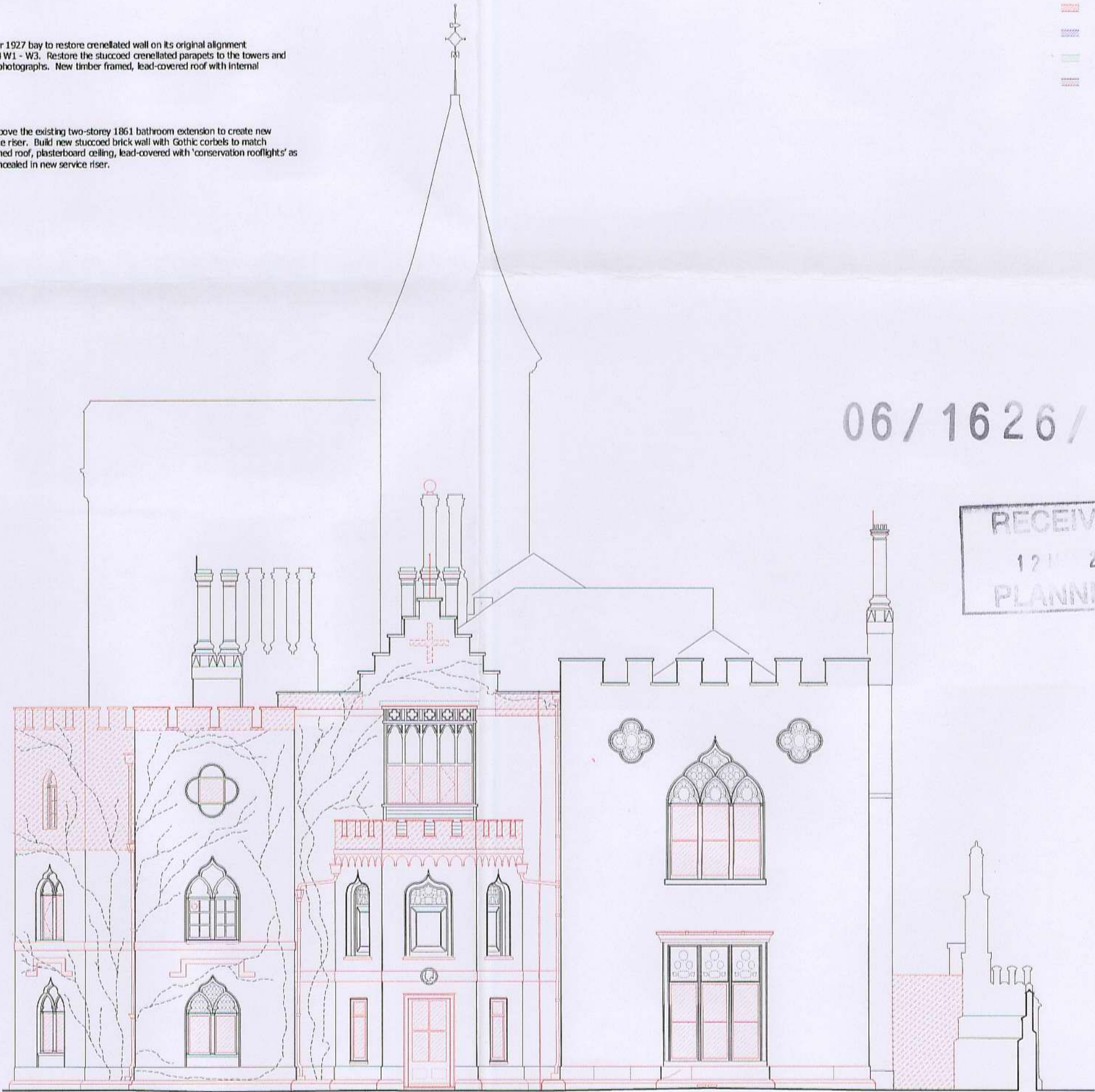
EAST ELEVATION OF WALPOLE'S VILLA