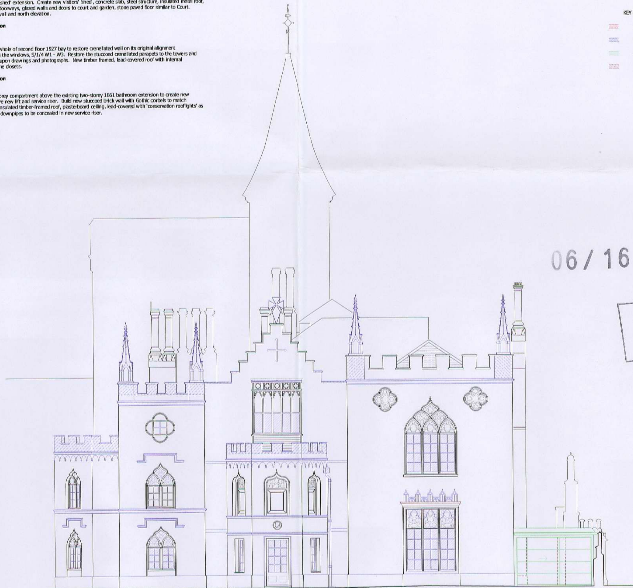
PROPOSED EAST ELEVATION OF WALPOLE'S VILLA