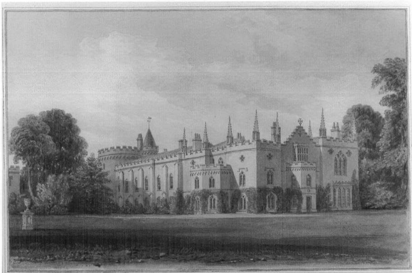
South East View of Strawberry Hill.