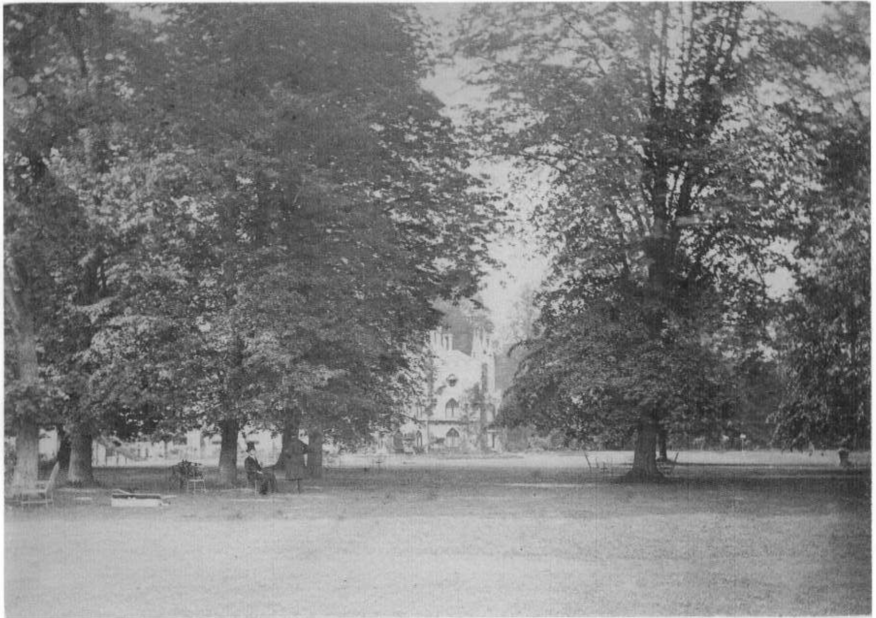
The South elevation about 1856, shortly after the first restoration of the house. Walpole's planting of the grove matured.