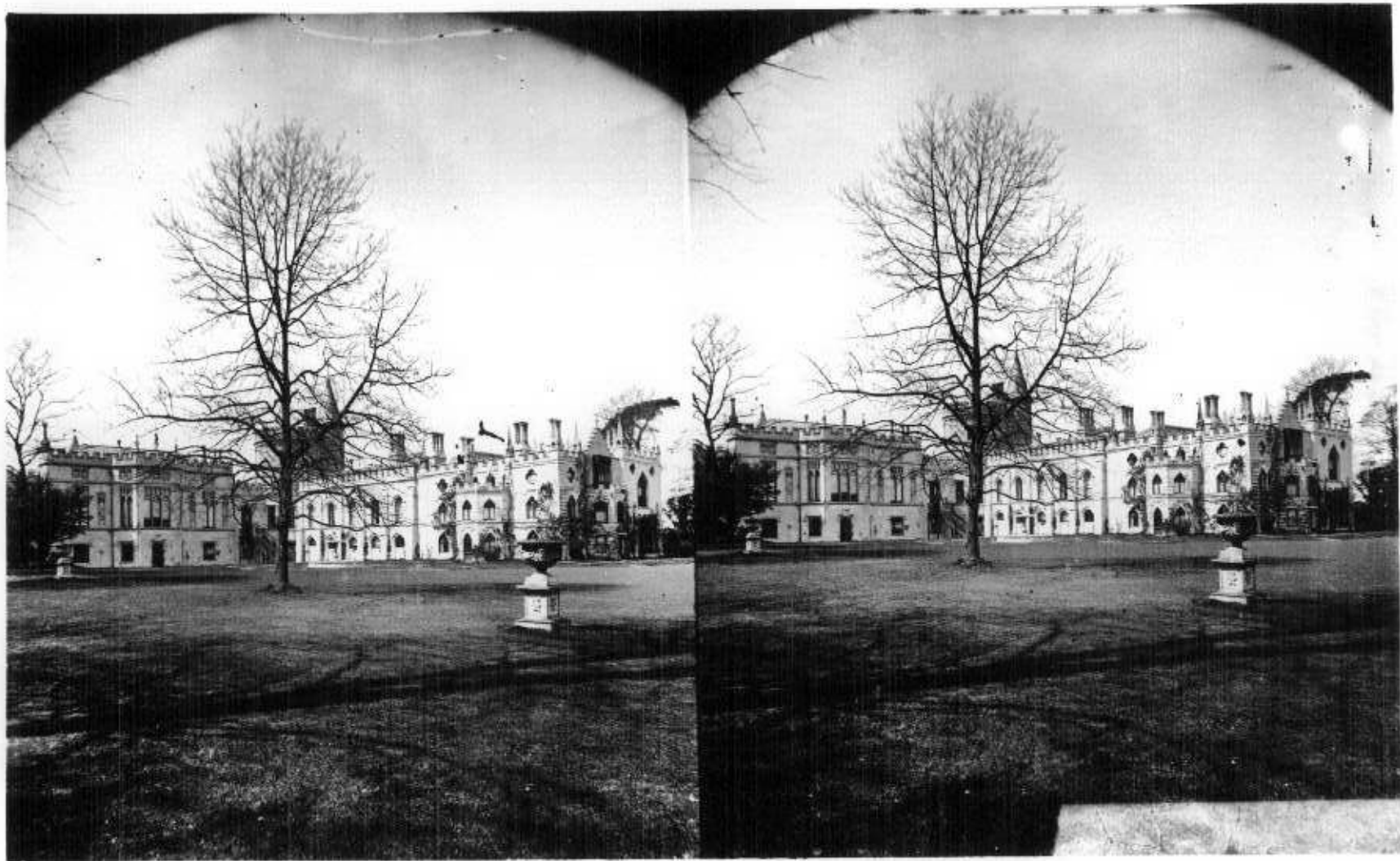
South-East Anon. 1865