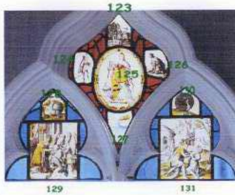
Blue Bedchamber Window 3, after Howson