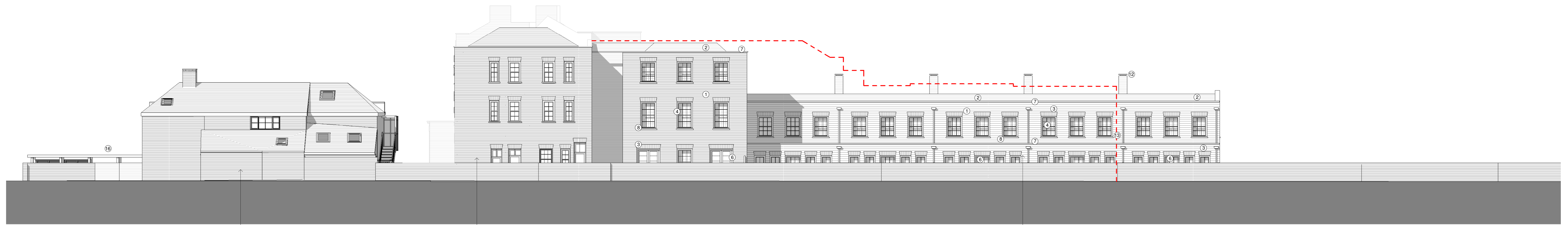
Proposed East Elevation 1:100