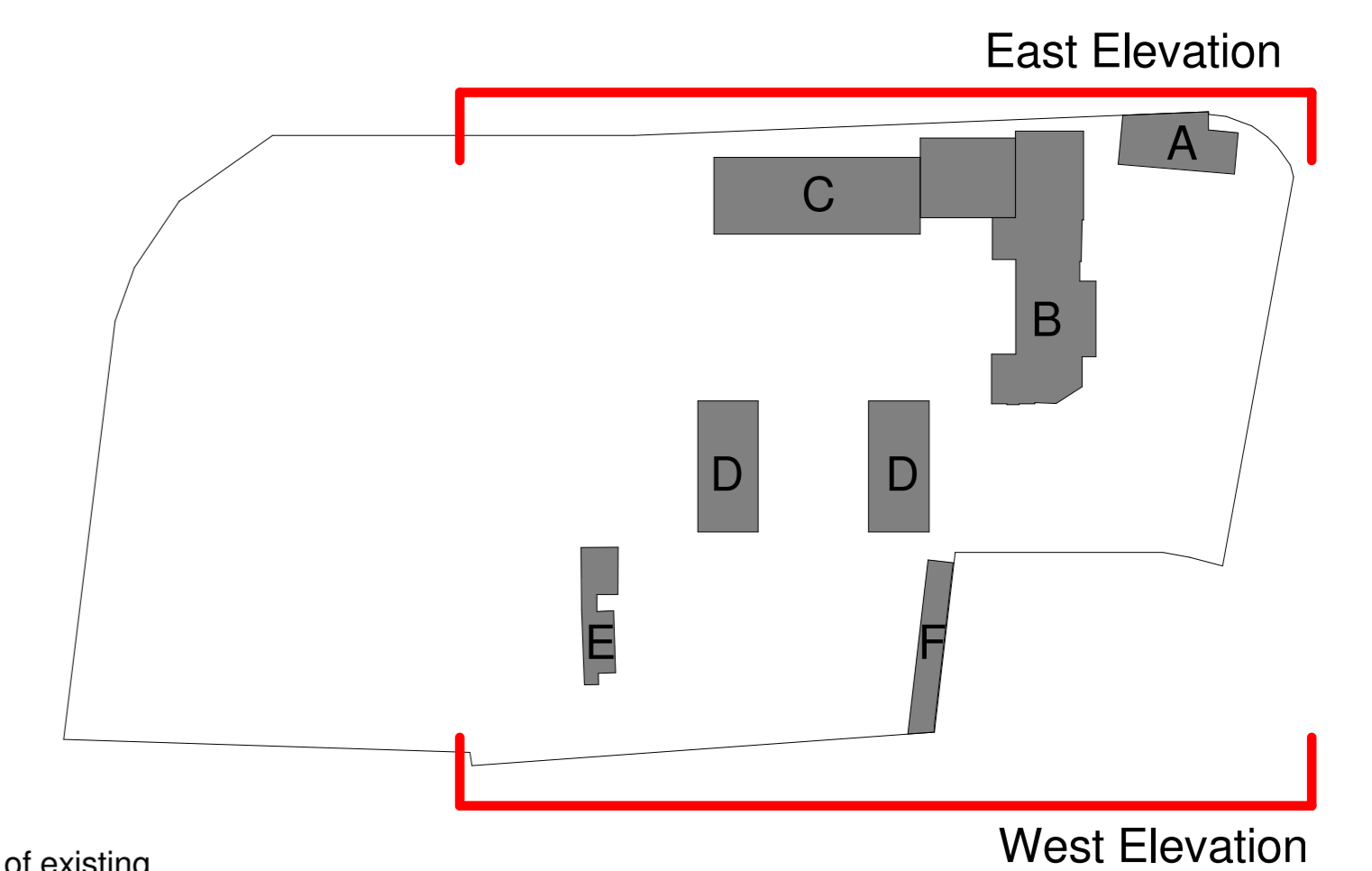
Key Plan (NTS)

Note: RWP's have not been shown on the existing building. RWP strategy and locations of downpipes to be agreed with LPA Boiler flues not shown, positions to be agreed.