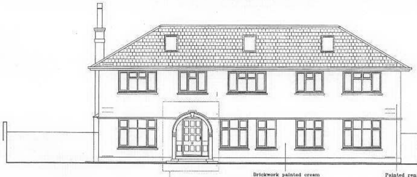
PROPOSED FRONT ELEVATION 5 - 5