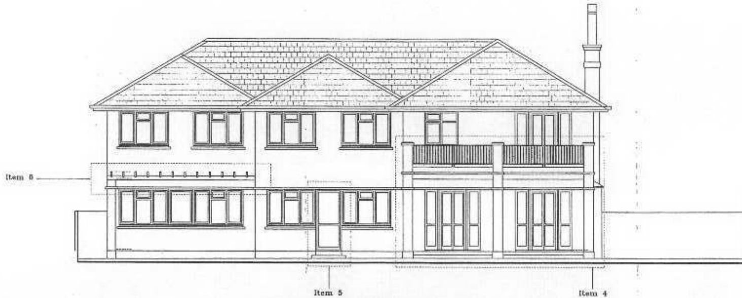
PROPOSED REAR ELEVATION 6 - 6