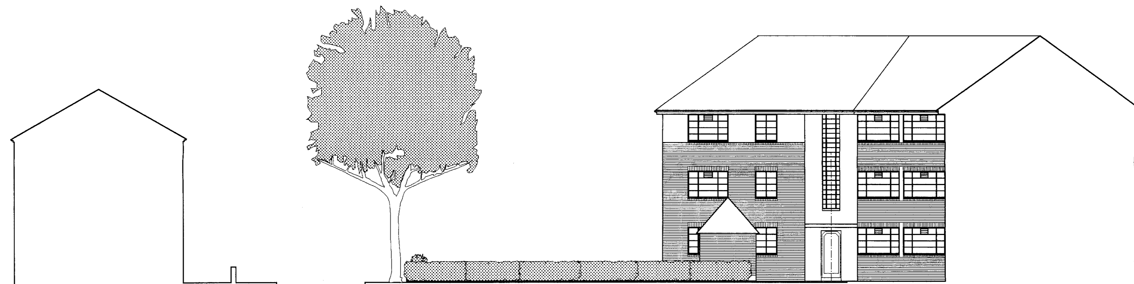
ELEVATION LOOKING SOUTH.