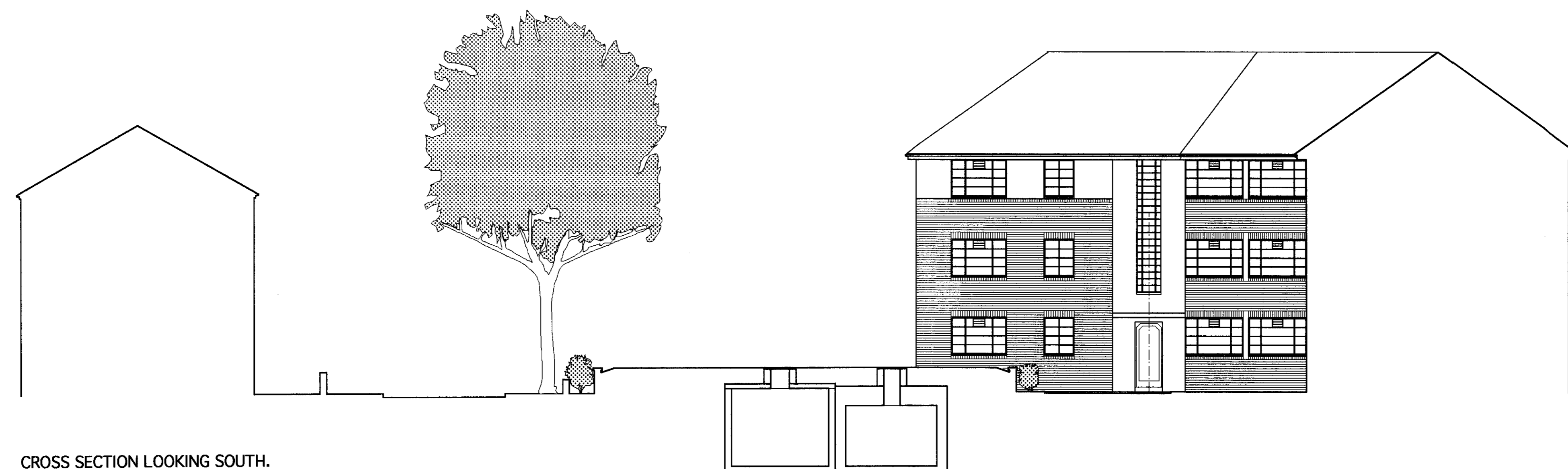
CROSS SECTION LOOKING SOUTH.