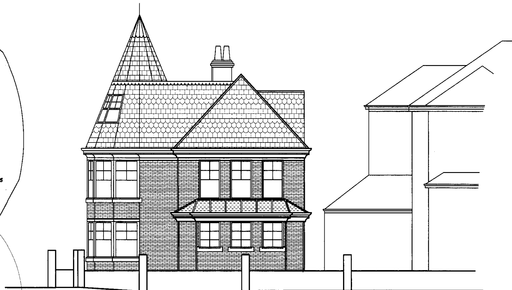
PROPOSED ELEVATION TO SANDYCOMBE ROAD