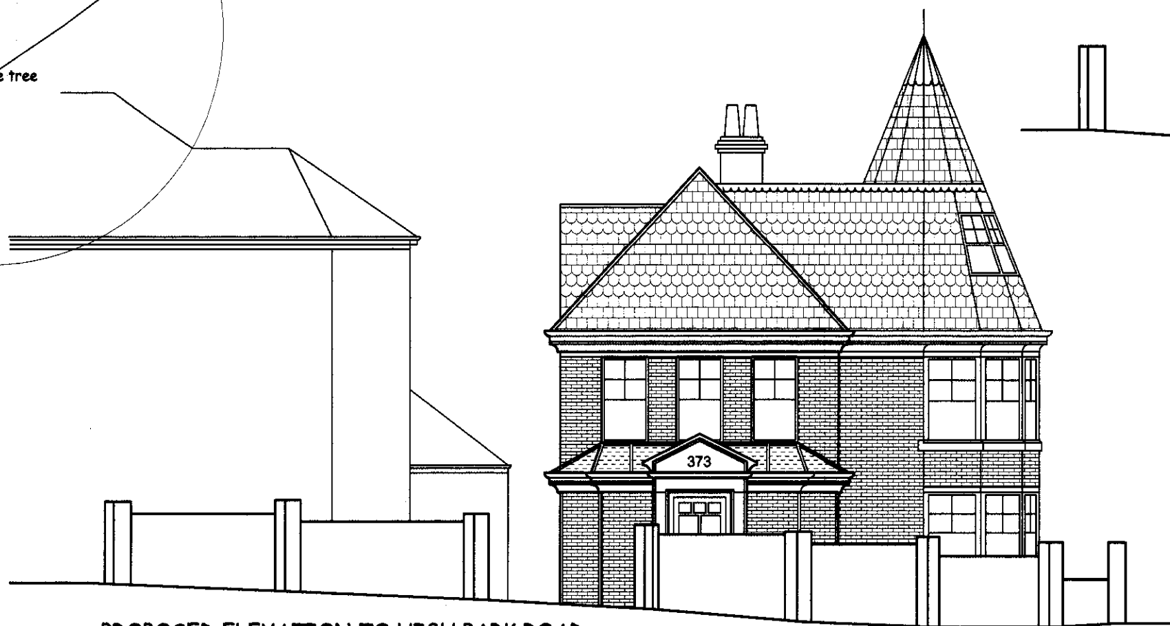
PROPOSED ELEVATION TO HIGH PARK ROAD