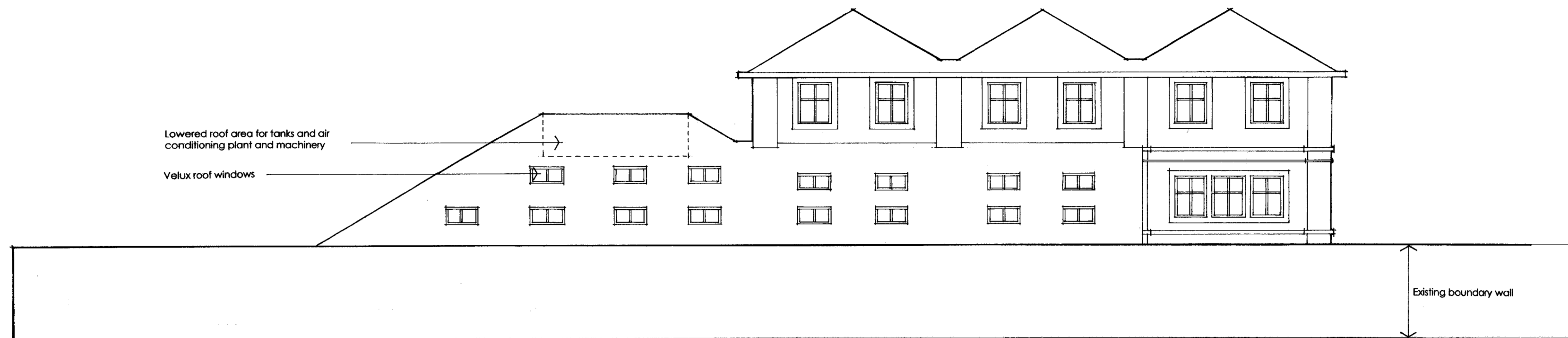
North Elevation ( to 50 Waldegrave Road - garage )