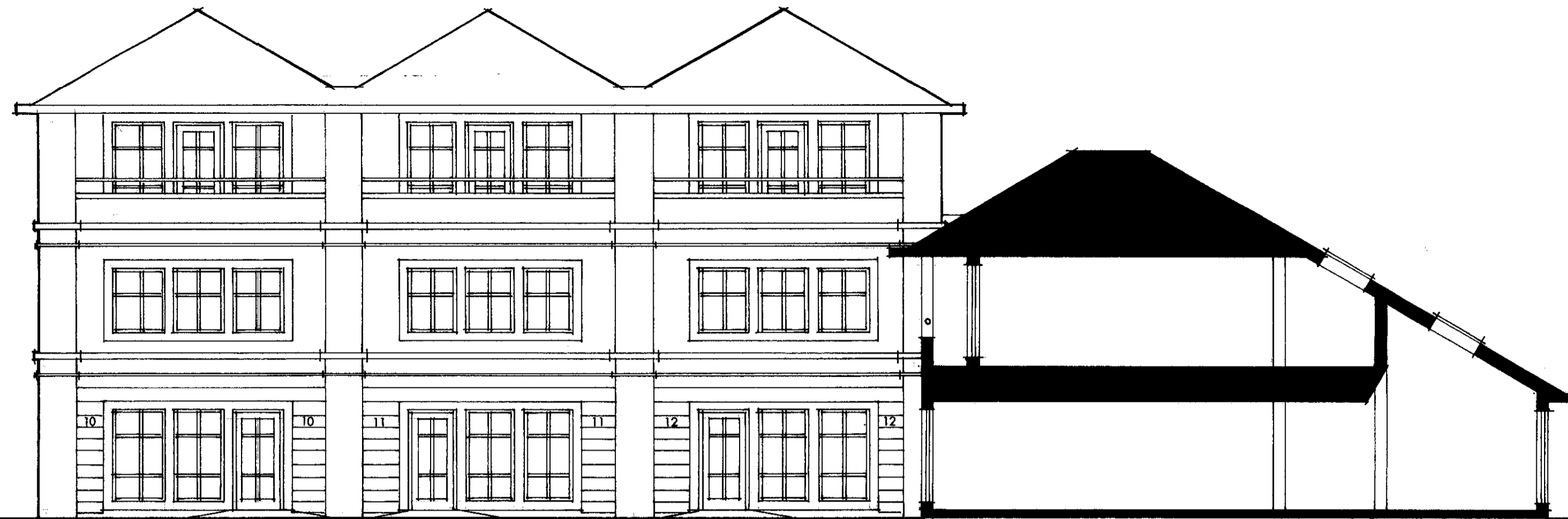
Section B - B (see drawing numbers 7 & 8)