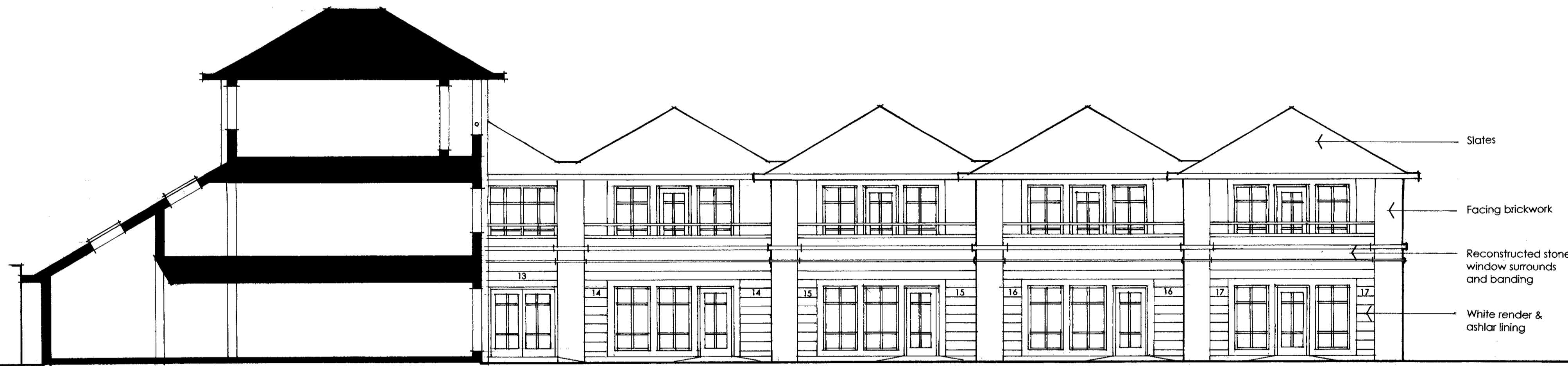
Section C - C (see drawing numbers 7 & 8)