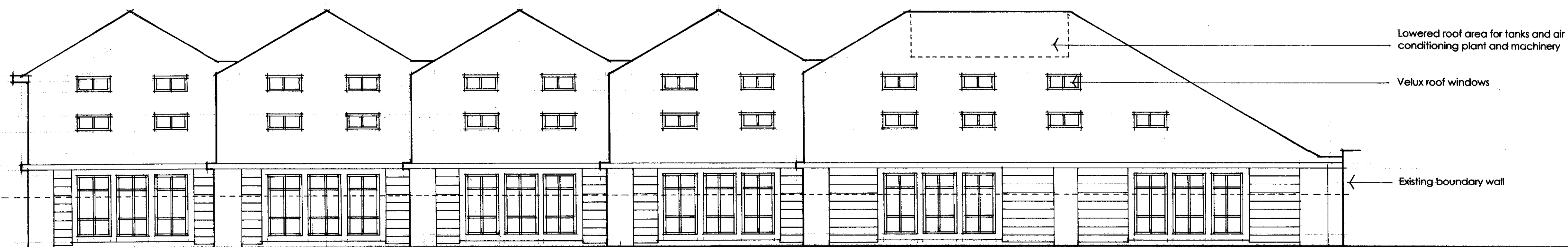
East Elevation ( to Elmfield Avenue )