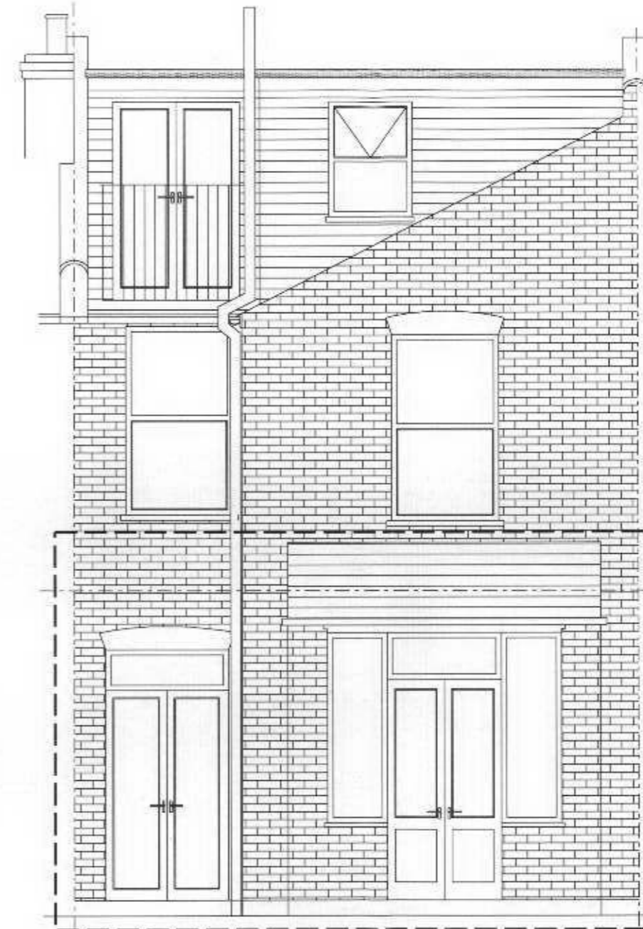
Existing Flank Elevation

Dotted line showing area of proposed works