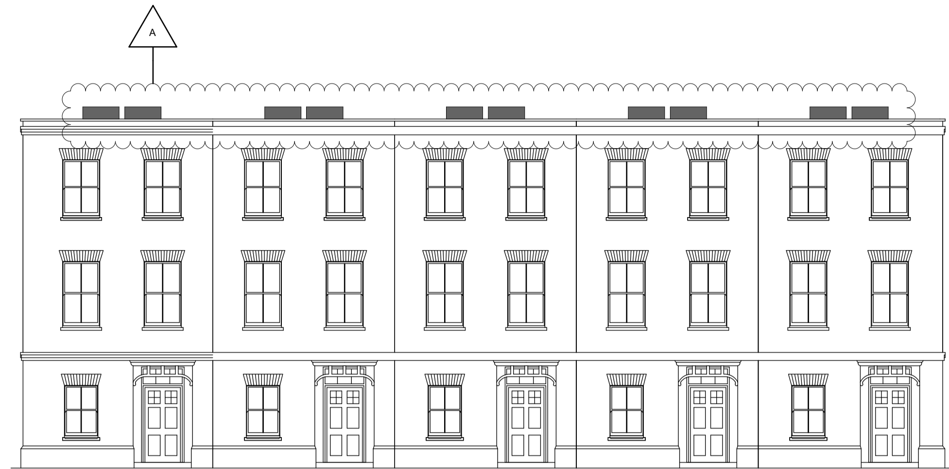
D1 - Southeast Elevation - Plots 19-23 & 26-30