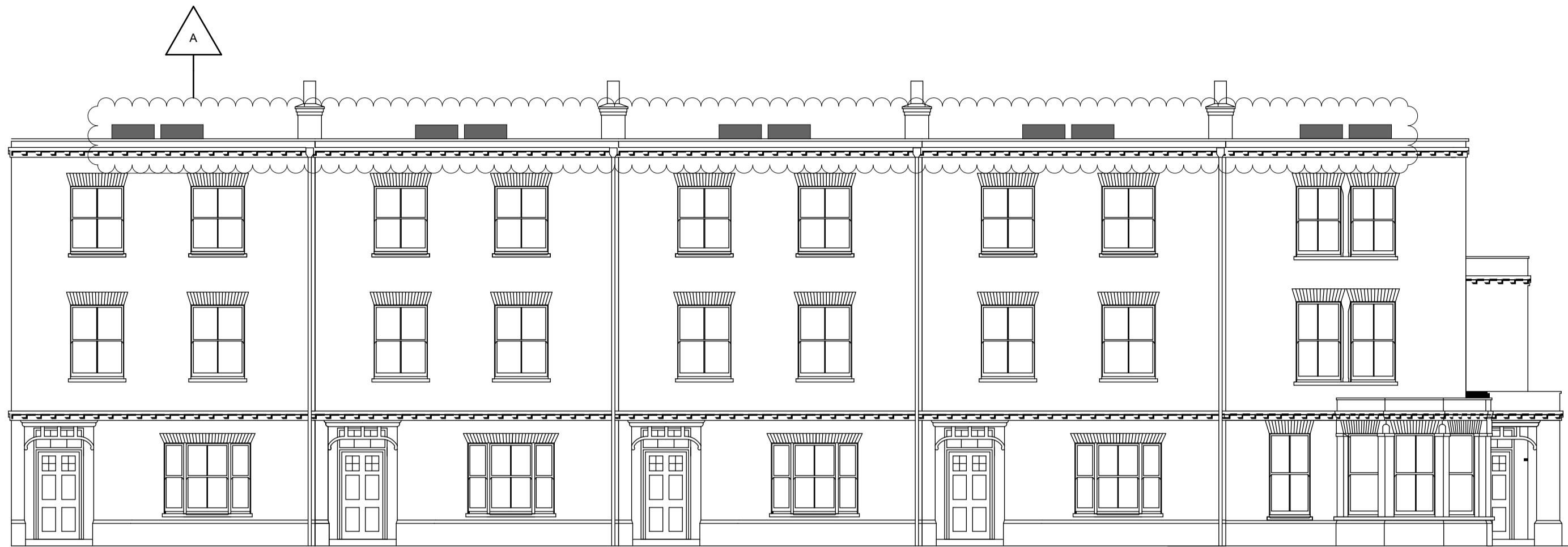
B4 + B3 - Southeast Elevation - Plots 14-18