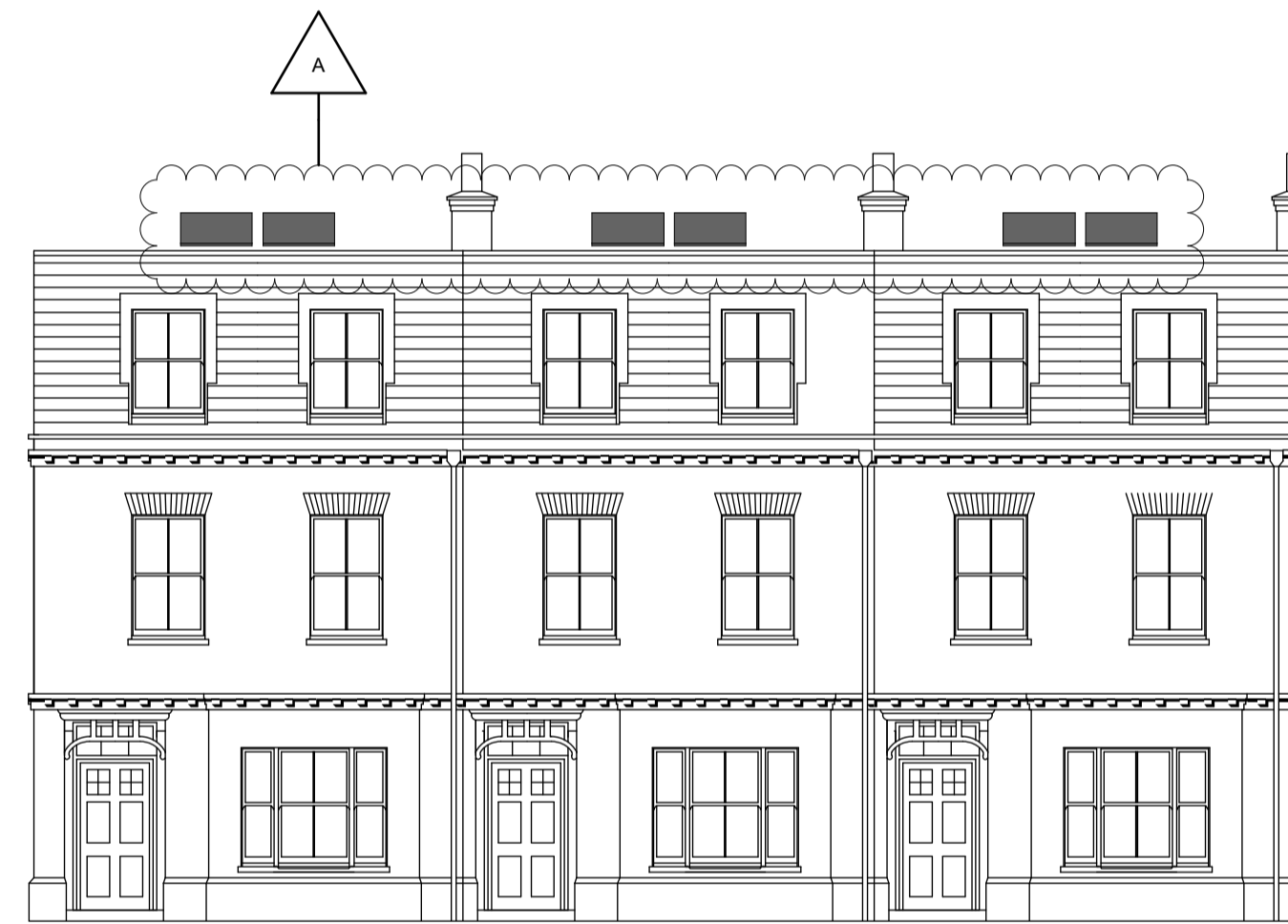
B1 - Southeast Elevation - Plots 31-33

GENERAL NOTES Drawing to be read in conjunction the latest revision of: Drawing - Site_Pre_01 and document - 10594 Latchmere House Surrey PV Proposal by South-Facing