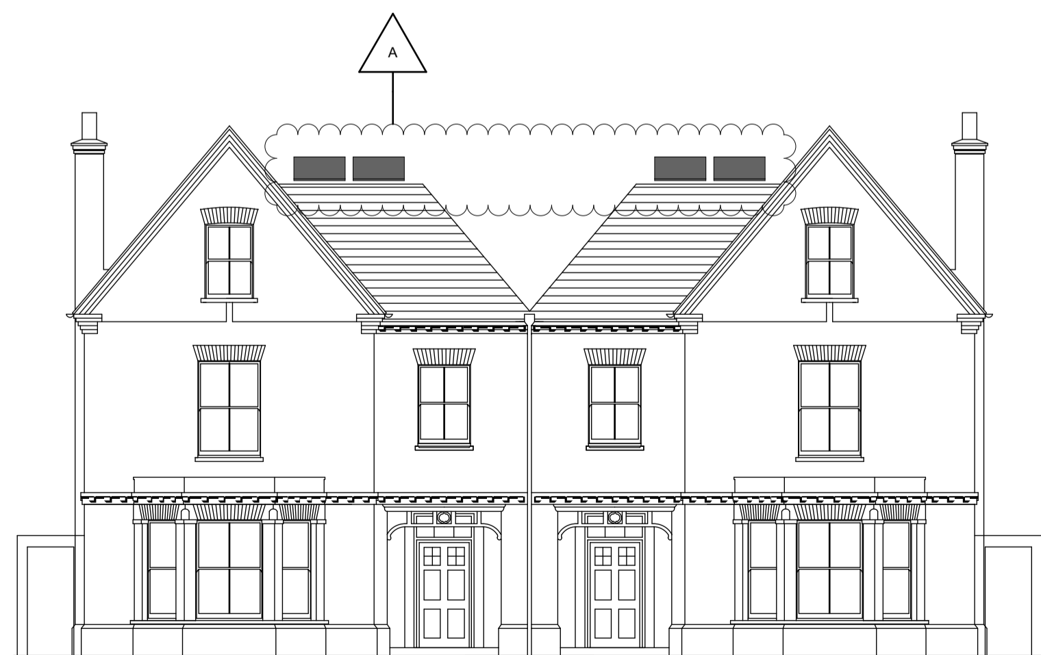
E3 - Southeast Elevation - Plots 24-25

Upstairs at The Grange, Bank Lane, London SW15 5JT T 020 8487 1223 F 020 8876 4172 E info@brookesarchitects.co.uk www.brookesarchitects.co.uk