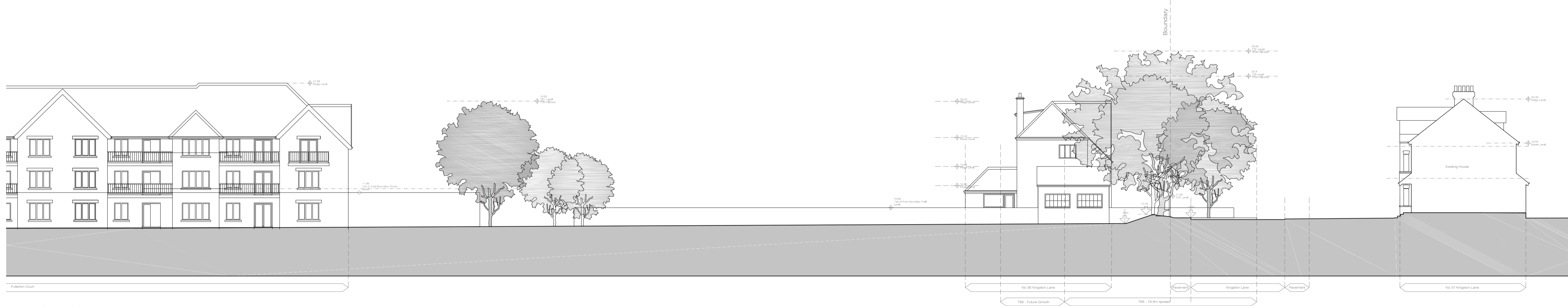
Exist Site Section B:B - (Part 2)