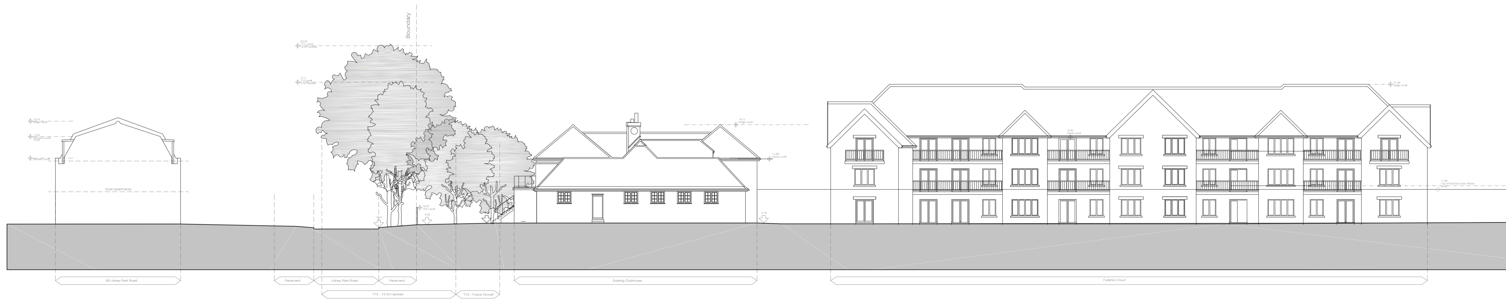
Existing Site Section B:B - (Part 1)