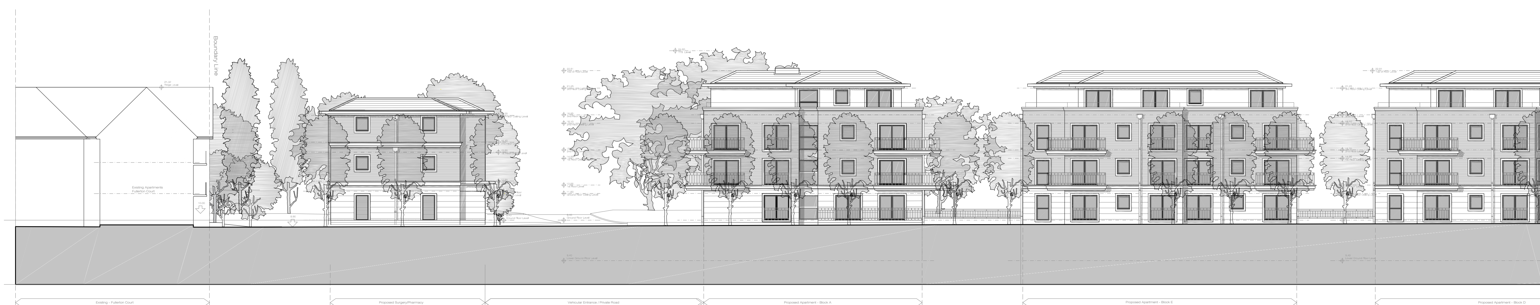
Proposed West Elevation A:A - (Part 1)