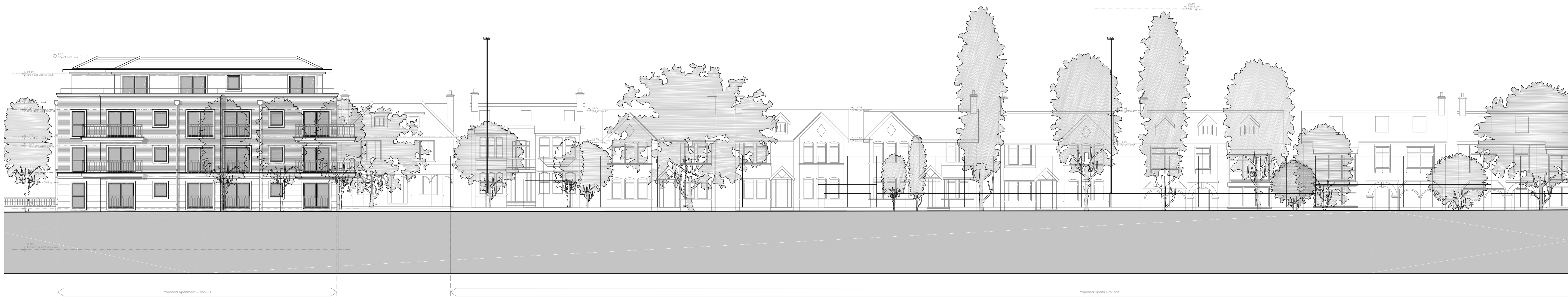
Proposed West Elevation A:A - (Part 2)