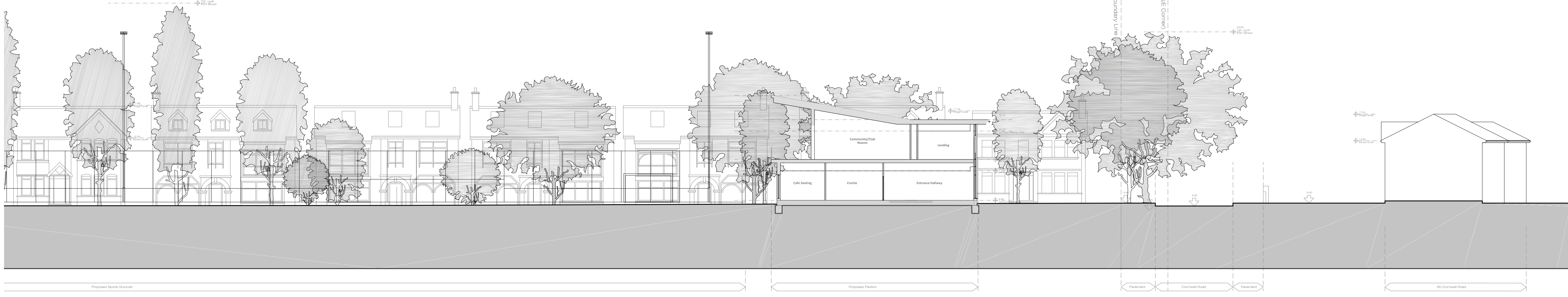
Proposed West Elevation A:A - (Part 3)