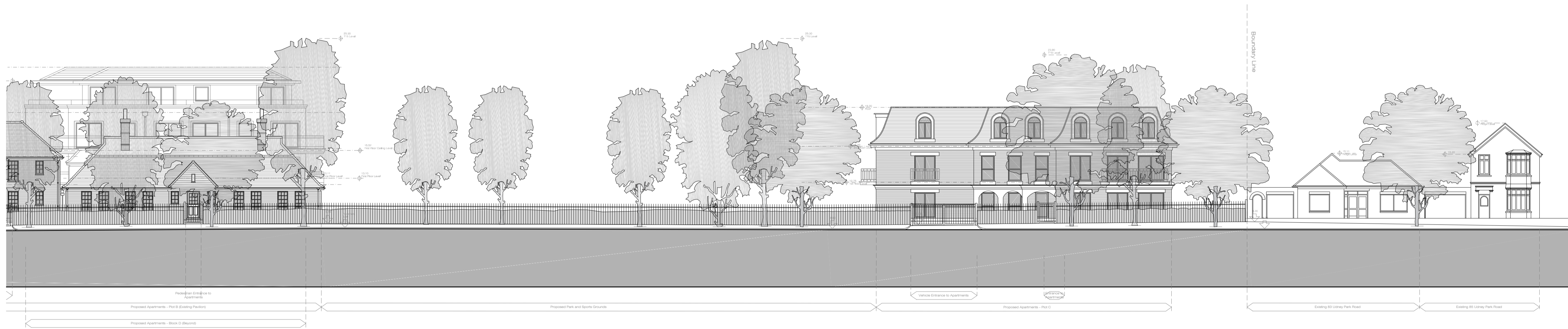
Street Scene - Udney Park Road - Part 2