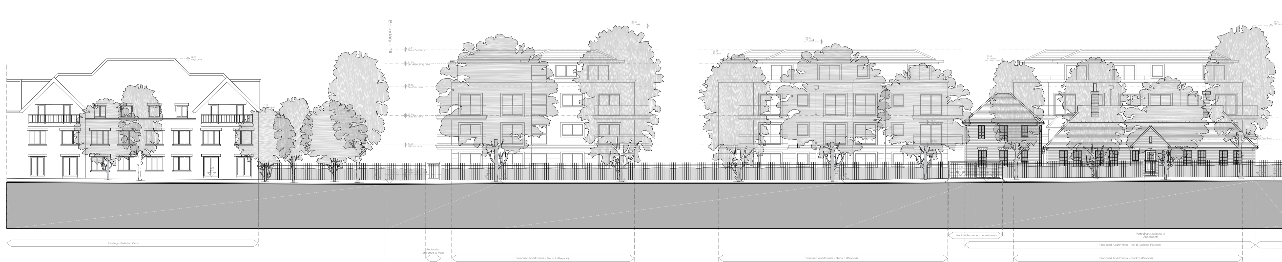
Street Scene - Udney Park Road - Part 1