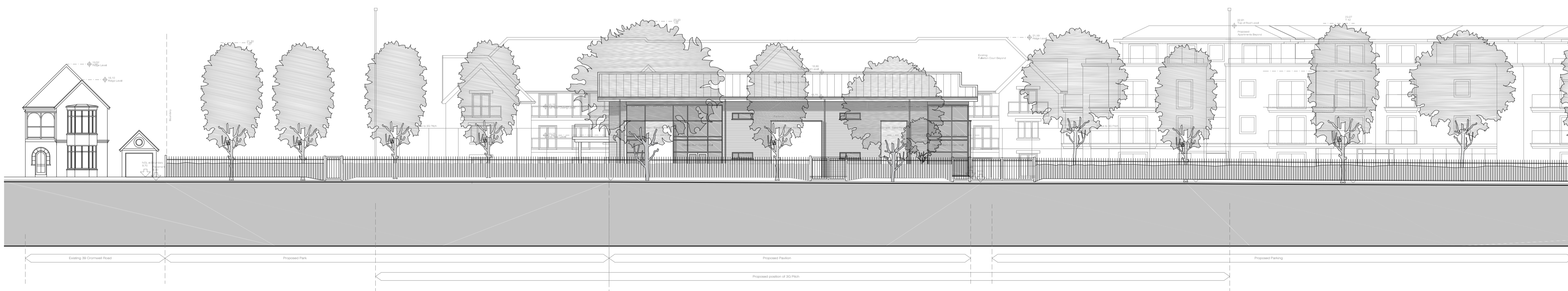
Street Scene - Cromwell Road - Part 1