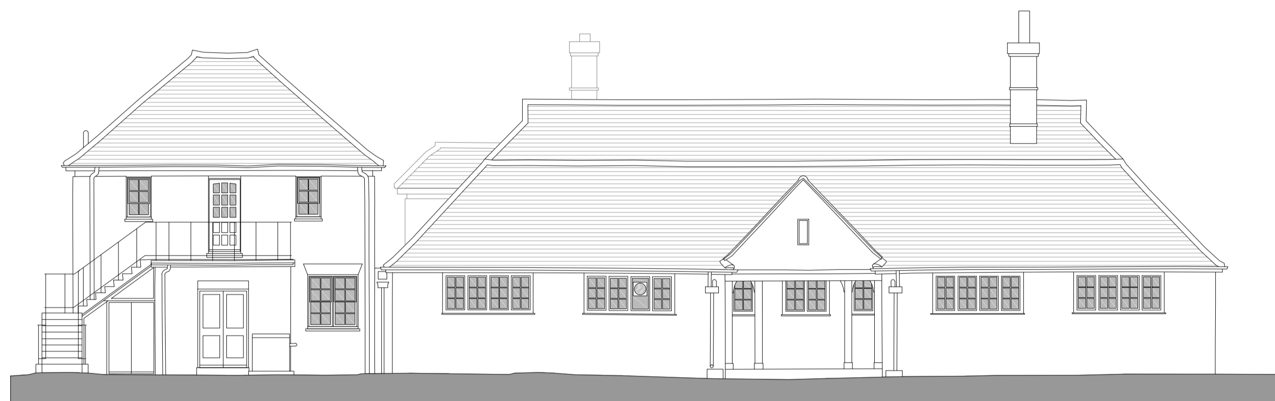
Existing West (Front) Elevation Scale 1:100