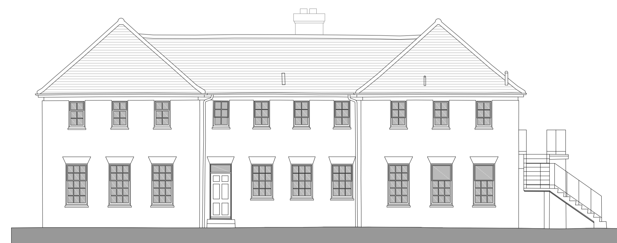
Existing North (Side) Elevation Scale 1:100