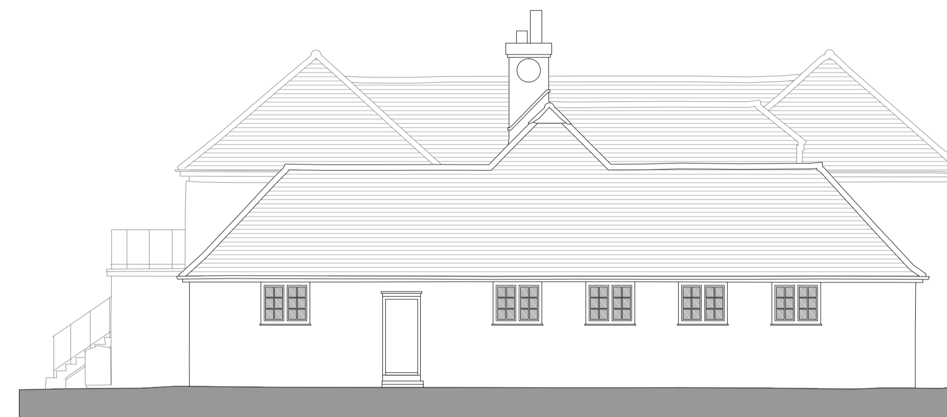
Existing South (Side) Elevation Scale 1:100