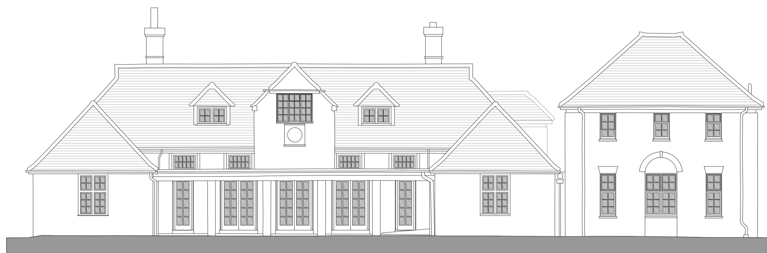
Existing East (Rear) Elevation Scale 1:100