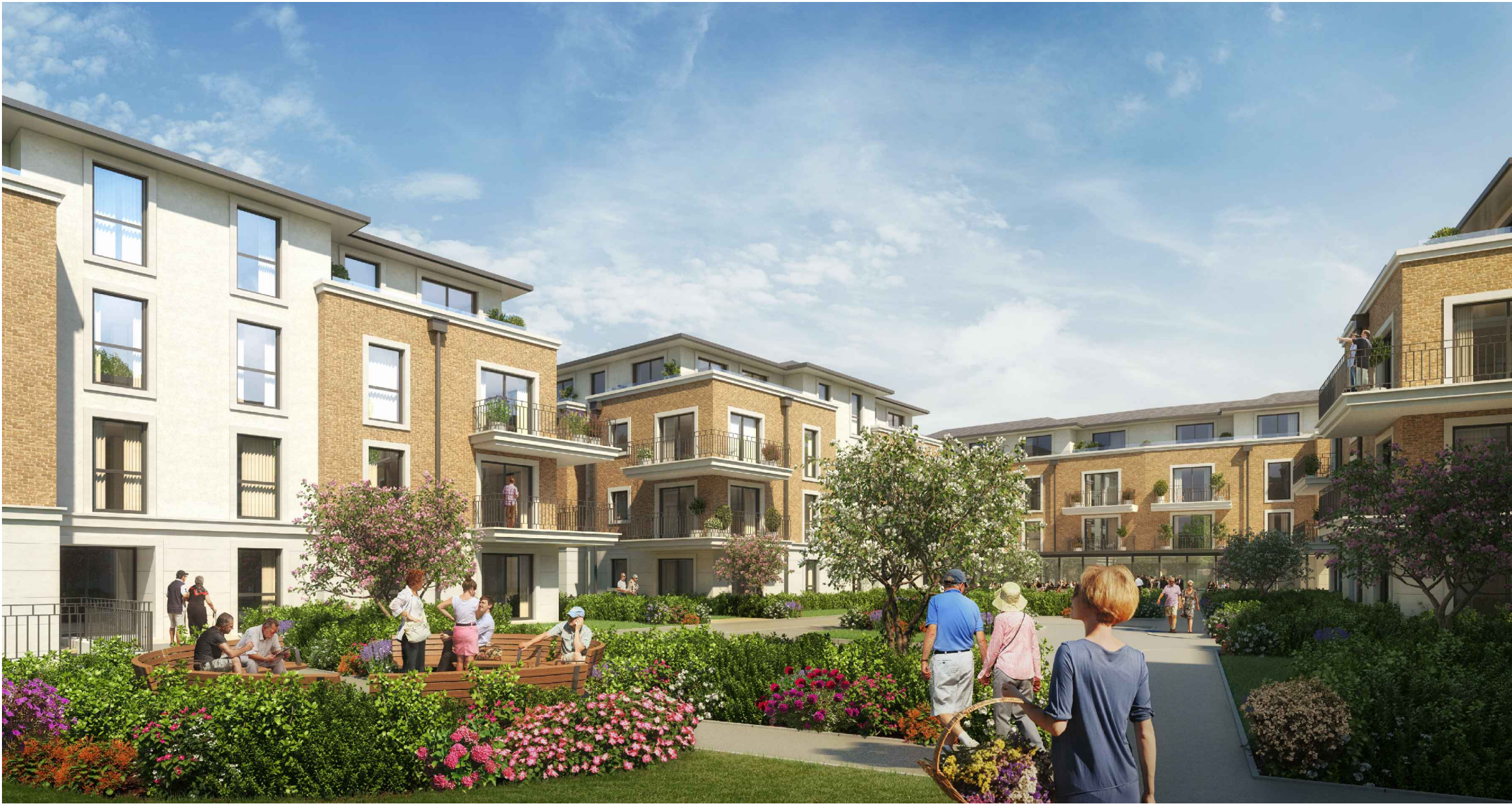
Extra Care courtyard garden