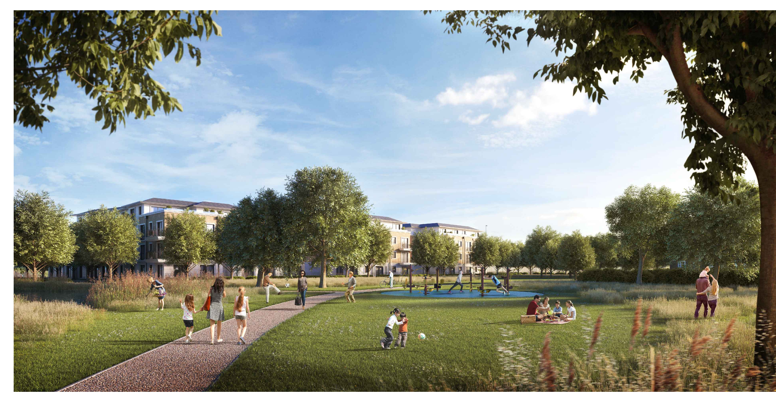
View from new pedestrian gate on Udney Park Road