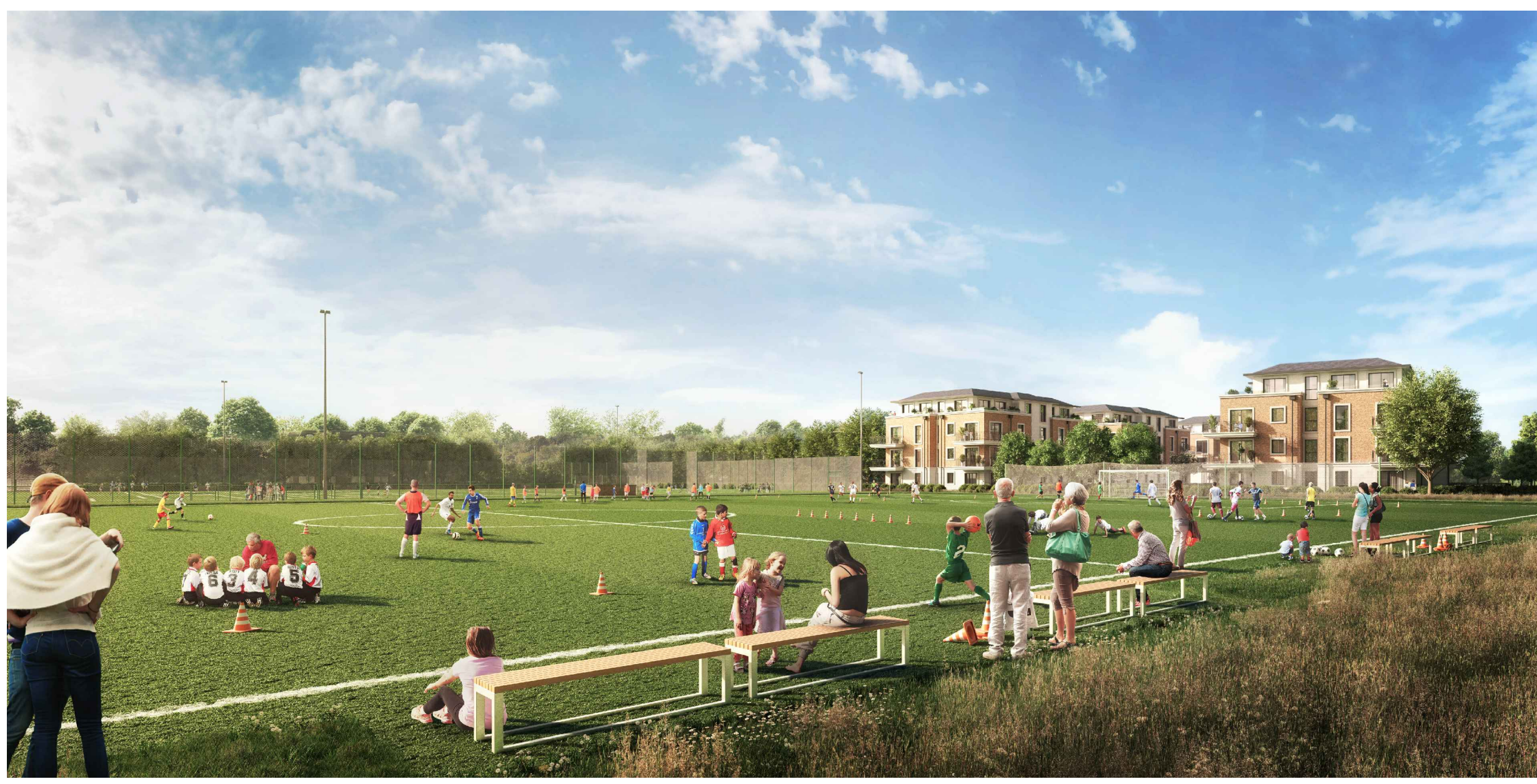
View across Teddington Community Sports Ground