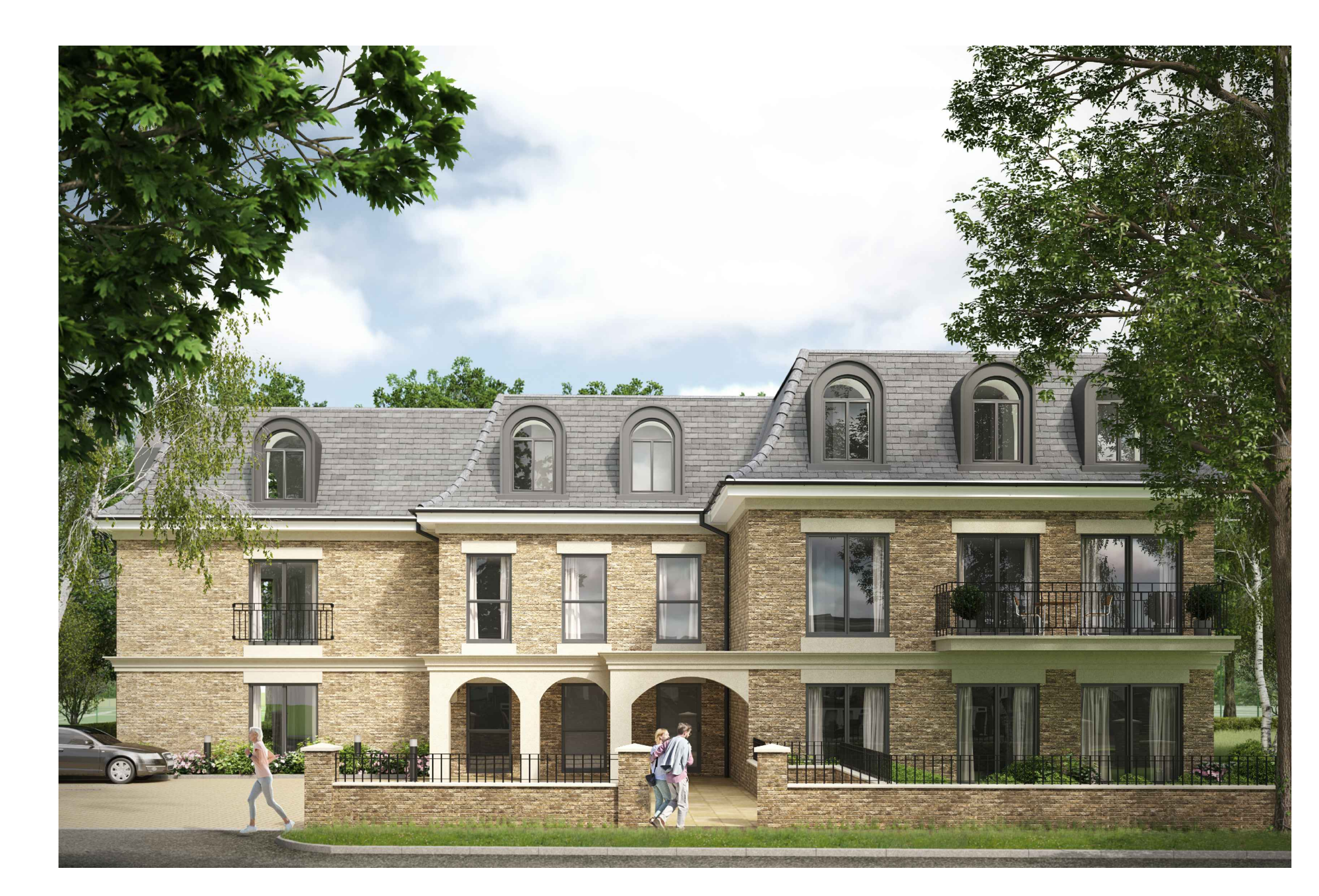
Plot C - Extra Care