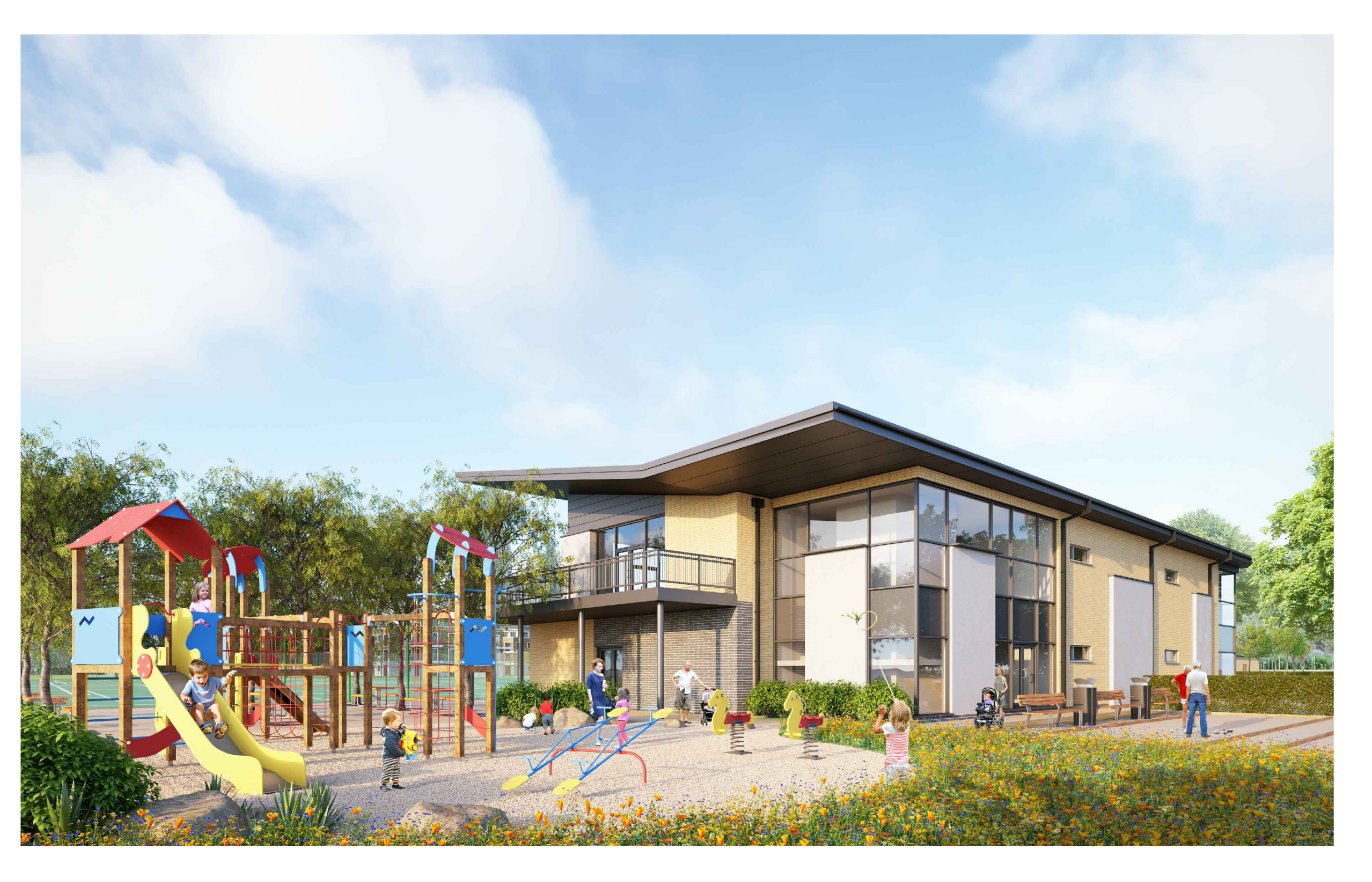
New Sports and Community Pavilion