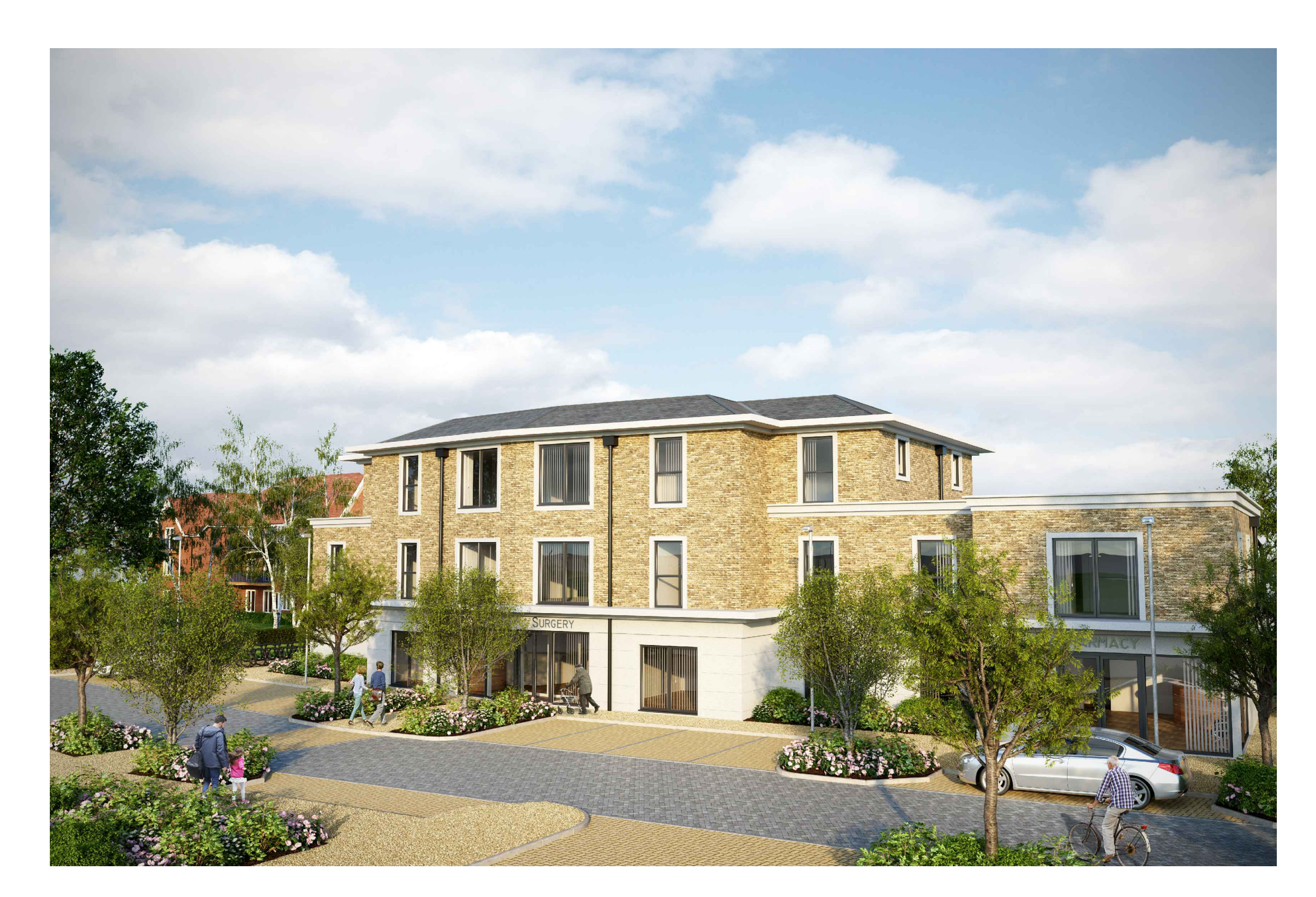
Plot A - New GP Surgery