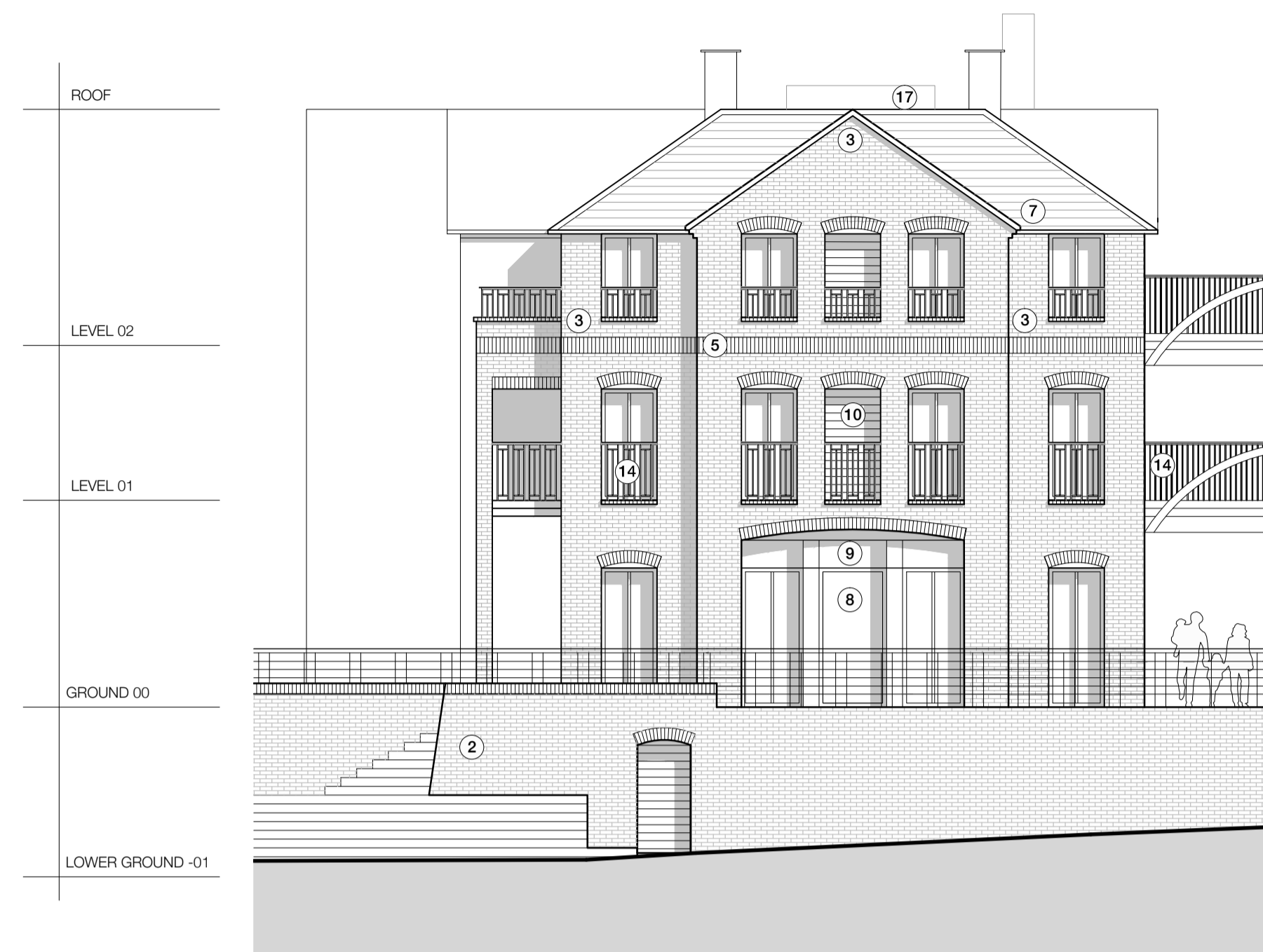
BUILDING B- PROPOSED ELEVATION C