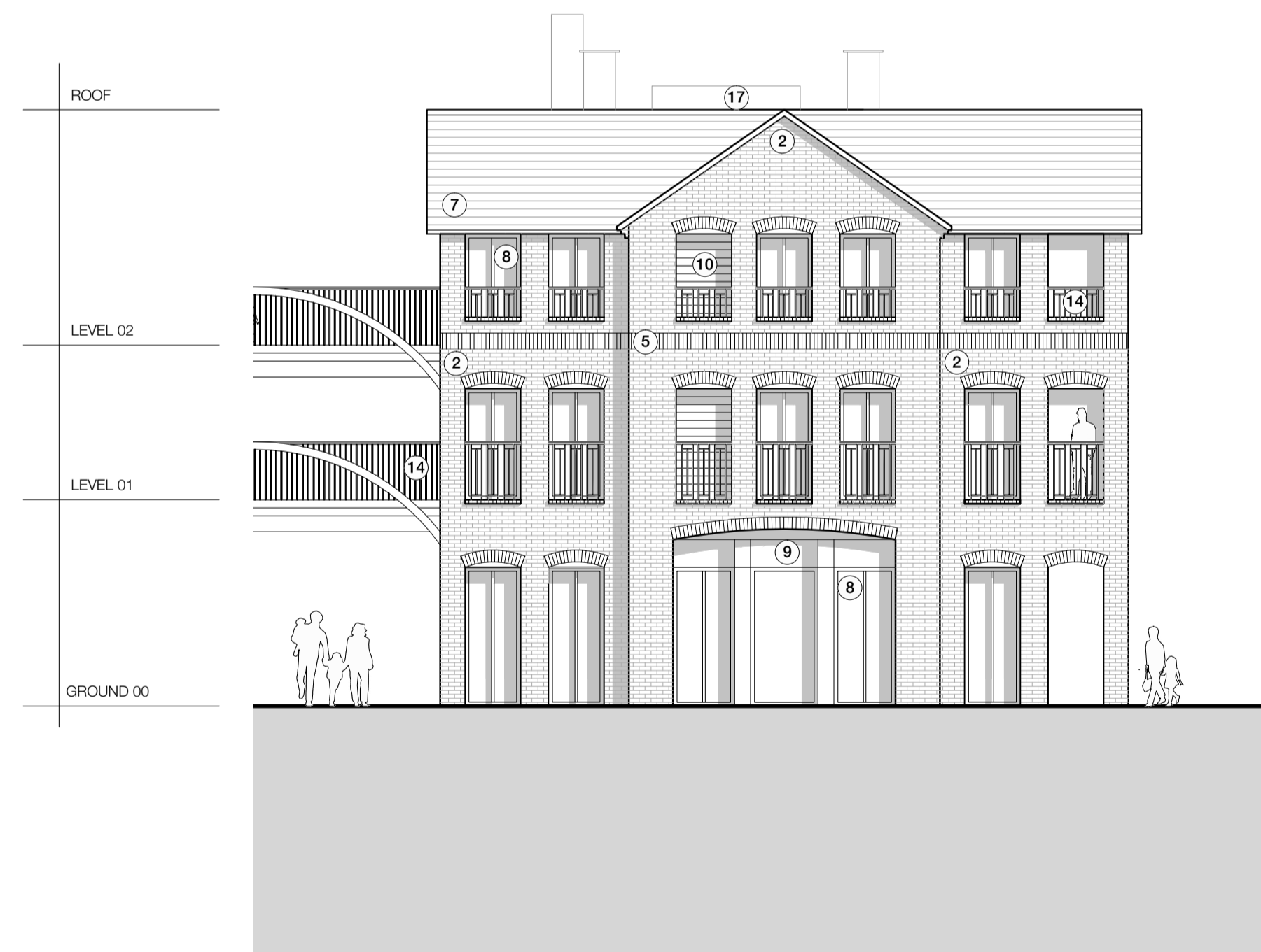
BUILDING B- PROPOSED ELEVATION D