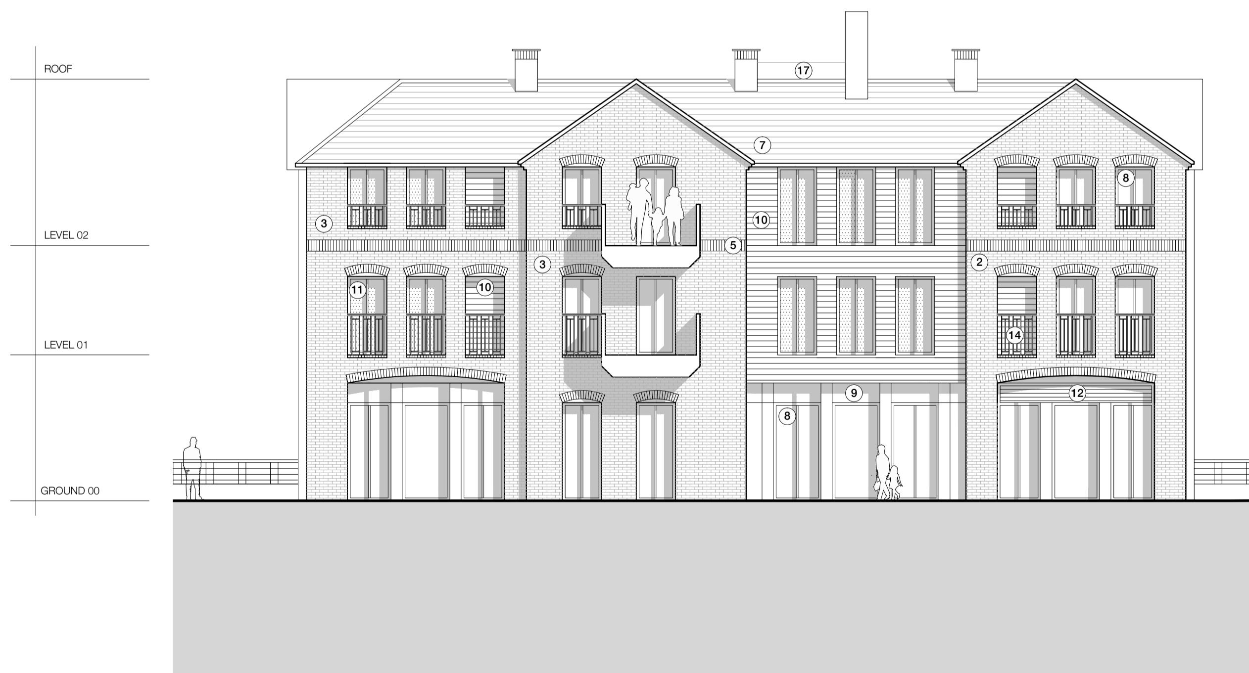
BUILDING B- PROPOSED ELEVATION B