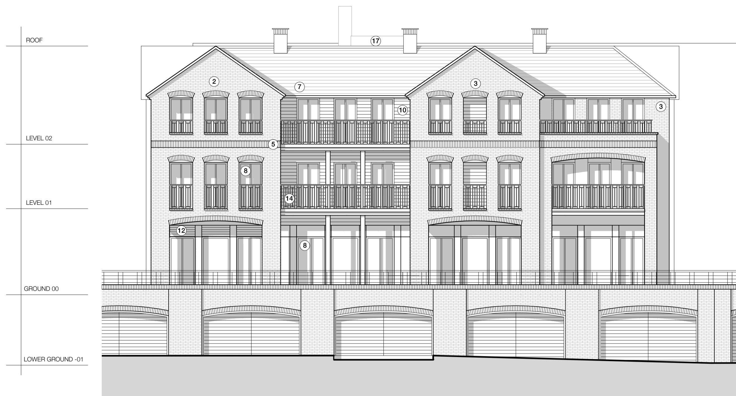
BUILDING B- PROPOSED ELEVATION A