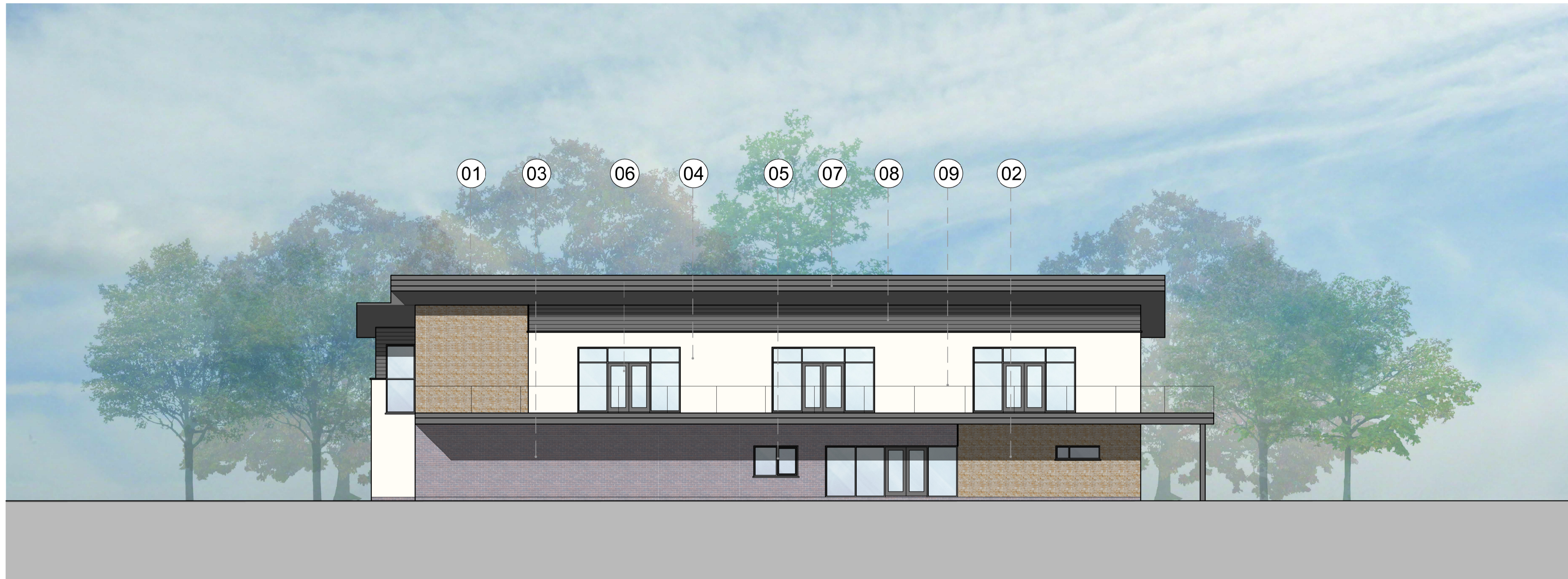
North Elevation 1:100@A1