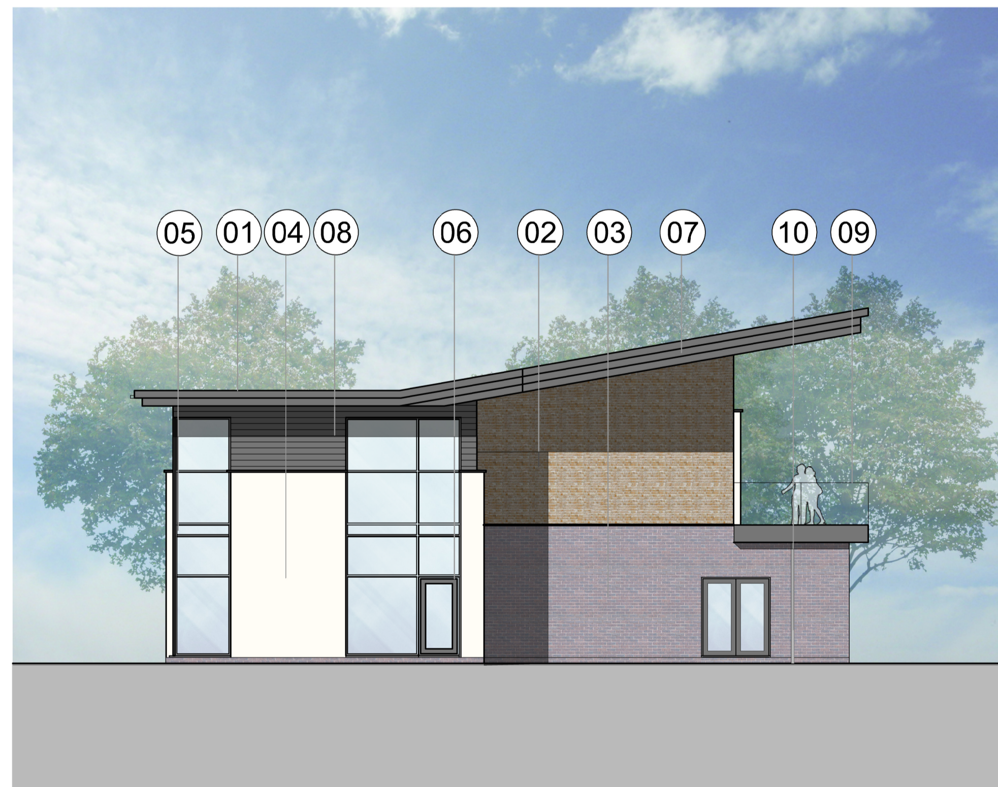
East Elevation 1:100@A1