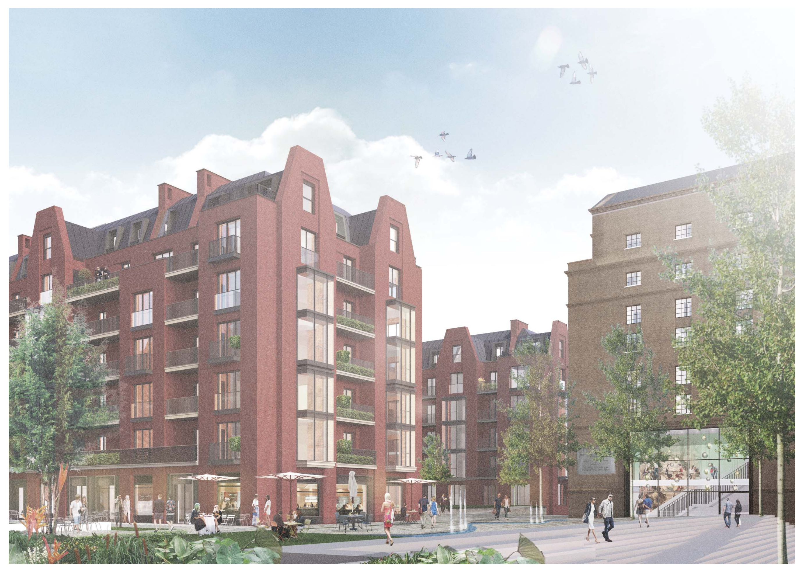
View of the riverside Maltings Square 74