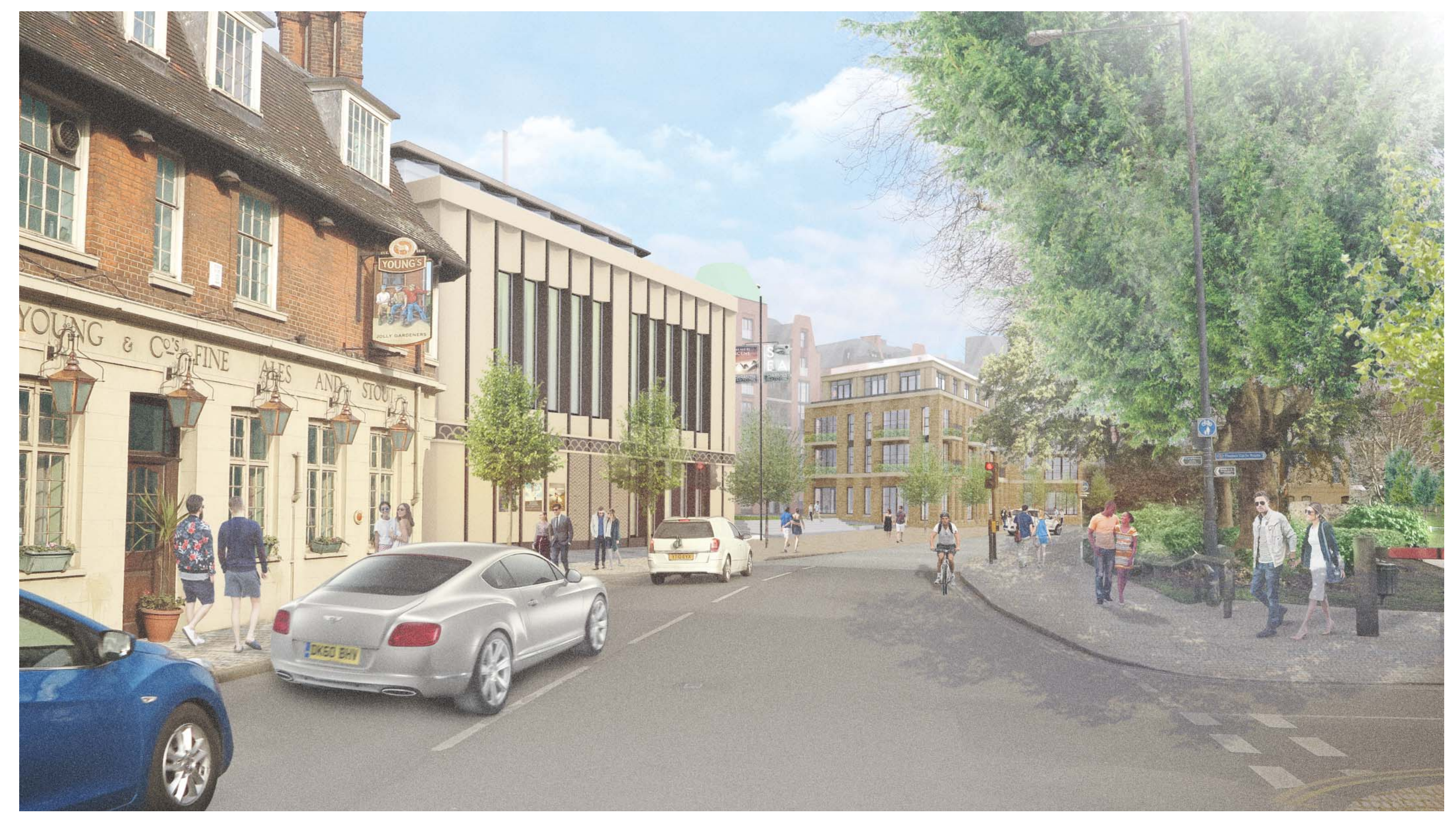
View looking east from Lower Richmond Road 82