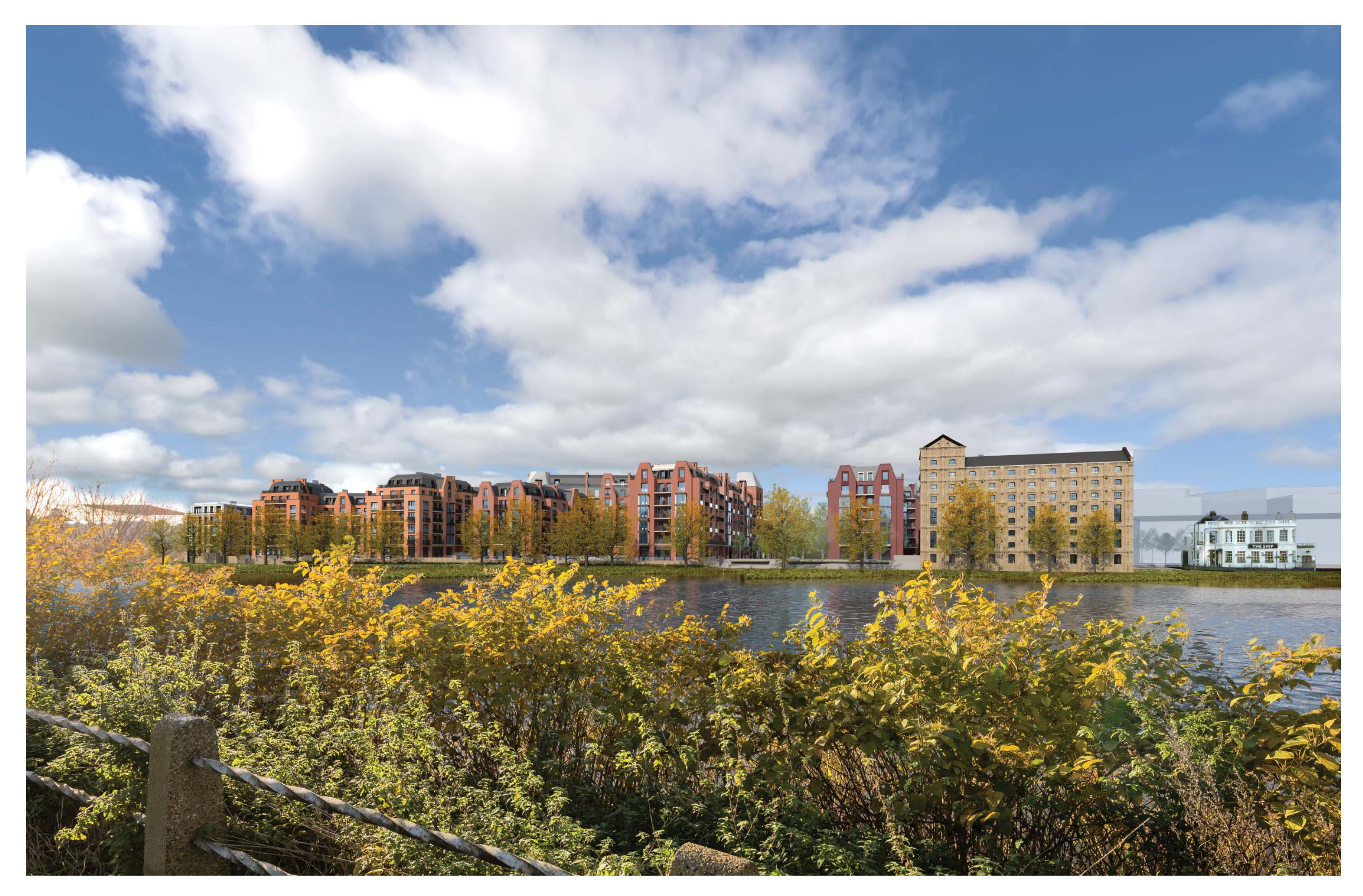
View from Dukes Meadow 86