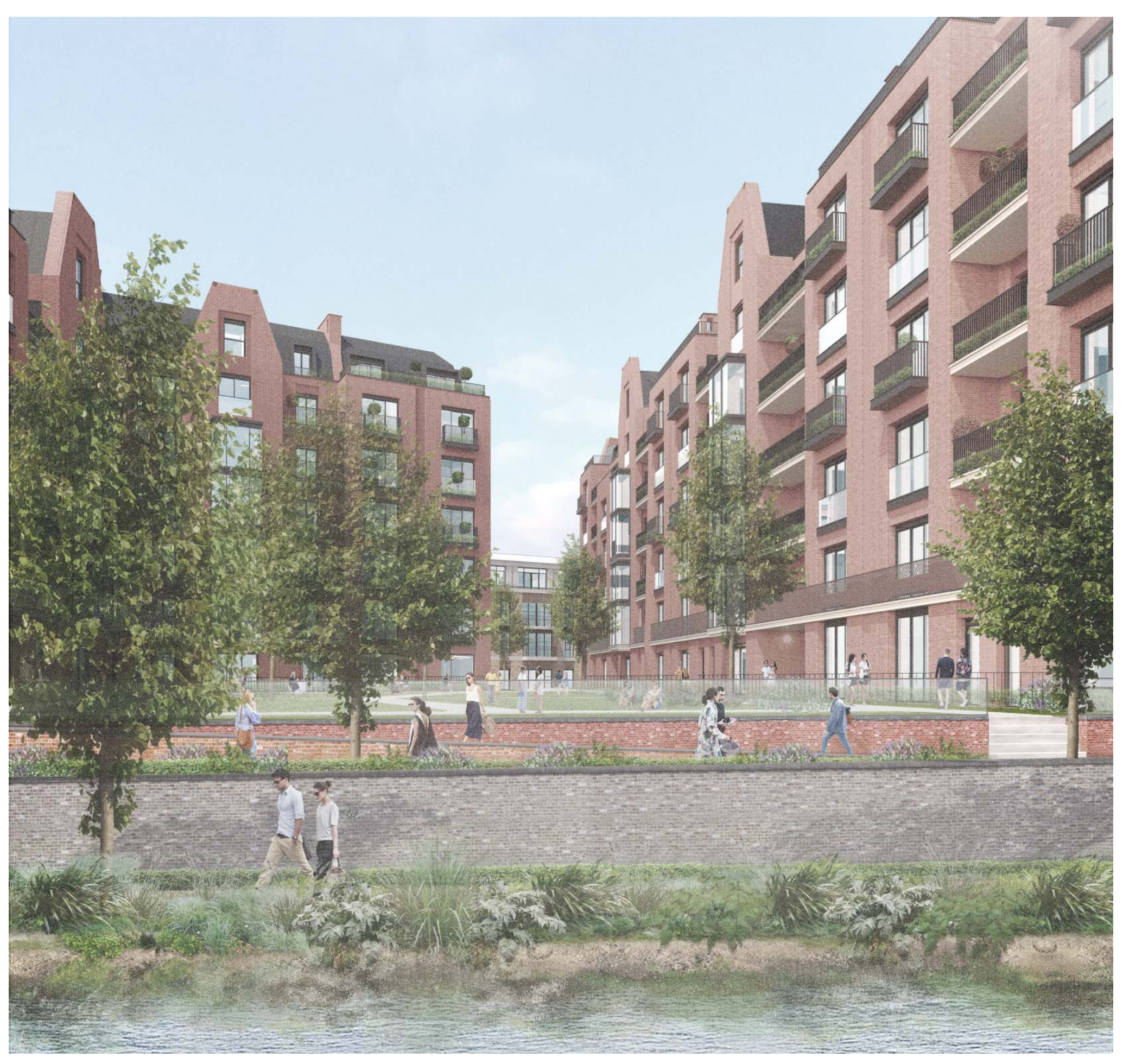
View of residential garden courtyard (Buildings 7 and 8)