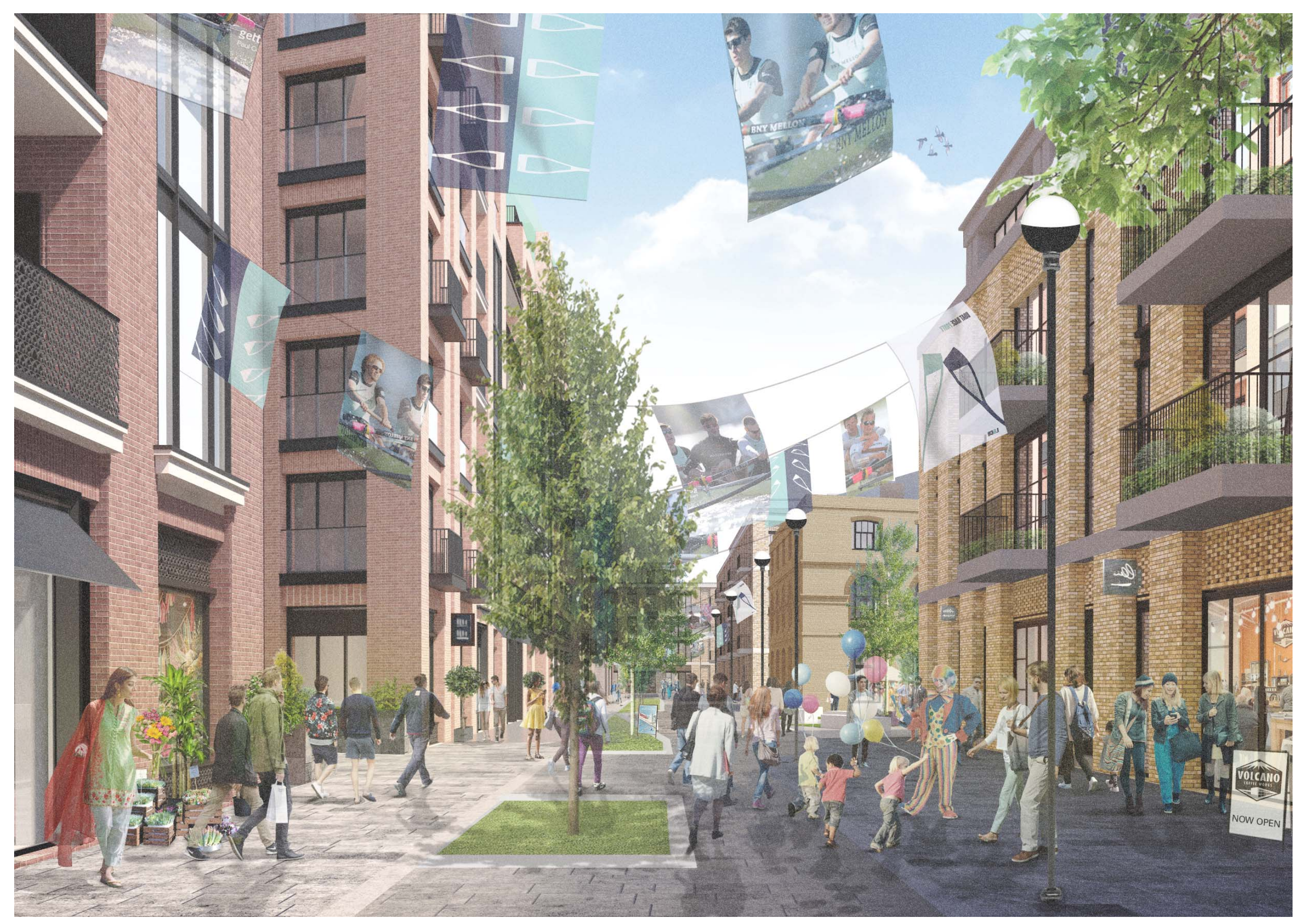
View of new high street (Thames Street) 76