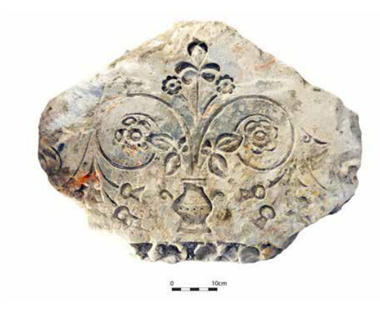
Photograph: Carved stone recovered from archaeological fieldwork undertaken at the Site.

There would be no likely effects on archaeological assets once the Development is complete and occupied.