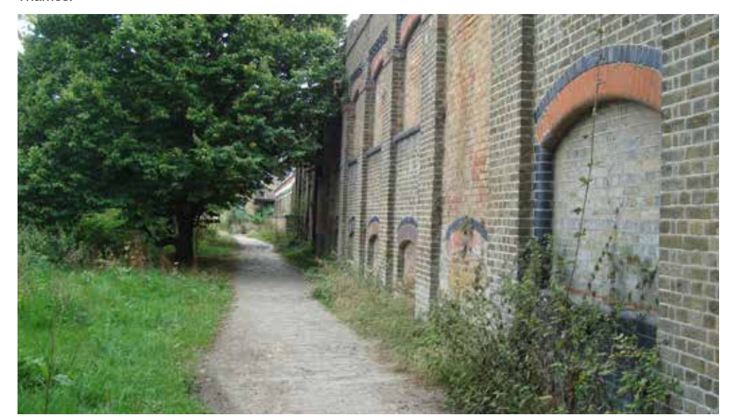
Photograph 4 - View of towpath and existing River Wall forming the north east boundary of the Stag Brewery component of the Site.