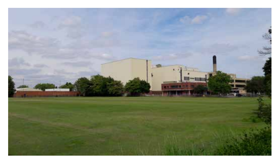
Photograph 1 - View of sports pitch looking towards brewery buildings.