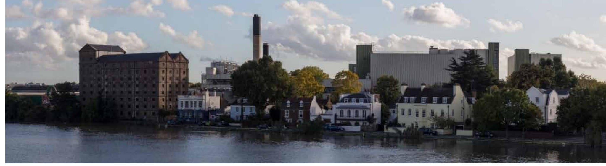
Photograph 2 - View of the Stag Brewery component of the Site with surrounding properties adjacent to the River Thames.