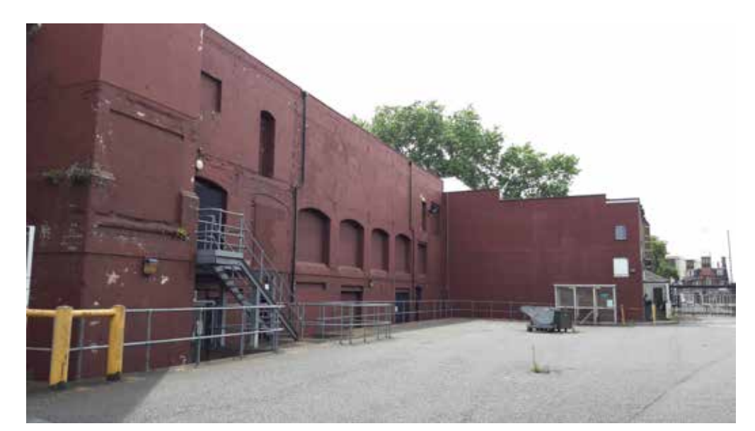
Photograph 6 - Former Hotel and Former Bottling Building.