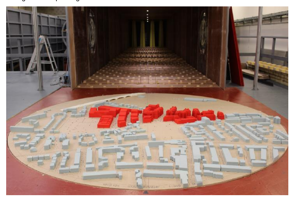
Photograph: Wind tunnel test of the Development with existing surrounds.

It has been identified that if a building entrance were to be located at the west facing façade of Building 16 then this location would be subject to wind conditions that would not be suitable for use. However, as this part of the Development is proposed in outline only, it is considered that this issue be deferred to subsequent reserved matters applications in respect of Building 16. This issue could be addressed in the future by either not proposing a building entrance at this location, recessing the building entrance or through tall tree planting or screens.