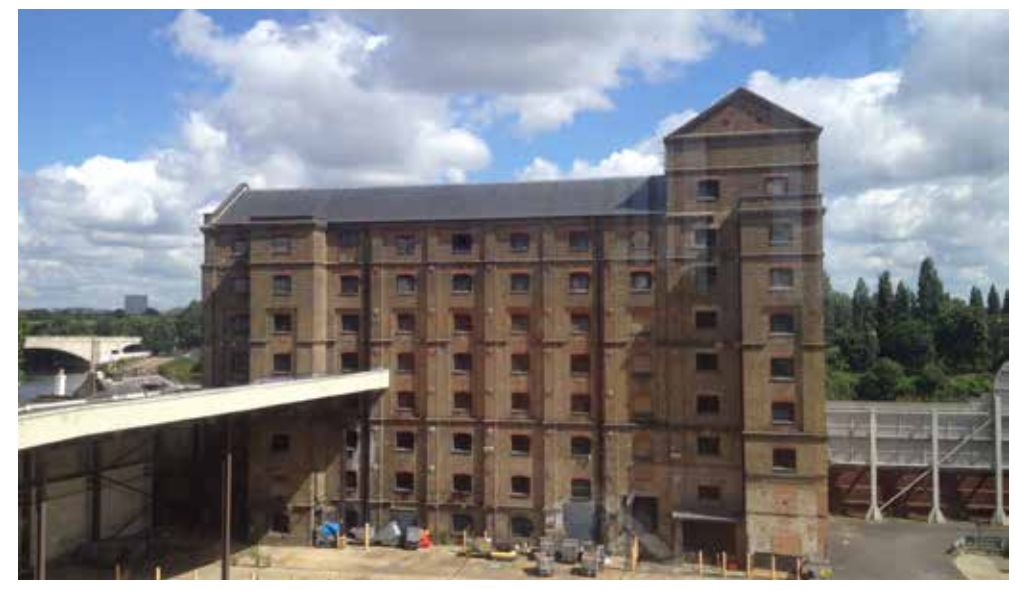
Photograph 5 - The southern facade of the Maltings.