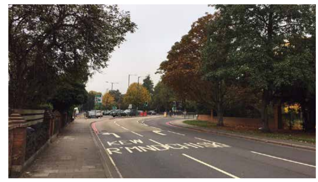
Photograph 3 - VView of Chalkers Corner looking west.