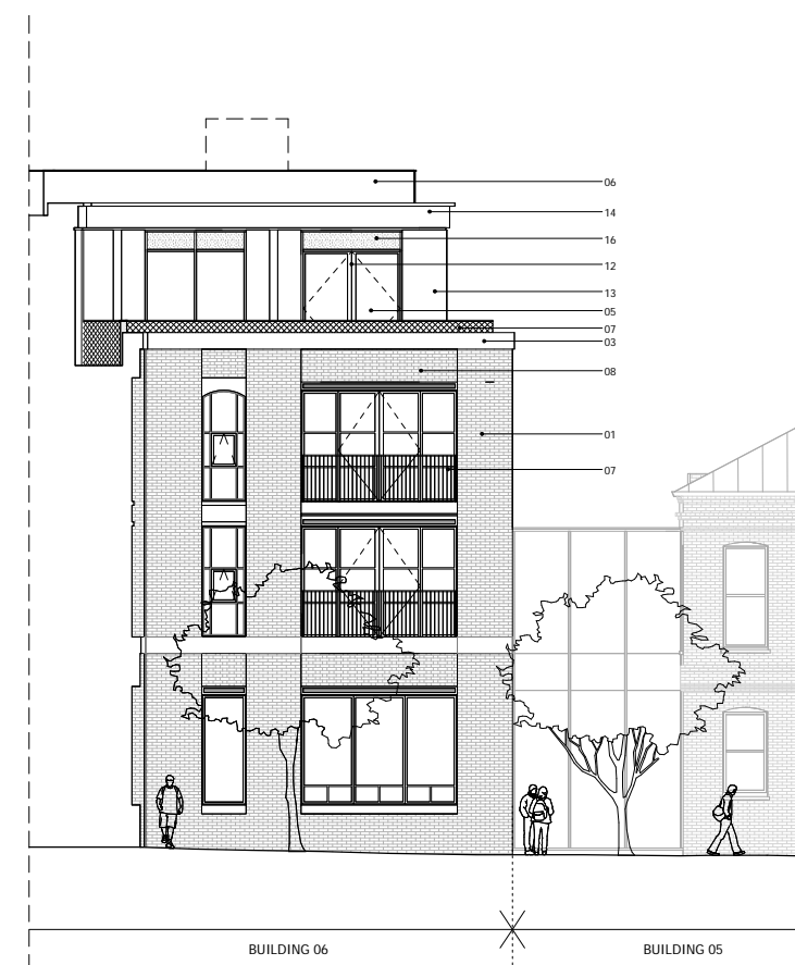
2 PROPOSED SOUTH ELEVATION 02 1 : 100