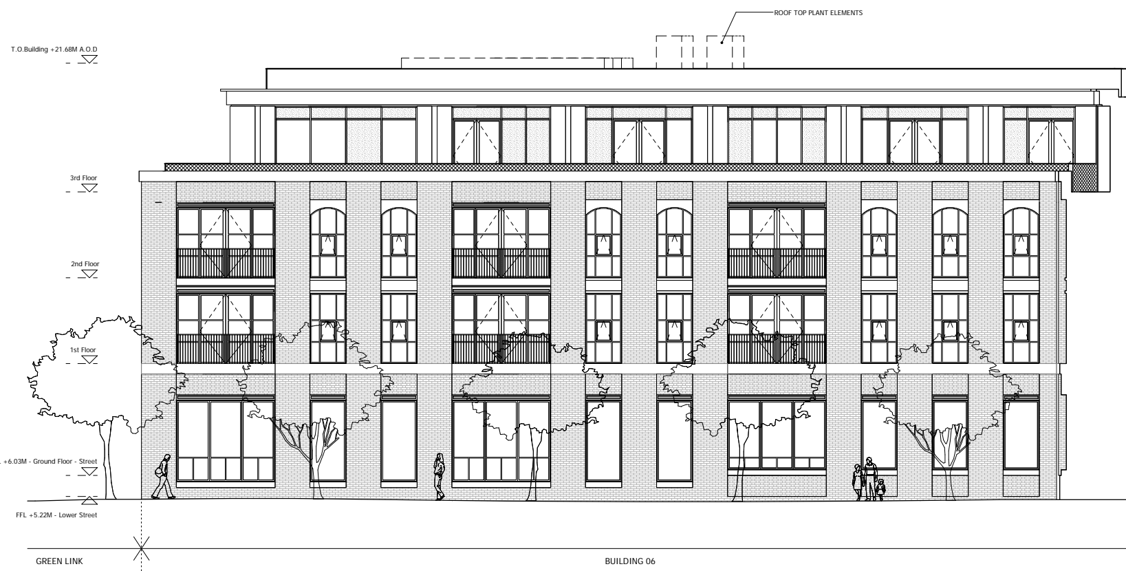
1 PROPOSED SOUTH ELEVATION 01 1 : 100