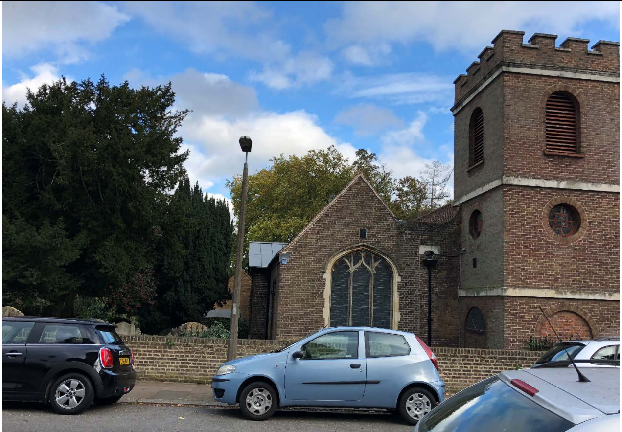
Image no. 2. The proposed extension to link to the existing north portico, shown above with zinc roof cladding.