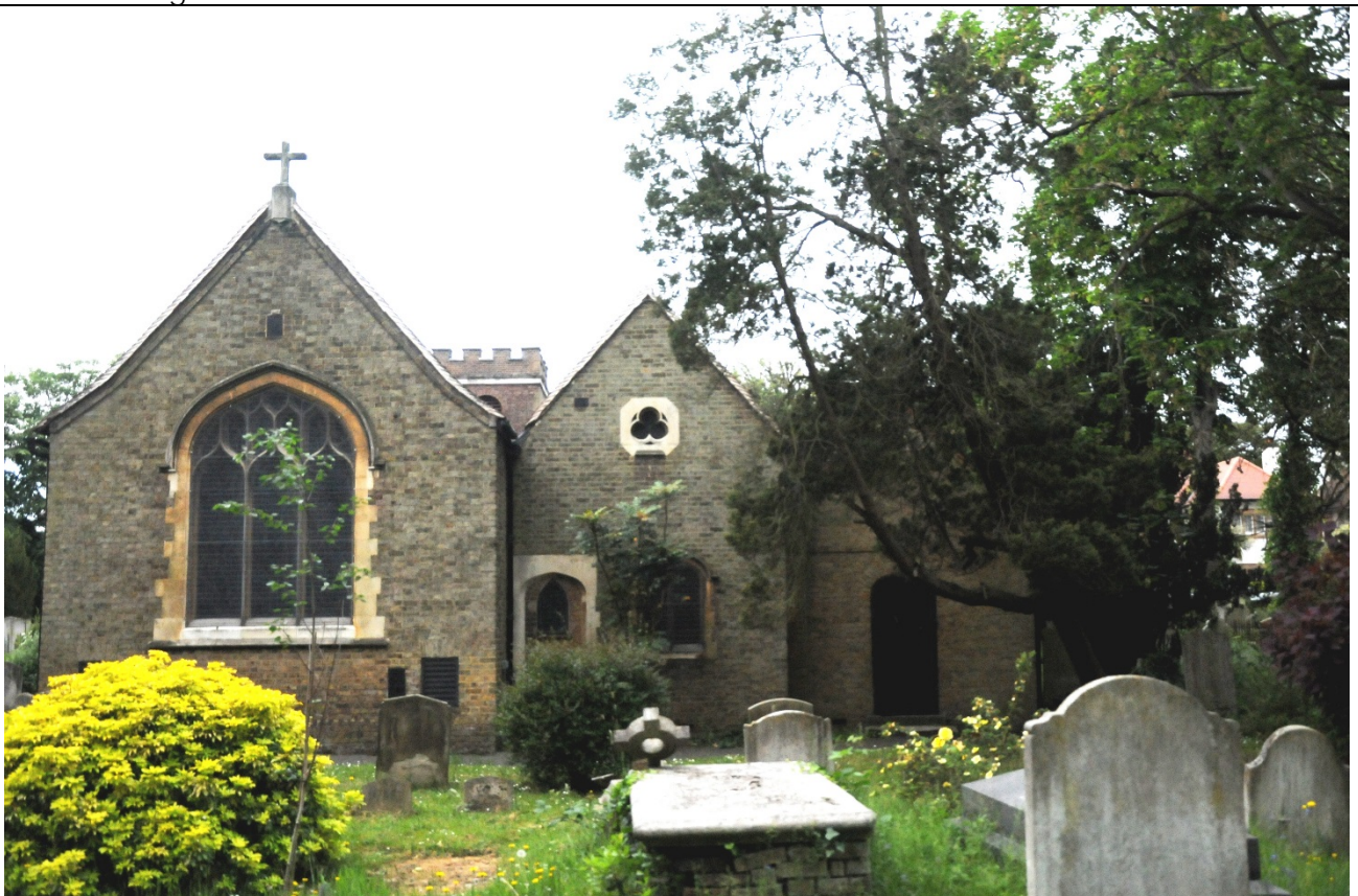
Image no. 3. Showing (from left hand side) the Chancel; the Clergy Vestry and the Choir Vestry which is to be demolished and replaced with the proposed extension. Existing Holly Tree to be