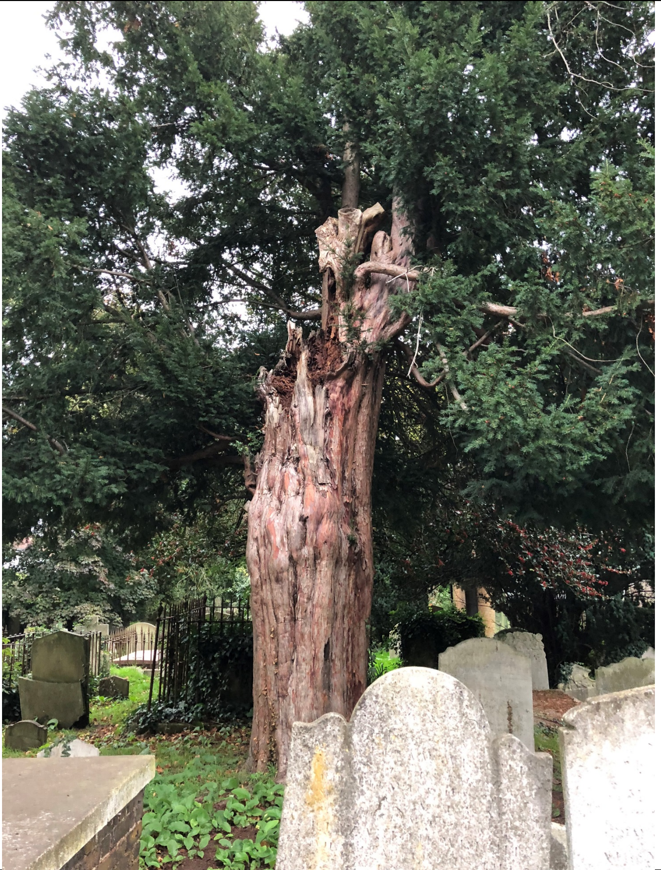
Image no. 4. The Arboricologist has advised that it would be prudent to raise the crown to the east side of the tree to assist in re-balanceing the canopy and reducing strain on the root structure.