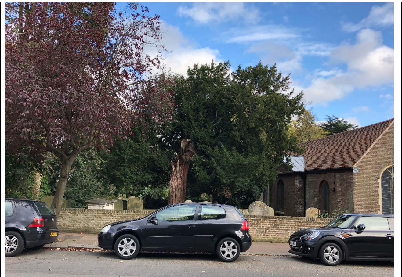
Image no. 1. North west corner of the existing Church. Zinc cladding to north porch visible to north side of the north aisle.